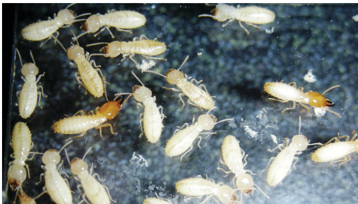
Figure 5. Formosan subterranean termite soldiers (dark heads) and workers.

Subterranean termites (Figure 5) attack wood from their colonies located underground. They can be the most destructive because they attack as a mature colony of 50,000 to several million workers. Damage from subterranean termites is easily prevented by sitting hives off the ground. Lack of ground contact greatly decreases the likelihood that the termites will find your hives. Do not use wood for hive stands, but rather concrete blocks, ant guard stands, or other metal or plastic materials. Ant guard stands coated with a product such as Tanglefoot or petroleum jelly on the legs of the stand will prevent subterranean termite access as well as ant infestations. For more information on subterranean termites, see http://edis.ifas.ufl.edu/ig097 .