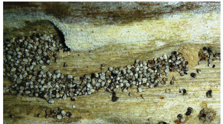
Figure 8. The galleries of drywood termites are excavated through the wood regardless of grain. The walls of the galleries are clean with dry loose fecal pellets.