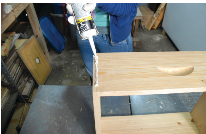
Figure 3. Caulking joints helps seal out moisture.

Tension, torque, and simple abuse tax the integrity of hive equipment; but the biggest threat to wooden beekeeping equipment is water because it rots wood. To protect against moisture, you can use a kiln-dried, rot-resistant wood such as cypress in the construction of your equipment (do not use pre-treated wood). Furthermore, caulking the outside joints of the equipment where rain/moisture can enter is recommended. Run a bead of caulk down the joints on the outside of the assembled equipment. Smear the caulk over the joint with your finger to create a flat but solid seal. Always use a non-toxic, silicone-based caulk for this purpose.