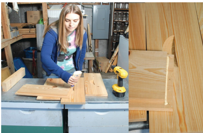
Figure 2. Wood glue should be applied in sufficient amounts before assembling boards with screws.