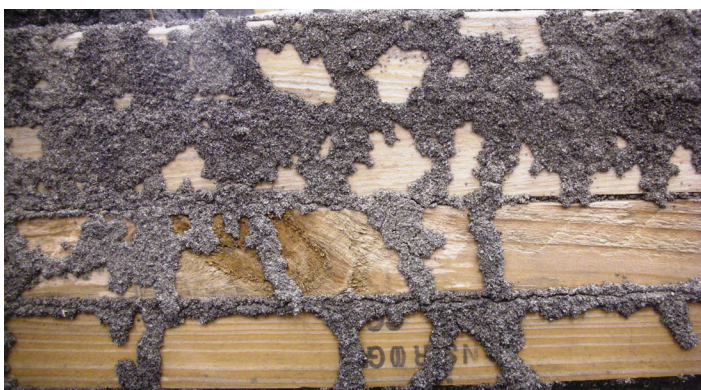
Figure 6. Subterranean termites use mud tubes to travel over exposed surfaces like hive supports. The “mud” is actually composed of soil, feces, and saliva. The tell-tale mud is the best indication of a subterranean termite infestation in your bee equipment or your home.