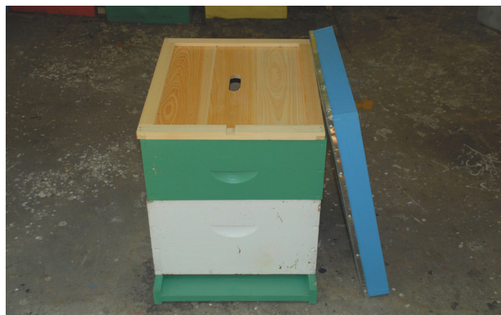
Figure 4. The outer surfaces of the hive should be painted, but do not paint the inner cover, the inside walls of the hive, or the frames.

Outer/migratory hive covers, supers, hive bodies, and bottom boards should be painted with a non-toxic paint registered for outdoor use. The color of the paint is unimportant, but avoid very dark colors because they absorb heat. It is important to put at least two to three layers of paint on the equipment. Inner covers or the inside surfaces of supers should not be painted; painting traps moisture inside of the hive. However, you should paint the entire bottom board. If it is economically feasible, hive equipment should be painted every three to five years. Following these recommendations will prolong the life and functionality of your hive woodenware.