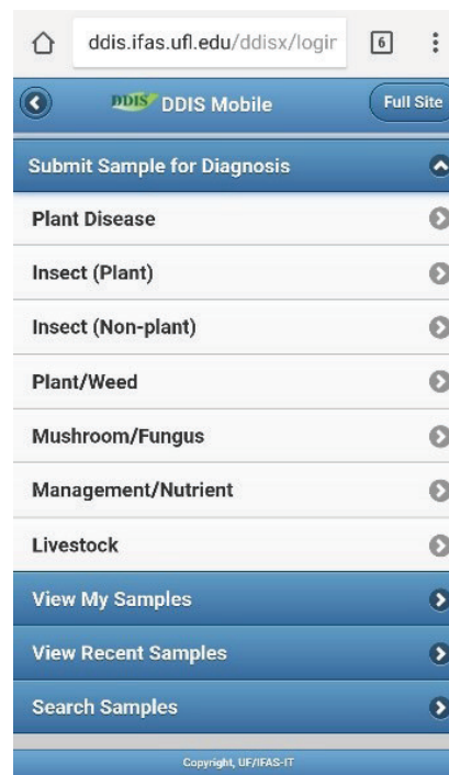
Figure 3. DDIS mobile application sample management interface.

To become a DDIS user, visit the DDIS website ( http://ddis.ifas.ufl.edu ) and select "Become a user" from the home page. Fill in all required fields and follow the on-screen instructions. Diagnosis service accounts are only provided for Florida residents. It is recommended that new users go through the DDIS "Quick Start" and "How To" tutorials. Users may submit a DDIS sample in three easy steps: 1) sign up as a DDIS user, 2) prepare a digital sample, and 3) submit the sample to specialists or clinics.