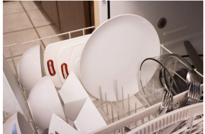
Figure 2. Dishes in a dishwasher.