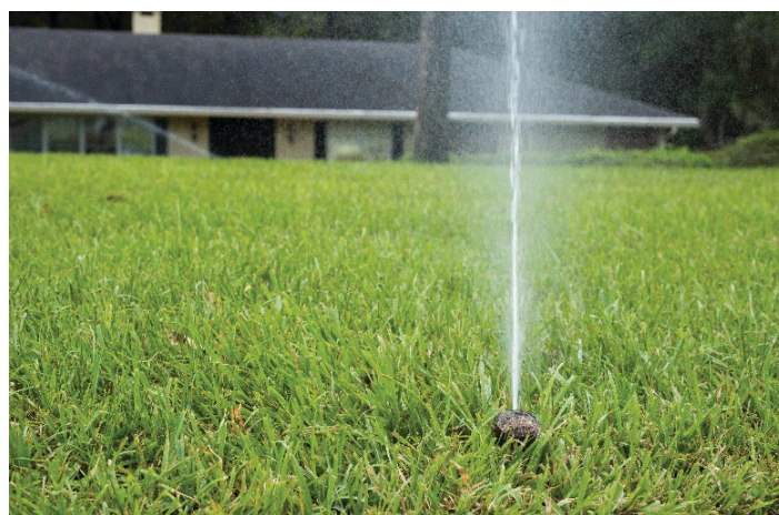
Figure 1. In-ground irrigation at a single-family, detached home in Florida.

UF/IFAS research shows that common issues with irrigation systems include timers being set to water too frequently and/or for too long (Olmstead and Dukes 2020). Florida homeowners with high water use who are looking to save water and save money on their water bill should first look to see if they can reduce their outdoor water use. The goal of this publication is to help readers understand the magnitude of water used for a single irrigation event and encourage them to evaluate their outdoor water use. First, we calculated the estimated gallons of water used per irrigation cycle in Florida. Then, to help readers visualize the magnitude of that water use, we compared the water use of irrigation to other indoor behaviors.