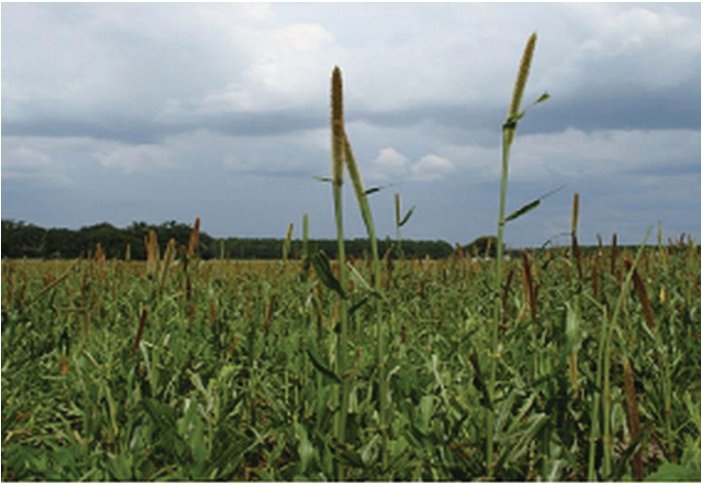
Figure 2. Pearl millet seedhead.

Pearl millet is best adapted to sandy or light loams and moist but well-drained soils. It has good tolerance to drought. Production season is generally from late May to September.