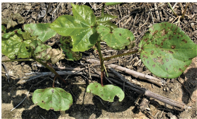
Figure 24. Injury from Roundup + Warrant on Flex Cotton.