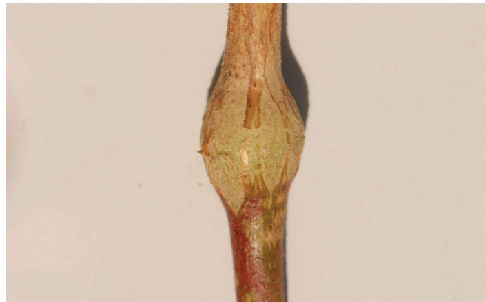
Figure 22. Swelling at the stem of a cotton plant from exposure to preemergence pendimethalin.