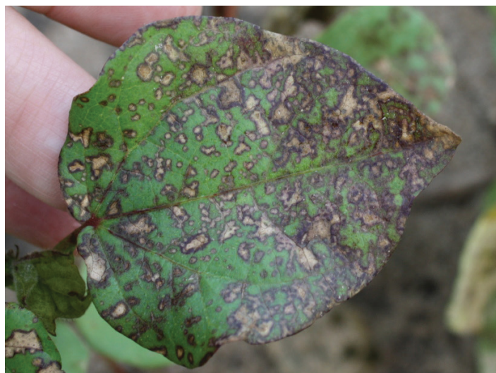
Figure 17. Lactofen injury from a postemergence application. Note speckling and slight bronzing.

*Indicates herbicide labeled for use in cotton.