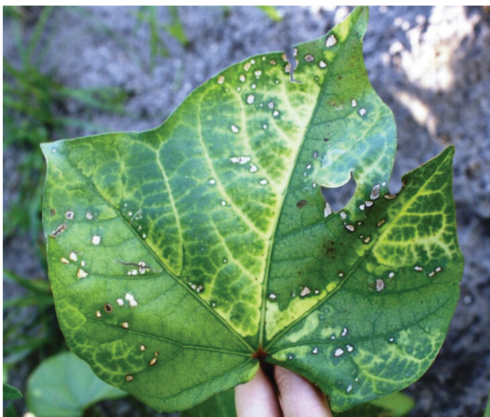
Figure 3. Injury from bentazon applied postemergence. Note the uneven pattern of injury due to bentazon not moving within the plant.