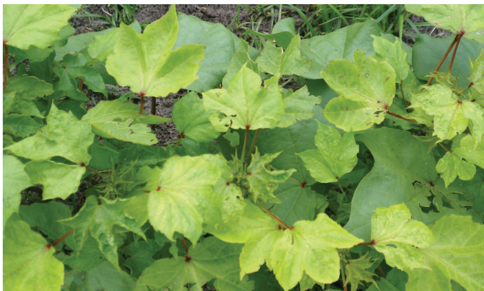
Figure 25. Early glufosinate injury on cotton. Note lime-colored leaves with chlorosis or yellowing.

*Indicates herbicide labeled for use in cotton.