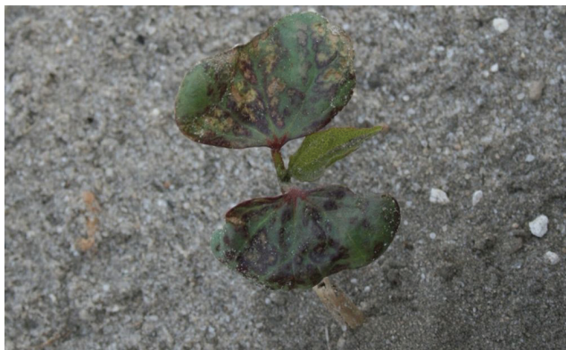
Figure 19. Flumioxazin injury from a preemergence application. Note burning symptoms on newly emerged leaves.