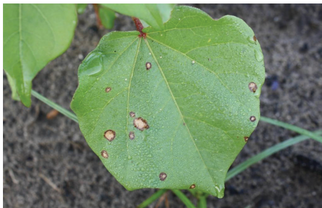
Figure 23. Injury from metolachlor applied postemergence. Note the lesions or burning on the leaf.

*Indicates herbicide labeled for use in cotton.