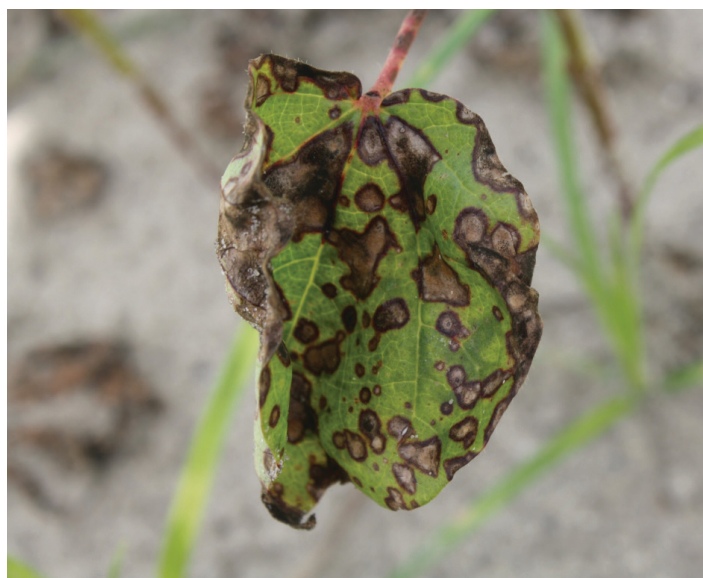
Figure 29. Paraquat injury from a postemergence application. Lesions followed by tissue death are common after paraquat applications.