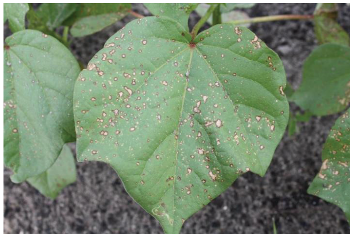
Figure 30. COC injury following an application in hot and humid conditions. Speckled leaf burning can occur after COC is applied.