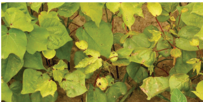
Figure 7. Accent injury from a postemergence application. Note the lime color of injured leaves.

*Indicates herbicide labeled for use in cotton.