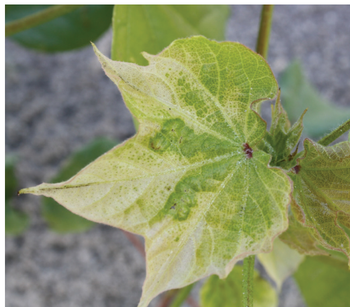
Figure 14. Tembotrione injury from a postemergence application. Note bleaching concentrated at leaf margins.

*Indicates herbicide labeled for use in cotton.