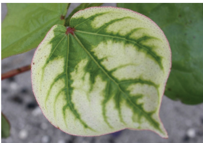
Figure 16. Clomazone injury from preemergence application. Note bleaching at leaf margins.