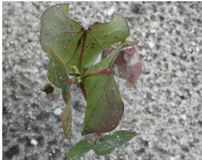
Figure 27. Glyphosate injury on a glyphosate-susceptible cultivar. Note the red veins that are similar to ALS injury symptoms.

*Indicates herbicide labeled for use in cotton.