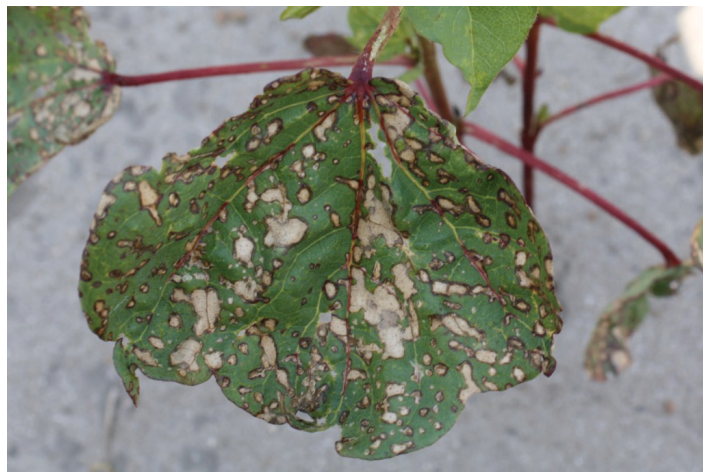
Figure 28. MSMA postemergence injury on cotton. Burning and lesions pictured are typical of MSMA injury.

Symptoms: Crop oils have a tendency to injure cotton when applied in hot and humid conditions. Injury symptoms include leaf burning and spots of necrosis similar to those of the cell membrane disruptors, but without the bronzing.