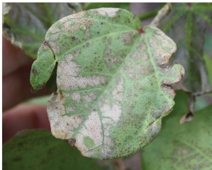
Figure 4. Advanced injury from bentazon applied postemergence. Note the necrosis or its paper bag-like appearance.