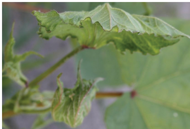
Figure 9. Twisting and cupping following a 2,4-D postemergence application.

Herbicides with This Mode of Action: 2,4-D, dicamba, picloram, triclopyr, aminopyralid, quinclorac (Drive)