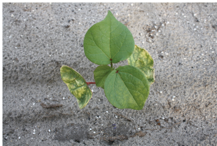
Figure 1. Atrazine injury in cotton from a preemergence application. Note that older leaves have more damage than newer leaves.

*Indicates herbicide labeled for use in cotton.