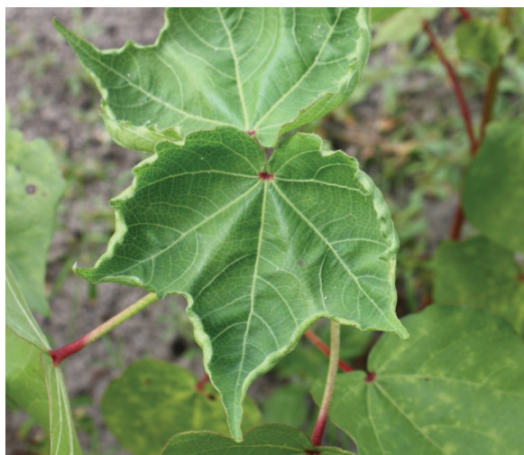
Figure 13. Quinclorac injury from a postemergence application. Note leaf curling and cupping.