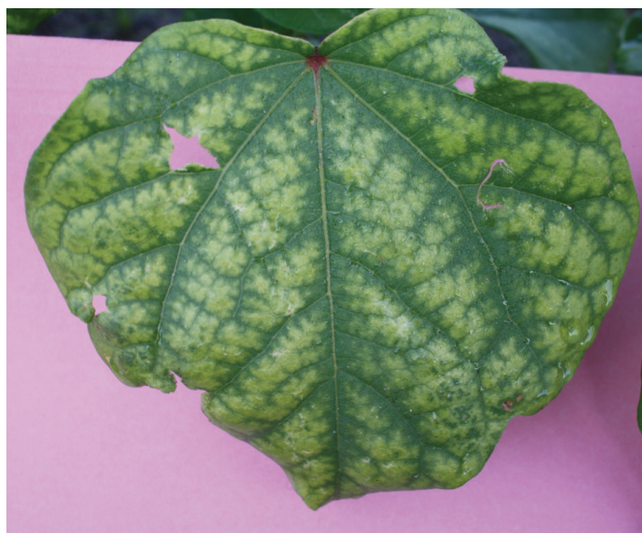
Figure 5. Injury from fluometuron applied preemergence. Credits: Sarah Berger