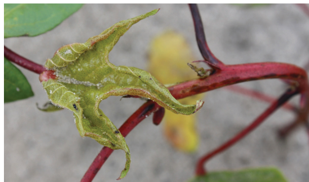
Figure 10. Injury from a 2,4-D postemergence application. Note the malformed leaf and twisted stem.