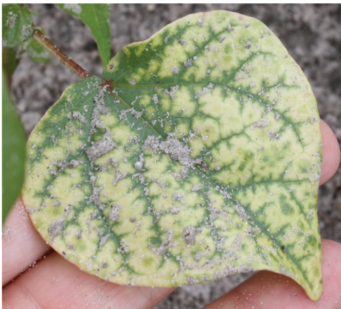
Figure 2. Severe atrazine injury from a preemergence application. Tissue death (or necrosis) will soon develop at leaf margins. Credits: Sarah Berger