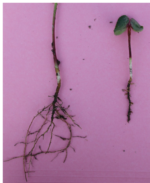
Figure 21. A healthy plant (left) compared to a plant with pendimethalin injury (right). Note the short, club-like roots and overall stunted growth.

*Indicates herbicide labeled for use in cotton.