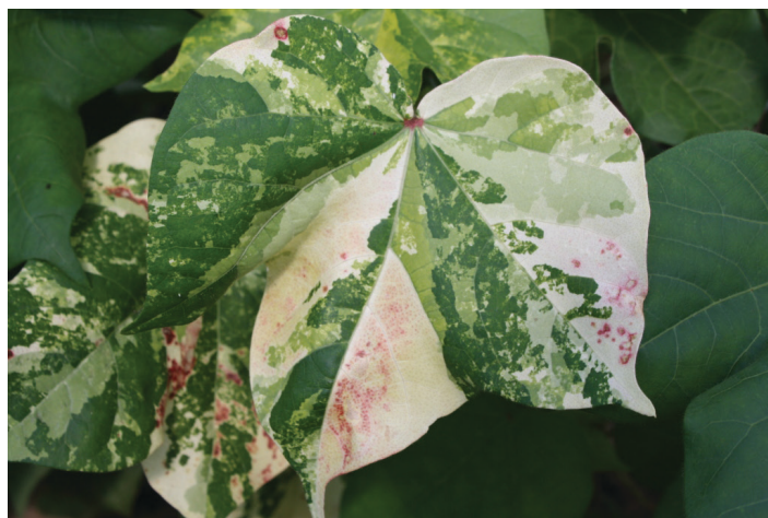
Figure 6. Injury caused by diuron applied preemergence.

Mechanism of Action: The ALS-inhibiting herbicides block the acetolactate synthase (ALS) enzyme. The ALS enzyme is responsible for the formation of essential amino acids (isoleucine, leucine, and valine) in the plant. Without these amino acids, proteins (complex molecules that control all plant functions) cannot be formed and the plant slowly dies.