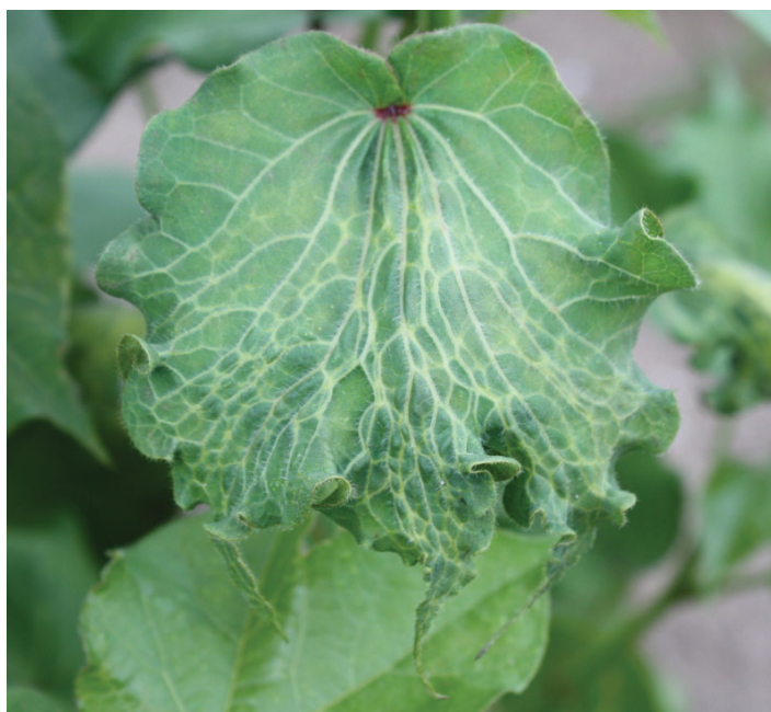
Figure 12. Dicamba injury from a postemergence application.