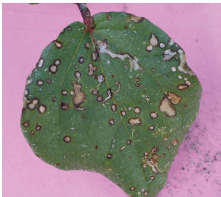
Figure 18. Flumioxazin damage from a postemergence application. Note red halos around lesions.