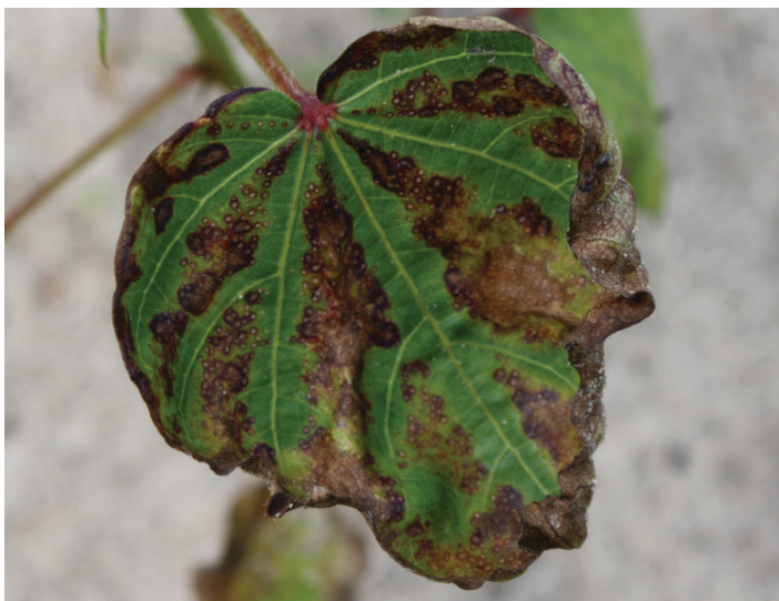
Figure 26. Necrosis (tissue death) following glufosinate application.