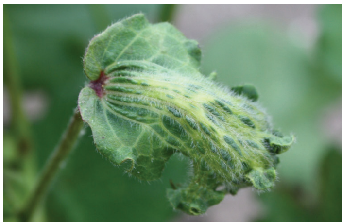
Figure 11. Dicamba injury from a postemergence application. Note the malformed veins and leaf strapping.