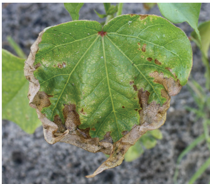
Figure 20. Fomesafen damage from a postemergence application. Note burning damage on leaves, which is typical of PPO-inhibiting herbicides.