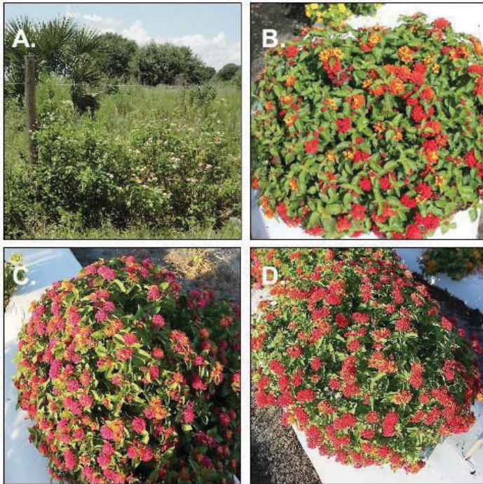
Figure 3. The resident species, Lantana camara (A), and the three cultivars, Luscious Royal Red™ (UF-1013-1; B), Bloomify Rose™ (UF-1011-2; C), and Bloomify Red™ (UF-1013A-2A; D) that were approved by the Invasive Plant Working Group after evaluation using the Intraspecific Taxon Protocol. UF/IFAS approved these three cultivars for recommendation because of their sterility and distinctiveness from the resident species.

grandis , seven cultivars of Ruellia , and nine Lantana camara cultivars. Three of the sterile Lantana camara cultivars have been trademarked and are commercially available (Figure 3). Even though the ITP is used infrequently, it provides a process to evaluate cultivars that may offer viable alternatives to popular agronomic or horticulture species that also happen to be common invaders.