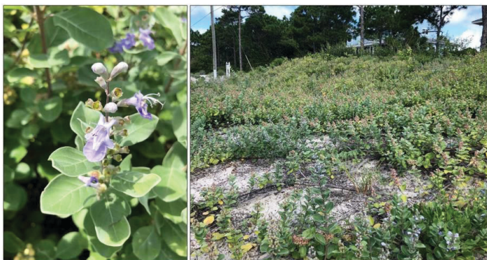
Figure 2. Beach vitex ( Vitex rotundifolia ) is a recent invader to Florida coastal areas. This plant threatens the nesting habitat of sea turtles and ground nesting shore birds. This species was evaluated with the Predictive Tool. It received a score of 21 and is a high risk for invasion.

Questions presented in the Predictive Tool are answered by conducting thorough literature searches, using sources such as herbaria records, agency reports, and peer-reviewed primary literature. The questions in the Predictive Tool address the following areas: