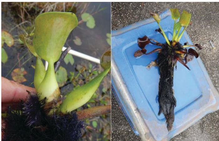
Figure 2. Spongy petioles (left) and dark, feathery roots (right) of waterhyacinth.

The leaves of waterhyacinth are thick, glossy, waterproof, and rounded; petioles (leaf stalks) are spongy and inflated when plants have sufficient space to spread out (Figure 2), and thinner and more rigid under crowded conditions. The leaves are attached at the base of the plant to form a rosette. The long, feathery roots of waterhyacinth are dark purple to black and hang beneath the rosette of leaves (Figure 2). Waterhyacinth produces a spike inflorescence that can be up to 20" tall with 15 or more large, showy individual flowers that are up to 3" tall. Flowers have six lavender-blue to purple petals, and the uppermost petal is marked with a yellow "eye-spot." Although individual flowers only last one or two days, the spike may be showy for as long as a week because a few flowers are open each day (Flora of North America 2020).