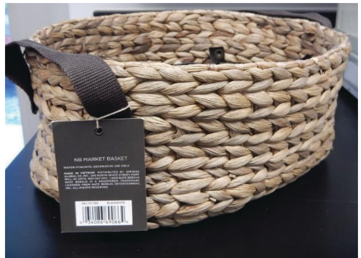
Figure 3. Basket made from waterhyacinth.

The prolific growth of waterhyacinth has caused enterprising individuals to wonder whether the species could be used for any number of economic purposes. For example, in 1897, Webber indicated that waterhyacinth could be used as a fertilizer or soil amendment and as a feed for hogs and cattle. It has been evaluated as a cellulose source in papermaking and is currently used in the production of furniture, baskets (Figure 3), and many other decorative items. None of these uses has been economically viable, but recent studies have focused on the use of waterhyacinth as a source of biofuel and for nutrient removal in sewage treatment plants and other nutrient-rich aquatic systems.