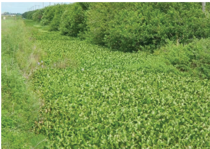
Figure 4. Waterhyacinth infestation in a Florida canal.

fishing, and swimming impossible. Also, dense populations block light penetration through the water column, which greatly reduces or prevents oxygen production by shading out submersed plants and phytoplankton, thus reducing oxygen concentrations to levels that are dangerous for fish and other aquatic wildlife.