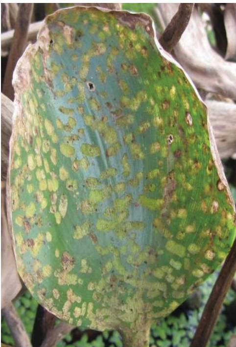
Figure 5. Biocontrol insect feeding damage on waterhyacinth.

mentioned earlier, waterhyacinths clogged the St. Johns River for decades after the species' introduction and were brought under control only when synthetic herbicides were discovered in the 1940s. As of 2024, there were 17 herbicide active ingredients labeled for use in aquatic systems in Florida (UF/IFAS CAIP 2024). Herbicide selection is based on water use, selectivity (to reduce damage to desirable native plants growing nearby), and cost. A number of herbicides can be applied as foliar sprays to selectively control waterhyacinth. Contact herbicides—including diquat, flumioxazin, and endothall—are quickly absorbed by plant tissue and are fast-acting, whereas systemic herbicides—including 2,4-D, glyphosate, imazamox, penoxsulam, and bispyribac—provide slower but effective control. For more information about efficacy of aquatic herbicides, please see EDIS publication AG262, Efficacy of Herbicide Active Ingredients against Aquatic Weeds , at https://edis.ifas.ufl.edu/ag262 .