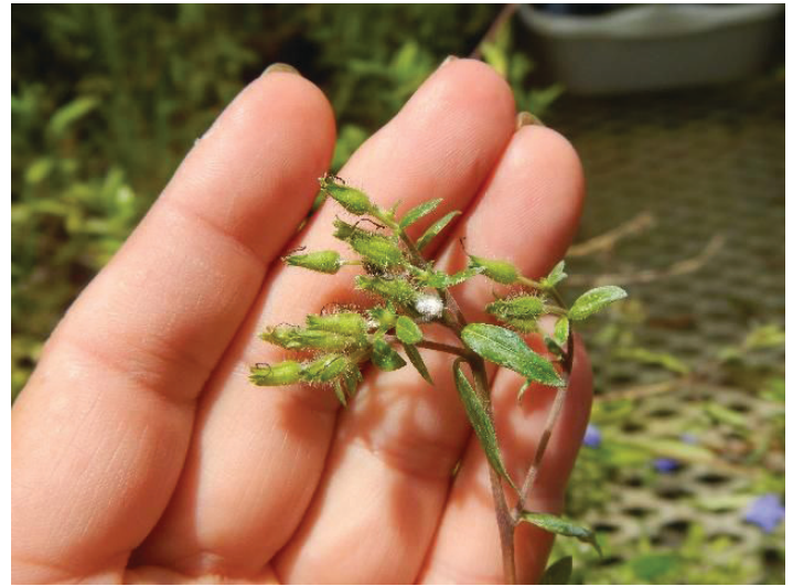
Figure 3. Unripe seed capsules.

Skyflower dies back to the ground when the weather turns cool in most areas; overwintering rhizomes produce new shoots in early spring, and flowering occurs from late spring through early fall. Unopened flower buds are protected by sepals (green, leaf-like structures) that are lanceolate and appear fuzzy because they are densely covered with fine hairs. Flowers are a clear, brilliant blue and are borne in cymes or leafy panicles (clusters). The species is hermaphroditic, meaning flowers have both male and female reproductive structures. Seeds are produced after pollination with the bright-orange to gold pollen, which is usually transferred by bees. Unripe seed capsules are green and covered with dense hairs and turn dark brown as they ripen. Each ripe capsule contains copious amounts of small seeds that germinate readily without special treatment. Skyflower can also be propagated by cuttings, by division, or by removing and potting up the numerous suckers produced by the species.