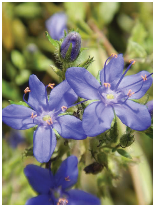
Figure 1. Flowers of skyflower.