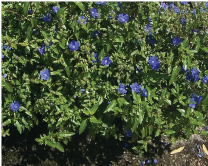
Figure 4. Skyflower plants.

As indicated earlier, skyflower grows well in moist soil and has the potential to be an excellent addition to moist areas of the garden or landscape. However, few nurseries have skyflower available for purchase, so finding plants to add to the landscape can be a challenge. Little is known regarding the cultural requirements of skyflower, but the species seems to grow well in most types of moist soil and responds well to fertilizer applications. Although skyflower is a perennial, the plant dies back in winter, and regrowth occurs from rhizomes in the spring. It may need to be replanted annually from seeds to maintain cultures of robust flowering specimens.