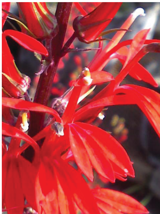
Figure 2. Flowers of cardinal flower.

depressions, woodland edges, stream banks, roadsides, meadows, swamps, and areas near lakes and ponds (USDA NRCS 2015). It is native to 42 counties in Florida from the panhandle to central Florida and is found primarily in north Florida. Populations of cardinal flower are also native between southeastern Canada and southeastern US, in Mexico, and from Central America to northern Colombia (USDA NRCS 2015). Plants are hardy in USDA Zones 3 through 9. Cardinal flower depends on hummingbirds for pollination.