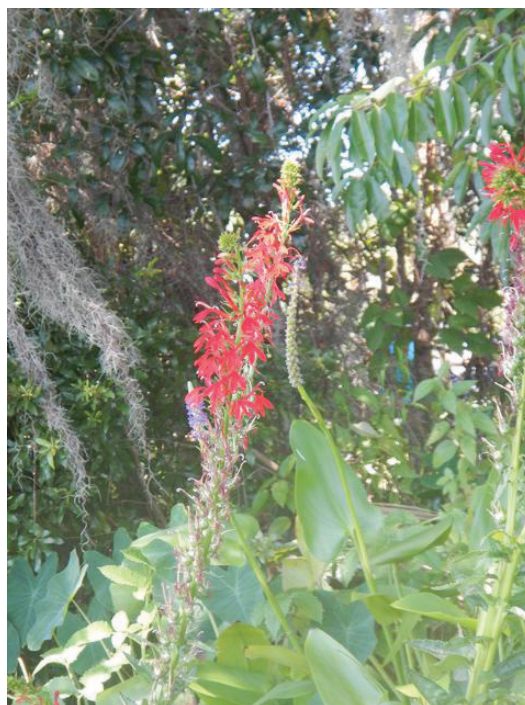
Figure 1. Cardinal flower in the field.

Cardinal flower is an herbaceous, native, erect, aquatic perennial plant that is commonly found in wet environments such as stream banks and swamps (Figure 1). The leaves of cardinal flower are 8 inches long and 2 inches wide. They are alternate, toothed, pointed at the ends, and either oblong or lance-shaped. This plant has showy, irregular, and tubular red flowers with 8-inch terminal spikes that are often over-picked in the wild. The flowers' upper portions have two lobes, and their lower portions are divided into three parts (Figure 2). The common name "cardinal flower" refers to the bright red robes worn by Roman Catholic cardinals. The fruit is a bell-shaped or oblong capsule that is about 4 inches long. Seeds are abundant, minute, brown, and elliptic to linear in shape. Cardinal flower can be used in landscaping as a wildflower in a moist garden, edging along a water garden, an understory plant in wet woods, a part of stream edge planting, and a member of a native plant or hummingbird garden.