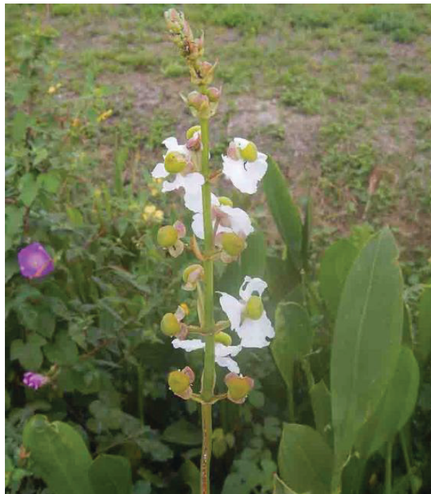
Figure 4. Duck potato in the field.

Duck potato should be planted no deeper than 12 inches in a water garden and remain in full sun.