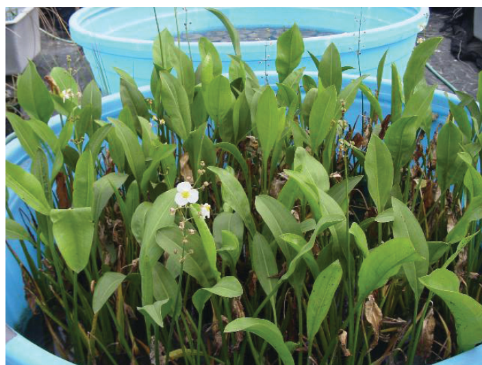
Figure 1. Duck potato leaf.

Duck potato, or lanceleaf arrowhead, is an herbaceous, aquatic, native, monocotyledonous perennial plant that commonly grows in swampy ground or standing water in ponds, lakes, streams, and ditches and typically blooms in the spring. The large lance-shaped leaves grow from underground rhizomes and are 4 inches wide and up to 2 feet long (Figure 1). Duck potato flowers grow on stalks that are taller than the leaves. The showy flowers have three white petals and three green sepals (Figure 2). This plant is commonly referred to as duck potato because of its large potato-like corms that form underground. The fruit is a greenish-blue achene, and the fruiting heads contain many small, hooked seeds. This plant can be used as an emergent along pond and lake edges or in aquatic gardens. It is not considered salt-tolerant; instead, it prefers sand, loam, or organic soil.