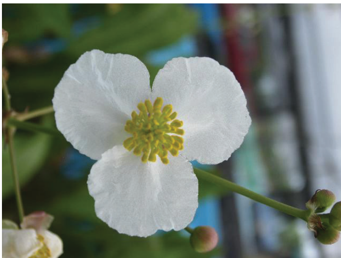
Figure 2. Duck potato inflorescence.