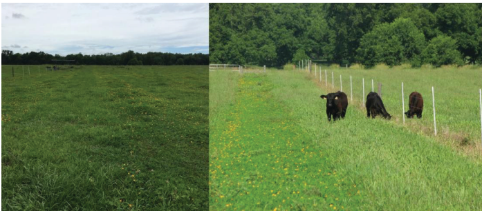
Figure 4. Established strip-planted Ecoturf rhizoma perennial peanut-Argentine bahiagrass pastures under grazing at UF/IFAS NFREC in Marianna, FL.

Integrating rhizoma perennial peanut into grazing systems can reduce nitrogen fertilization requirements and feed supplementation during the warm season. Strip-planting is a viable option to reduce rhizoma peanut establishment cost compared to an RPP monoculture. Additionally, strip-planting helps to facilitate weed management, compared to sprigging into a living grass stand. In this study, overseeding warm-season grass-legume pastures with a blend of cool-season grass-legume mixtures extended the grazing season and resulted in livestock performance equivalent to that of N-fertilized grass systems. Minimizing N fertilizer inputs reduces not only ranch production costs, but also some of the environmental problems related to the use of N fertilizers.