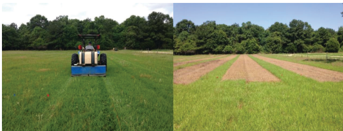
Figure 1. Glyphosate application to prepare strips prior to planting rhizoma perennial peanut.

Strip-planting RPP can reduce establishment cost, because only 50% of the total area is planted. Matching the width of the RPP strip with the equipment width (e.g., spriggers, sprayers, haying equipment) is a practical option. At the UF/IFAS North Florida Research and Education Center in Marianna, researchers planted 9-ft wide RPP strips between 9-ft wide bahiagrass strips. If bahiagrass pastures are already established, the existing sod must be killed with glyphosate prior to planting the RPP (Figure 1). This can be done during the previous fall; if needed, glyphosate can be reapplied prior to planting in the spring. If bahiagrass and RPP are being established at the same time, it is important to make sure soil moisture is adequate, then prepare the seedbed and plant both species in early spring. Commercial sprigging services are available because of the specialized equipment needed. Equipment for planting includes a digger and sprigger (Figure 2).