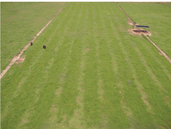
Figure 5. Strip-planted rhizoma perennial peanut (RPP) seven years after establishment in UF/IFAS NFREC Marianna, FL. Dark-green strips are RPP strips mixed with bahiagrass.