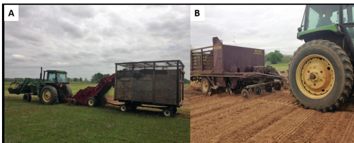
Figure 2. Rhizoma perennial peanut sprig digger (A) and sprig planter (B).