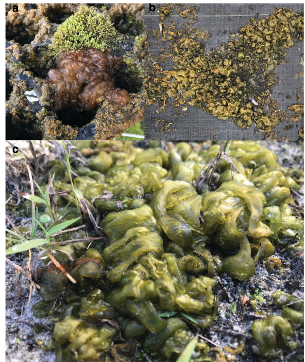
Figure 2. Images of Nostoc macroscopic colonies commonly found in the field on a) plastic containers, b) greenhouse tarp, and c) sandy and limestone ground.

These mats desiccate and become flaky during dry periods, but in the presence of water or any moisture, they swell to form thick, dark green, gelatinous masses that can completely cover container production areas. This taxon is unsightly, but more importantly, it is extremely slippery and wet. This poses serious health hazards to nursery employees. Another concern is their ability to produce cyanotoxins and allelopathic compounds (Kleinteich et al. 2018), which can affect plant growth and physiology. Although cyanobacterial mats can be a nuisance, they are an important component of soils due to their water-holding capacity and ability to fix atmospheric nitrogen and sequester carbon into soils (Sangeetha et al. 2013; Singh et al. 2016). Also, certain Nostoc species can form symbiotic relationships with plants (e.g., N. cycadeae A.M. Watanabe et Kiyohara) or fungi to form lichens (e.g., N. lichenoides Vaucher ex Řeháková et Johansen). Furthermore, the species N. ellipsosporum Rabenhorst ex Bornet et Flahault has been found to produce a protein called cyanovirin-N, with antiviral activities against HIV (human immunodeficiency virus), FIV (feline immunodeficiency virus), and herpes (Dey et al. 2000).