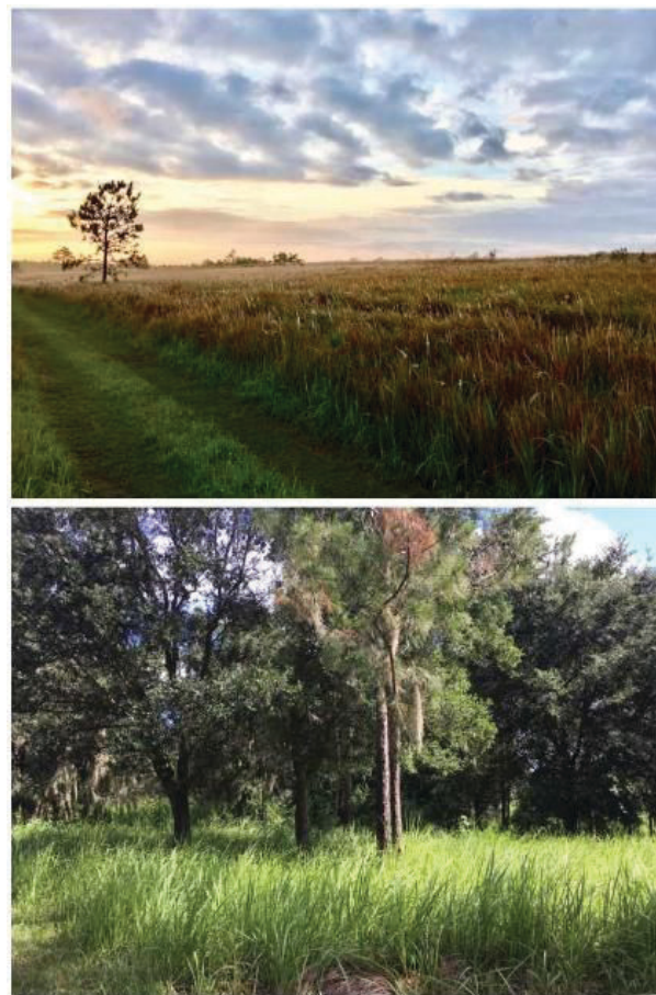
Figure 1. Two examples of cogongrass ( Imperata cylindrica ) invasions in central Florida, one in an open field and the second in a forested natural area. Cogongrass is a federally listed noxious weed. All interstate or foreign movement of this listed species is prohibited.

“Any living stage of a parasitic or other plant which may be a serious agricultural threat in Florida; have a negative impact on endangered, threatened, or commercially exploited plant species; or if the plant is a naturalized plant that disrupts naturally occurring native plant communities” (FDACS 2019b).