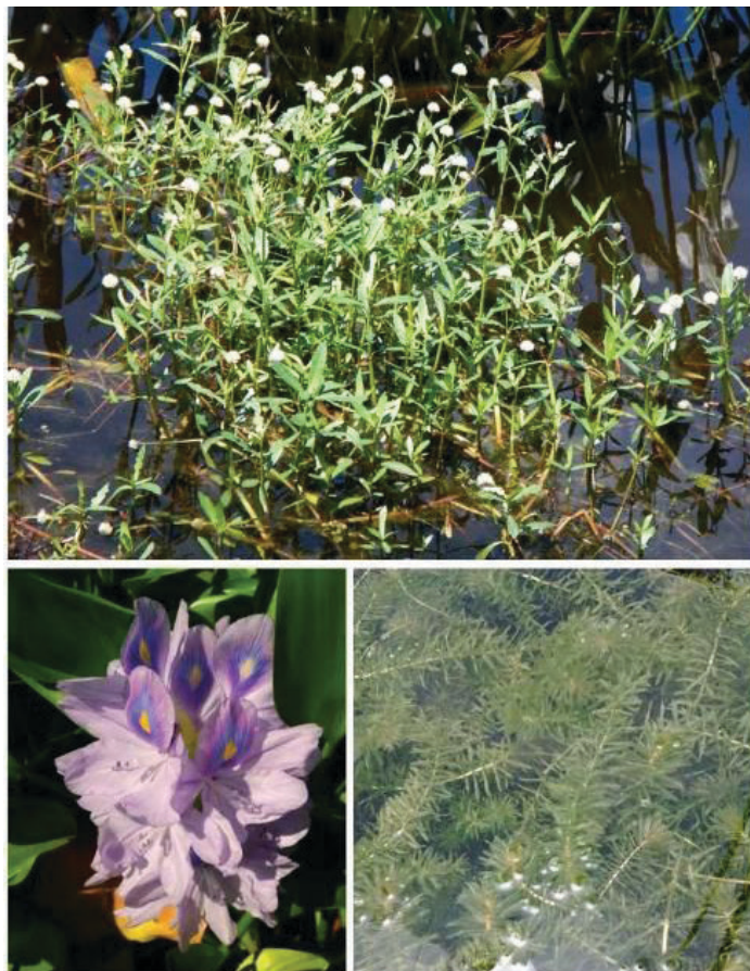
Figure 3. Alligatorweed ( Alternanthera philoxeroides ), waterhyacinth ( Eichhornia crassipes ), and hydrilla ( Hydrilla verticillata ). All three species are on the Florida Noxious Weed List, and hydrilla is also on the Federal Noxious Weed List. FDACS DPI oversees and enforces the Florida Noxious Weed List.

Species on the FISC Plant List are grouped into two categories based on the level of ecological impacts the plant causes. Category I invasive plants have been shown to alter “native plant communities by displacing native species, changing community structures or ecological functions, or hybridizing with natives” (FISC 2023). This conclusion relies on documented evidence of ecological damage; it does not rely on the economic severity or geographic range of the invasion. Category II invasive species are plants that have “increased in abundance or frequency but have not yet altered Florida plant communities to the extent shown by Category I species” (FISC 2023). These species may be promoted to Category I species if they become more invasive and more ecological damage is observed. Many species appear on the FISC list as well as on the federal and state lists (indicated in the “Govt. List” column). The list includes a “Zone” column to document where a particular plant is likely to have the most serious impacts (north, central, or south Florida). You can access the FISC Plant List here .