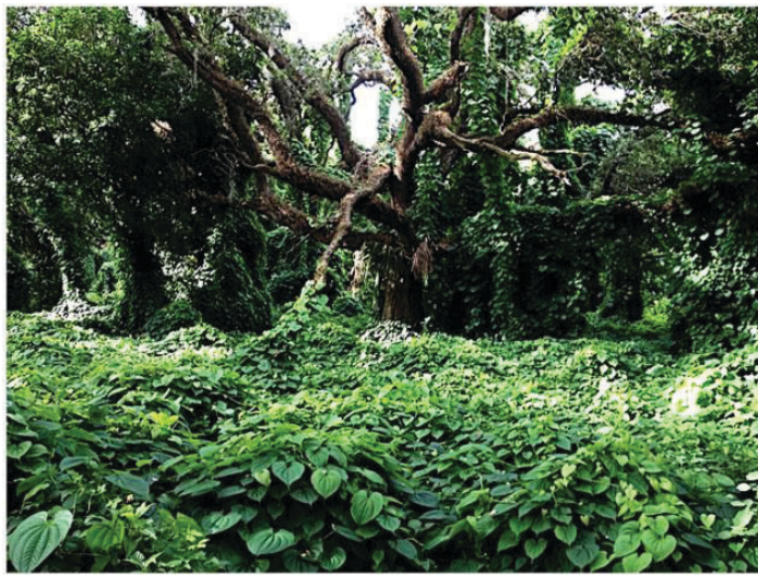
Figure 2. Air potato ( Dioscorea bulbifera ) invasion in south Florida (Broward County). Air potato is on the Florida Noxious Weed List. FDACS DPI oversees and enforces this list.

the department. These species shall not be imported or collected from the wild. They must be contained in such a manner so as to prevent the dissemination from the nursery premises.” In other words, these plants can be grown by nurseries, provided the nurseries have a state-issued permit and only sell the plants to customers outside Florida. Some of these plants—including Australian pine ( Casuarina spp.), melaleuca, and hydrilla—are also on the Federal Noxious Weed List. However, others are only major problems in Florida, including alligatorweed ( Alternanthera philoxeroides ) and waterhyacinth ( Eichhornia crassipes ) (Figure 3). You can access the full list here .