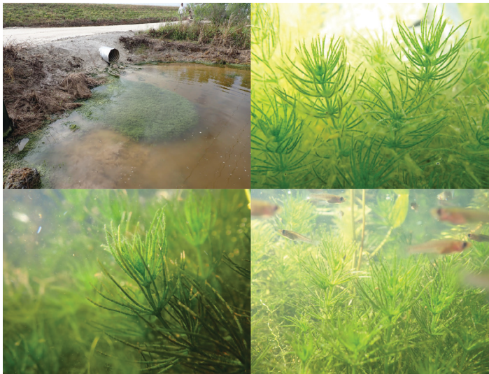
Figure 1. Images of Chara in the field, including large beds that create underwater habitats for aquatic life.

differentiated at the apex, nodes, and basal region. The basal region consists of colorless rhizoidal branches, which are used for attachment to muddy or silty substrates. The rhizoids of these algae do not uptake nutrients; rather, these algae translocate nutrients from the water column via cell-to-water interface (Perez et al. 2014).