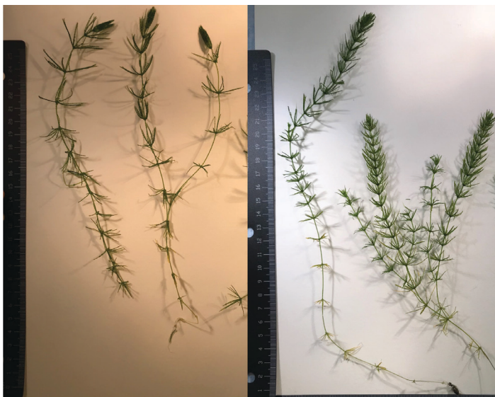
Figure 4. Chara plants. Left: Chara zeylanica . Right: C. haitensis .

Florida. In the field, Chara can often be mistaken for Nitella or coontail ( Ceratophyllum demersum L.) due to superficial similarities in morphology. Although the genus Chara is the richest in species number within the order, species discrimination is complicated. Morphological identification is based on features of the stem—such as length and number of spine cells, length of stipulodes (needle-shaped structures), and cortication—and reproductive structures, and many of these features overlap among species. Two species of Chara abound in south Florida waters— Chara haitensis Turpin and C. zeylanica Klein ex Willdenow—and their morphology is very similar. The main differences between them are that C. haitensis has longer lengths, larger stem diameters, and longer branches than C. zeylanica . Visually, C. haitensis appears longer and finer, while C. zeylanica appears shorter with more pointed branchlets (Figure 4). Because Chara species are morphologically similar, simultaneous morphological and genetic analyses are warranted for more reliable identification.