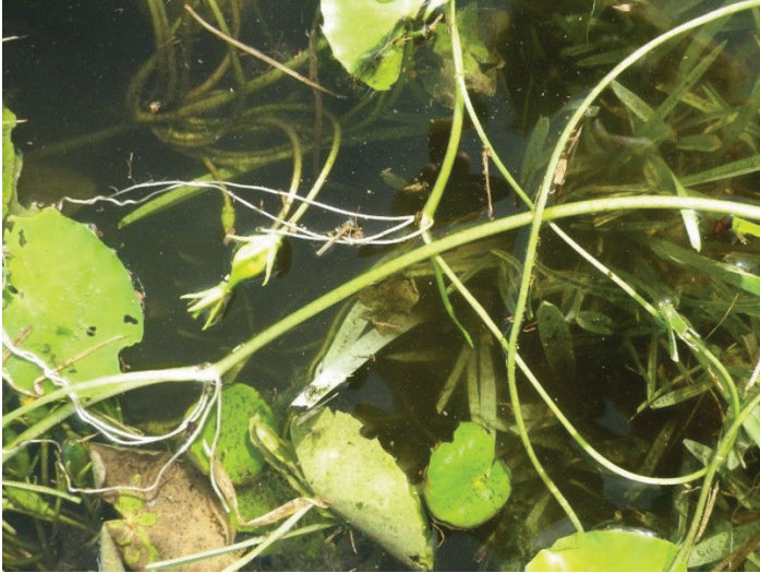
Figure 8. Adventitious roots on yellow floatingheart stems.

in significant infestations once water levels are returned to their normal state. Ramets that are buried under as little as 4 cm of soil rarely sprout, so benthic barriers may reduce the number or density of populations that are derived from ramets. No floatingheart-specific biocontrol agents have been identified for these species, although the aquatic larvae of a native generalist moth reportedly consume native floatinghearts.