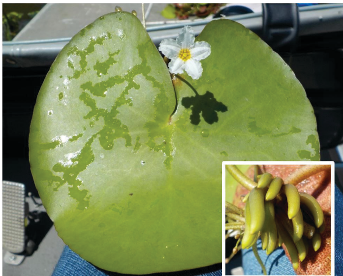
Figure 2. Bananalily (inset: ramet).

Bananalily ( N. aquatica ) is found throughout the eastern and central United States. The leaves are oval to kidney-shaped, with a dark-green upper surface and a purple corky underside that often has prominent veins. Flowers range from \frac{1}{5} to \frac{3}{4} inch wide and have five white, smooth petals with a papery margin and a yellow center.