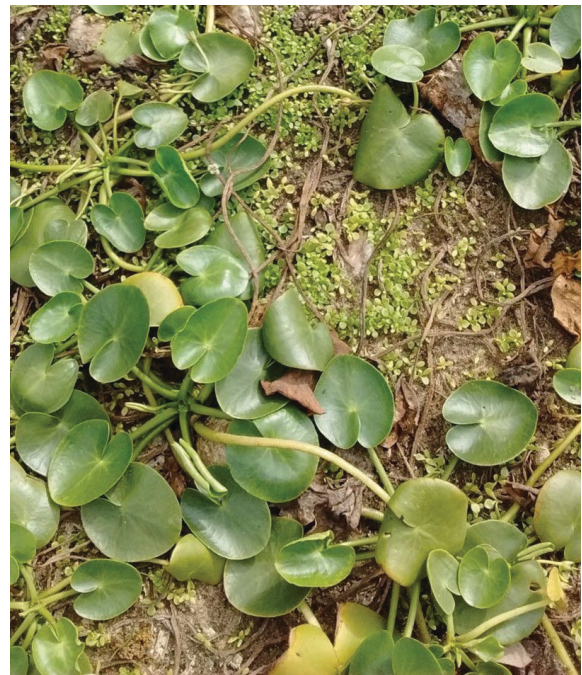
Figure 9. Humboldt's floatingheart mother plants and seedlings in a dry canal in Puerto Rico.

of existing populations and to reduce the likelihood of new introductions to connected waterways. The use of most control methods is limited due to the multiple reproductive strategies utilized by non-native floatinghearts, but several chemical control tools can be used to manage populations of invasive members of the genus Nymphoides .