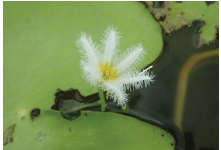
Figure 5. Water snowflake.

Water snowflake ( N. indica ) is native to tropical Asia and Africa. The thick, fleshy, round leaves measure up to 7 inches across and are bright green on the upper and lower surfaces. Each flower has six to twelve white, densely fringed petals that are covered with hairs, and multiple flowers may be associated with a single leaf. Water snowflake reproduces mainly via seed but can propagate effectively through vegetative means such as stem fragments.