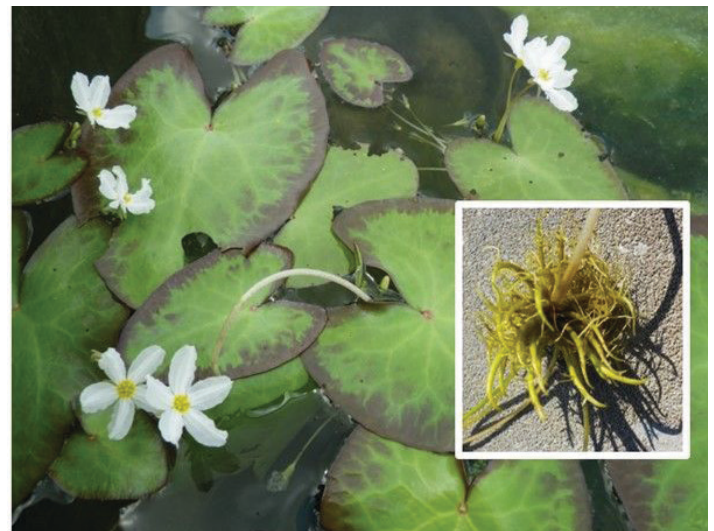
Figure 3. Crested floatingheart (inset: ramet).

Crested floatingheart ( N. cristata ) is native to southeastern Asia. Leaves are up to 8 inches long, 6 inches wide, and heart-shaped; the upper surface of the leaf is green, usually with a red margin, and the underside is smooth and reddish. This species produces white five-petaled flowers that are up to 1 inch across and have a membranous margin and a crest or ridge running down the center of each petal. Similar to the native floatinghearts, the primary method of reproduction for crested floatingheart is via spiky ramets, which float through the water column and eventually sink to the bottom where they can root and sprout to form new plants. A single founder plant can produce as many as 500 ramets over six months, and 40% of these are likely to sprout, resulting in around 200 new plants. If those plants are as productive as the founder plant, a population could expand from the original single plant to more than 20,000 plants in under two years (Gettys et al. 2017). Seed production by crested floatingheart is not well understood, but this species has reportedly hybridized with bananalily (Harms et al. 2021) and therefore seems able to reproduce via seeds.