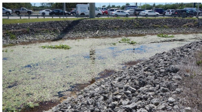
Figure 1. Crested floatingheart in a canal in Naples, Florida.

manage non-native floatinghearts in their reservoirs and lakes. In addition to these direct and immediate threats to the ecosystem, hybridization between native species (bananalily and little floatingheart) and between non-native and native species (crested floatingheart and bananalily) has been documented in South Carolina (Harms et al. 2021; Tippery and Les 2013). Hybridization events have the potential to change the gene pool, which could result in greater representation of “aggressive” traits, and could also impact management options.