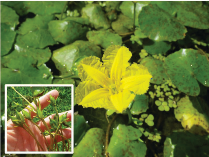
Figure 4. Yellow floatingheart (inset: seed capsules).

Yellow floatingheart ( N. peltata ) is native to Central Europe and Asia Minor, where it occurs in temperate and subtropical climates. Leaves are oval to heart-shaped with a wavy or scalloped margin and are attached to the stems in an opposite manner. Leaf size and shape are dependent upon season; plants produce small leaves in winter, and spring to early summer bring small folded leaves that open more when temperature and daylight increase. The upper surface of the leaves is green to yellow-green and the underside may be maroon or purple. A bright-yellow, five-petaled flower that measures up to 2 inches across is produced at each leaf. The flower has a broad membranous margin that is wavy to ruffled, which creates an irregular fringe along the edge of each petal. Yellow floatingheart does not seem to produce ramets, but instead produces stolons that grow through the water column and along the bottom of slow-moving water bodies. Stolon fragments produce adventitious roots and form young plants with a single leaf, but the primary mode of reproduction for yellow floatingheart appears to be seed production. Each flower produces a seed capsule that splits at the end of the growing season and releases many smooth seeds with winged margins. The seeds float until a disturbance causes them to break the water surface; they then sink, remain dormant through the winter and sprout in the spring.