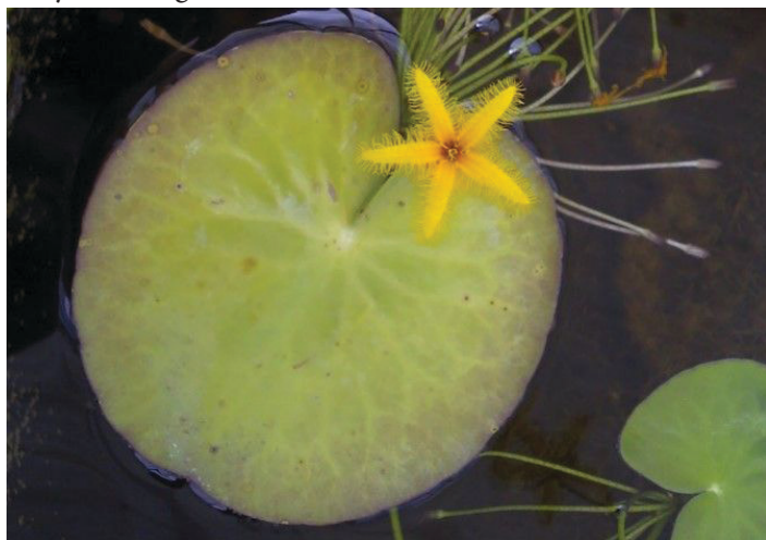
Figure 6. Gray's floatingheart.

classifies the species as non-native. Wunderlin et al. (2022) state the plant is probably a water garden escape in Florida, where the species has been reported in three counties. It is likely that the species has been in Florida for a number of years but was misidentified as a color variant of water snowflake. Gray's floatingheart has arrowhead- or heart-shaped leaves that are dull green on the upper surface and purplish on the underside with overlapping lobes. The flowers have bright-yellow petals with densely fringed margins. There is a lack of information about this species, so the reproductive ecology and the true native range of Gray's floatingheart are uncertain.