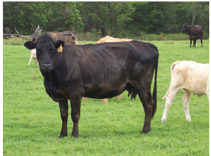
Figure 3. Example of a cow with a body condition score of 3. Little to no fat deposition in the brisket, four ribs visible, tenting appearance on the spine, hooks and pins clearly evident, and no fat deposition in the tailhead.

Figure 3 shows an example of a BCS 3 cow. No fat deposition is evident in the brisket; a defined transition from the shoulder to the rib cage is visible, indicating decreased fat deposition over the shoulder into the ribs. Three to four ribs are evident. The spine creates a tent with the spinous processes forming the peak. The hooks and pins are evident, with sharpness over the hooks due to little fat deposition. Muscle is still evident in the hip, but muscle creases are also visible. Definition of structures around the tailhead is readily apparent because of little to no fat deposition.