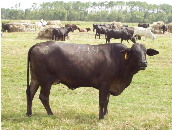
Figure 4. Example of a cow with a body condition score of 6. Fat deposition in the brisket is plainly visible. No ribs can be seen. The back is flat across the length. Hooks are evident, but show fat cover. Pins are not visible because of full muscle and fat cover. The tailhead is covered with fat; some mounding is apparent.