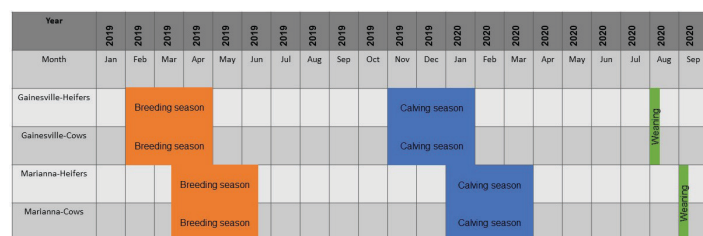
Figure 1. Calendar distribution of the breeding season (orange), calving season (blue), and weaning (green bar) on the UF/IFAS beef herds. In both herds, the breeding season starts when females are artificially inseminated, following a synchronization protocol (Figure 2). Bulls are introduced a few days after AI (Table 1) and removed at the end of the breeding season. The calving season is consistent with the average gestation length in cattle (283 days). Because all females are inseminated on day 1 of the breeding season, AI calves are born first and calves from natural service follow.

Producers always ask what numbers they should aim for. There is no definitive answer, because different performances are expected from different production systems. Producers may find it useful to utilize the numbers from this report as a reference point to gauge the reproductive performance of their operations. To that end, it is always useful to look at real numbers obtained from reliable sources. Here, we present a yearly report of the reproductive performance of the University of Florida beef herds. Each University herd operates according to its respective regional characteristics and specific management (Table 1 and Figure 1). Figure 2 presents the synchronization protocol, reproductive performance, pregnancy maintenance, and calf survival data for both the Gainesville (UF/IFAS Beef Unit) and the Marianna (UF/IFAS North Florida Research and Education Center) herds for the 2019 breeding season/2019–2020 calving season.