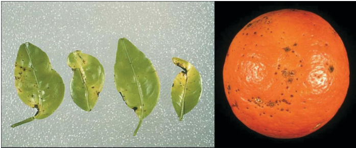
Figure 2. Alternaria fungus disease.

Whiteside, J. O. 1986. "Alternaria-Recognition, Prevention and Control of Alternaria Brown Spot on Dancy Tangerines and Minneola Tangelos." Citrus Industry Magazine . 67:44-47,54.