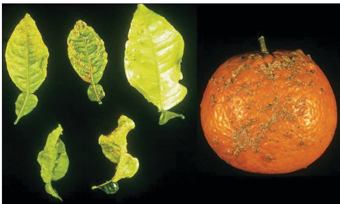
Figure 2. Scab on foliage and fruit.