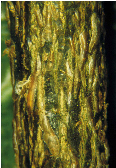
Figure 3. Glover scales on bark.