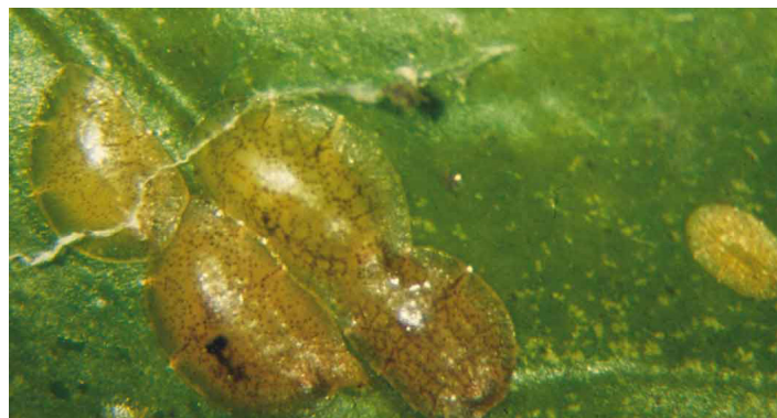
Figure 11. Soft brown scale.

The scale is heavily parasitized by several different species of parasitic wasps.