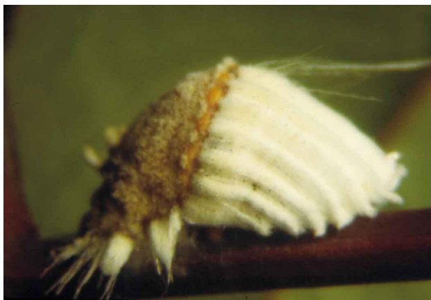
Figure 10. Cottoncushion scale.

Early immature stages of the scale cause the greatest damage on citrus while extracting plant sap during feeding along the leaf midrib and on green twigs. Later stages migrate to the larger twigs, where they feed and secrete honeydew from which sooty mold grows. Heavy infestations may result in defoliation, twig dieback, and fruit drop. Cottoncushion scale can be found on many species of ornamental plants as well as on citrus.