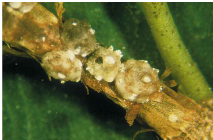
Figure 12. Florida wax scale.

The adult female is covered with a thick layer of soft wax, about 2 to 4 mm in length and 1 to 3.5 mm in width. Males are unknown in this species. Florida wax scale is highly convex, somewhat angular, and oval. The color is white, sometimes with a pinkish cast, becoming dirty white with age (Fig 12). Eggs are pink to dark red and are found under the scale's wax covering. Crawlers are pink, migrate away from under the female's wax covering, settle, and begin to extract sap from leaves or twigs. Young scales have a similar wax covering. Large amounts of honeydew are secreted by this species. Immature stages of Florida wax scales are found on the leaves and twigs with older stages frequently found on twigs and branches. Leaf populations are aligned with the leaf midrib. Florida wax scales are seldom found in large numbers due to presence of effective natural enemies.