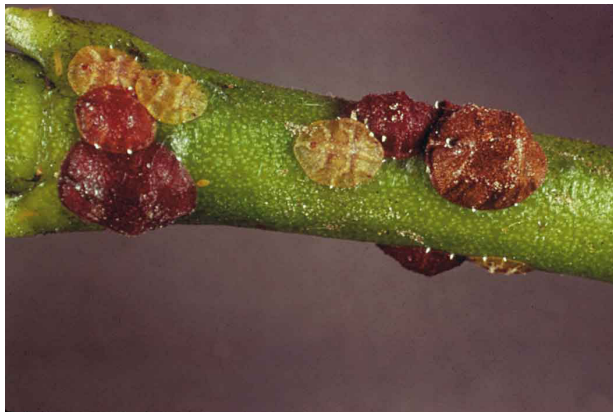
Figure 9. Caribbean black scale (various stages).

two months in cooler weather. Newly hatched nymphs are bright red with dark antennae. Total length of the scale, including the egg sac, is 10 to 15 mm.