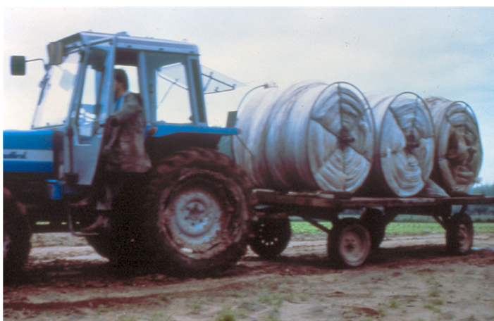
Figure 23. Floating row covers ready to be stored in between uses.