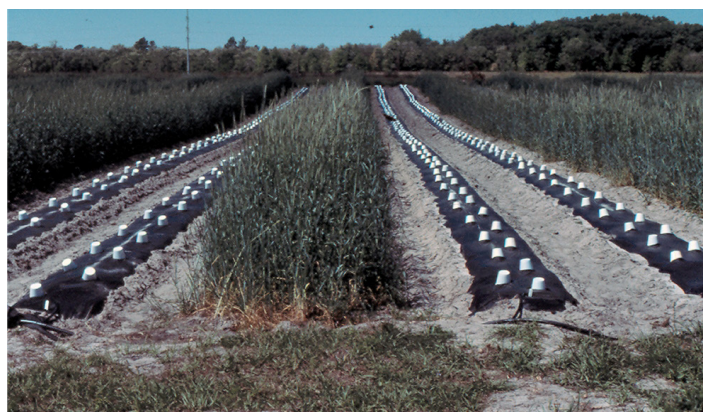
Figure 2. Styrofoam soup cups used for frost protection of melons near Gainesville, Florida.