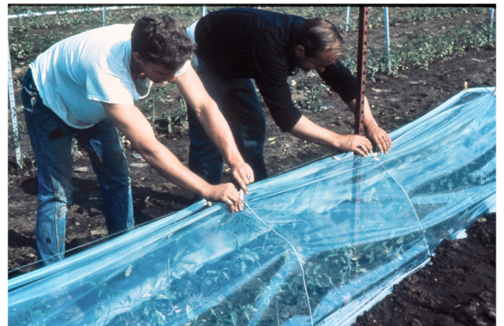
Figure 11. The “California” double-sheet row cover (tunnel).