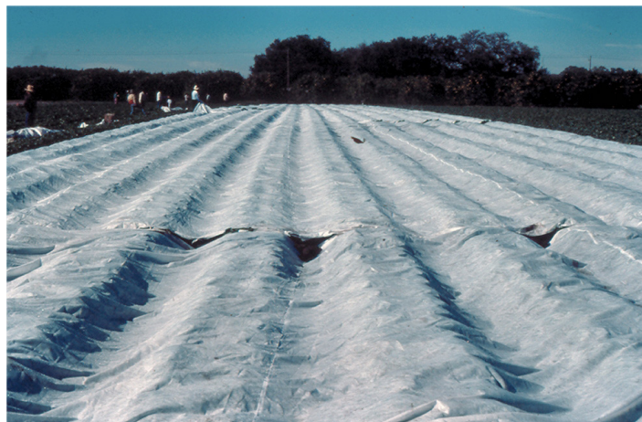
Figure 13. Multi-row floating row cover for frost protection of strawberries.

The “California system” for cucumbers employs two sheets of 36-inch-wide, 1.5-milliliter, perforated, clear polyethylene supported by 9-gauge wire hoops. The wire (70 inches long) is formed in an oval shape so that an approximately 30-inch-wide bed is enclosed by the row cover. These hoops are placed 5–7 feet apart and deep enough in the soil to make a cover that is 15–16 inches tall at the center. Wooden