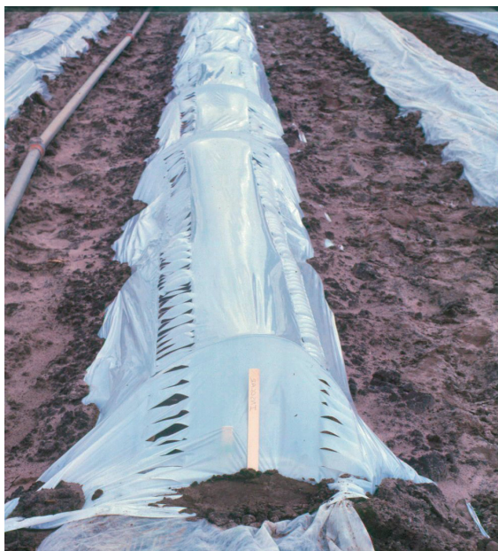
Figure 9. Slitted poly cover on wire hoops, pigmented, close-up.

Clear poly covers allow slightly earlier planting dates resulting in 2–3 weeks earliness and, in some cases, increased total yields, compared to unprotected crops.