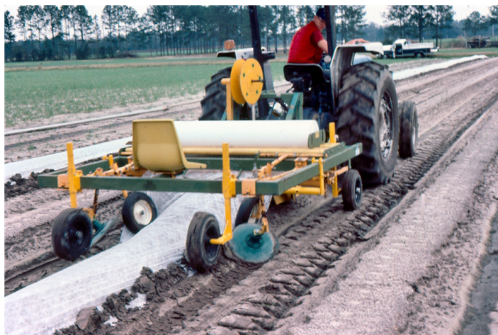
Figure 19. Mechanical applicator for single-row, floating row cover.

and this protection is generally greater with the floating materials and greater in the fall, when additional warmth can be obtained from the soil. Slitted row covers have been reported to give 1°F to 2°F protection. Floating covers can provide up to 3°F protection. Additionally, research in Florida with strawberries showed that frost protection with floating row covers may be greater than 3°F. Heavy-weight floating row covers (1.5 ounces per square yard) protected strawberries exposed to temperatures below 20°F. These types of covers are applied only when temperatures fall below 32°F. Frost protection with polyethylene covers is greatest where moisture condenses on the inner surface of the cover during the night. Frost damage can occur to leaves in contact with floating row covers or poly covers.