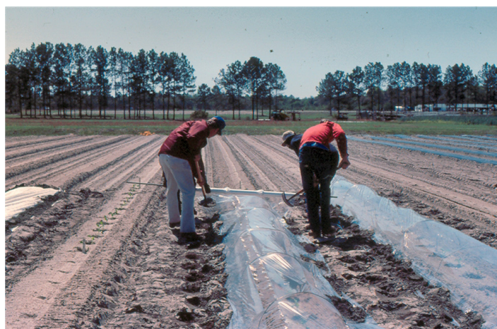
Figure 16. Manual application of single row covers.