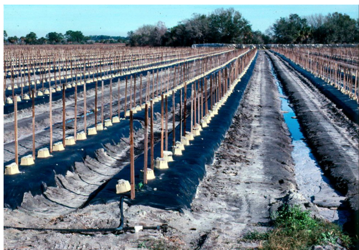
Figure 1. Strawberry boxes used for freeze protection on tomato.

Row covers are flexible, transparent or semitransparent materials used to enclose single or multiple rows of plants