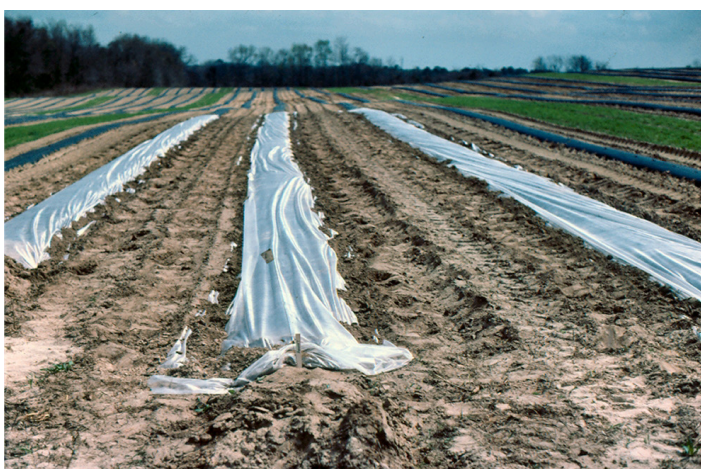
Figure 3. Single-row row covers in North Florida, watermelons.