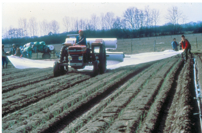
Figure 18. Mechanical-assist application of a wide row cover.

One of the most critical factors in successful use of row covers is timing of application and removal of the covers. Both types of row covers may provide frost protection,