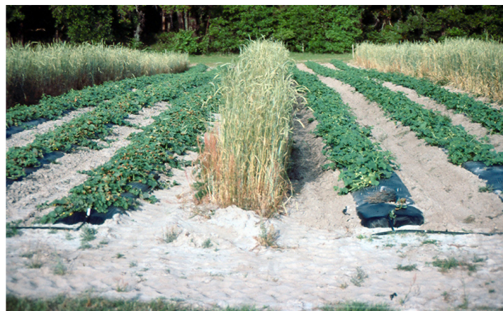
Figure 6. Frost damage of uncovered muskmelon (L), covered plants (R), Gainesville, Florida.