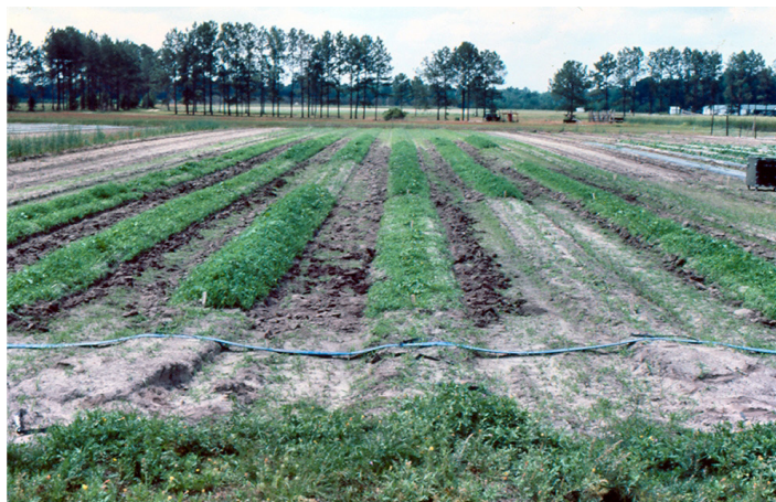
Figure 20. Weed growth also can be enhanced under row covers.

The cucurbit crops (muskmelon, cucumber, squash, and watermelon) have responded best to both types of row covers (Figure 21). Tomatoes and peppers have responded positively, but seem to be more sensitive to high temperature under the covers, making timely ventilation or cover removal critical. Other crops that have responded positively to row covers include lettuce, radishes, and beets. A portion of the positive response of crops such as radishes and squash to row covers (particularly floating covers) has been the protection from insects while the cover was in place.