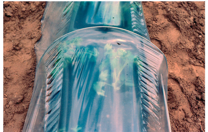
Figure 10. Slitted row cover (tunnel), clear. Close-up of slits.

The floating row covers are manufactured from various fabric-like materials, such as polyester or polypropylene