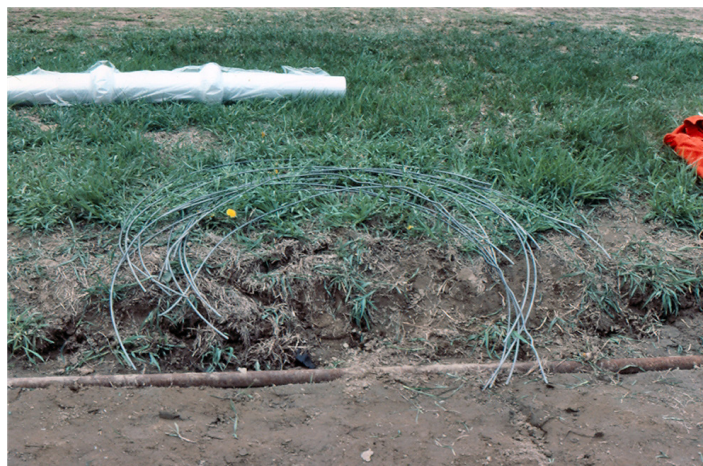
Figure 15. Nine-gauge wire hoops to support polyethylene tunnels, with a roll of slitted cover in background.

system can easily be installed with a mulch-laying machine that has been modified to support the roll of cover above pre-installed hoops (Figure 17). Machines are available that will install hoops mechanically and apply the cover at the same time.