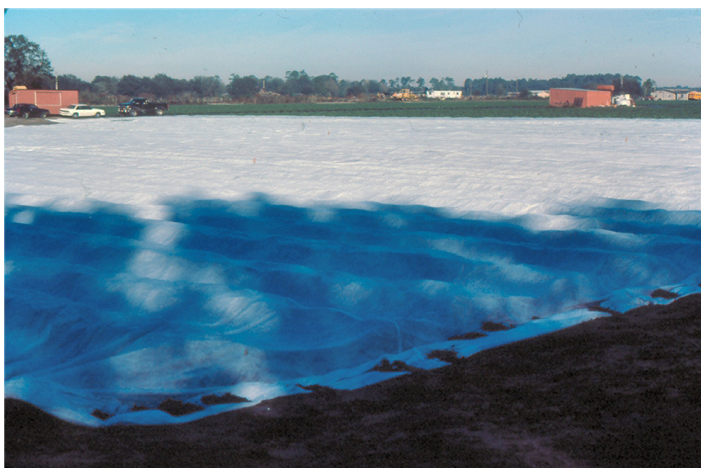
Figure 4. Multi-row floating row cover made of polypropylene used on strawberry in Central Florida.

The first successful, commercial-scale use of polyethylene row covers was in San Diego County, California, in 1958. However, widespread use of row covers did not occur until the 1980s, following research in New England by O.S. Wells and J.B. Loy.