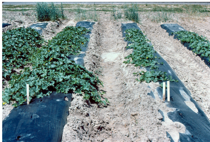
Figure 21. Muskmelon responses to floating row covers, covered (left) and uncovered (right).

Research in several states has shown that row covers alone produce positive yield responses. However, their fullest potential has been realized where they are used as part of an integrated, growth-intensifying program. Research indicates that this system should include black polyethylene ground mulch. Likewise, drip irrigation can be used in the