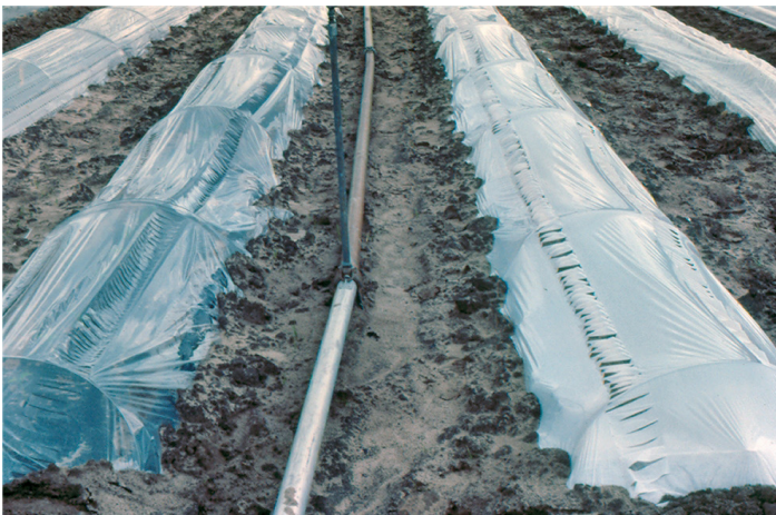
Figure 8. Clear polyethylene row cover tunnels (left) and pigmented tunnels (right). Both are slitted covers.