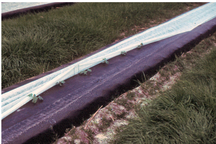
Figure 12. Single-row floating row cover on watermelons in Florida.