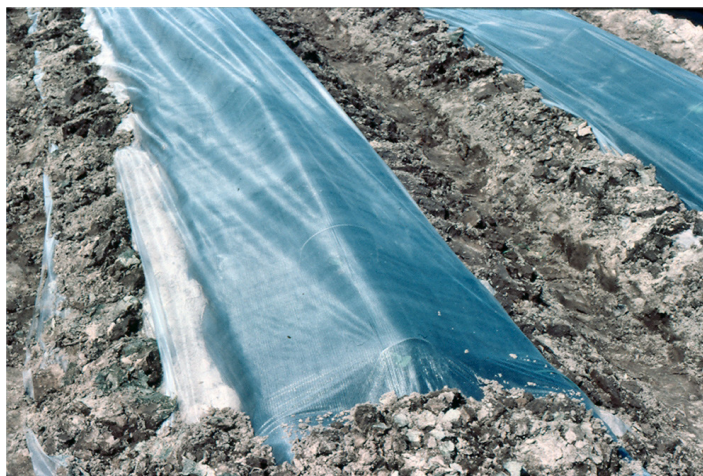
Figure 14. Small wire hoops underneath a floating row cover to prevent wind abrasion.