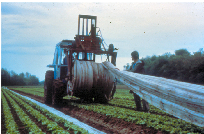
Figure 22. Floating row covers being mechanically retrieved from the field.