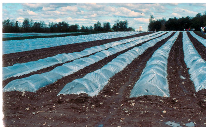
Figure 5. Commercial use of row covers in New England.

Polyethylene (poly) covers are clear or pigmented polyethylene, installed over wire support hoops (Figures 7 & 8).