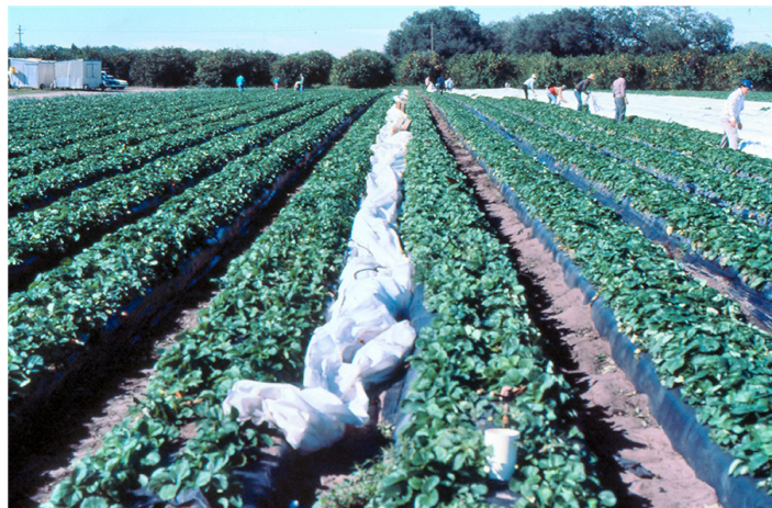
Figure 25. Floating row cover furled in between freeze events.

system to ensure that adequate moisture is present under covers to support the accelerated growth of plants. Drip irrigation also facilitates application of fertilizers to plants while covers are in place. Research shows that drip-irrigation operation during a freeze event does not enhance freeze protection over row-cover use alone and might result in leaching of fertilizers.