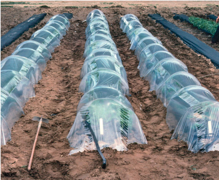
Figure 7. Clear poly row covers on wire hoops.