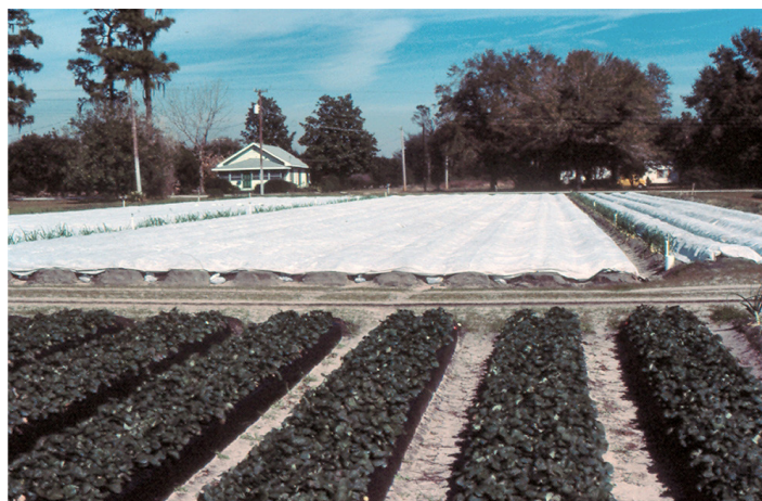
Figure 24. Floating row covers on strawberries in freeze.