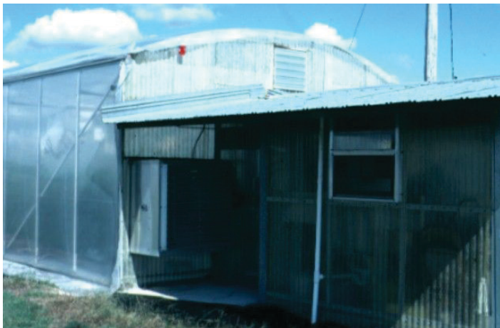
Figure 3. “Airlock” entrance porch to minimize entry of pests into greenhouse.

Greenhouses should be built with an “airlock” entrance design (Figure 3). This entrance porch prevents direct ingress of wind, insects, soil, and spores into the greenhouse. Such an entrance has the additional advantage of making doors easier to open and close when the fans are operating. The double entrance also prevents short-circuit air flow patterns when ventilation fans are in operation.