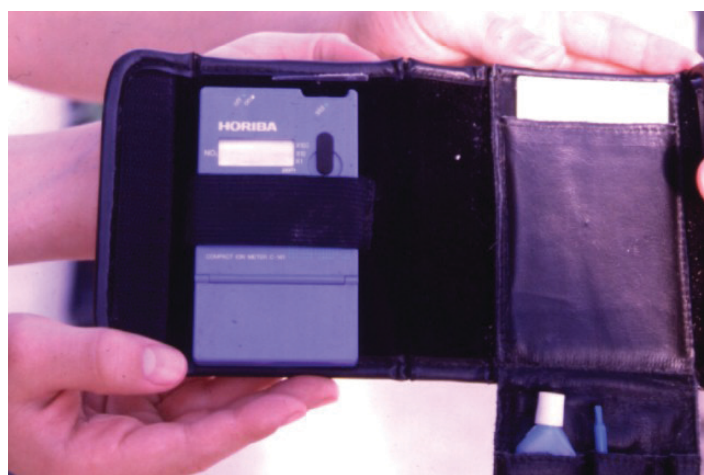
Figure 7. Ion-specific meters for measuring petiole sap nitrate and potassium concentrations.

In addition to whole-leaf tissue samples addressed above, leaf petiole sap can be analyzed for nitrate-N and K concentrations (Figure 7). Sap analyses are quick and easy and very helpful in spot-checking plant nutrient status. Methods for petiole sap analyses are available in Fla. Coop. Ext. Circ. 1144 "Plant Petiole Sap-Testing For Vegetable Crops". The critical ranges for greenhouse tomato petiole nitrate-N and K concentrations are presented in Table 9.