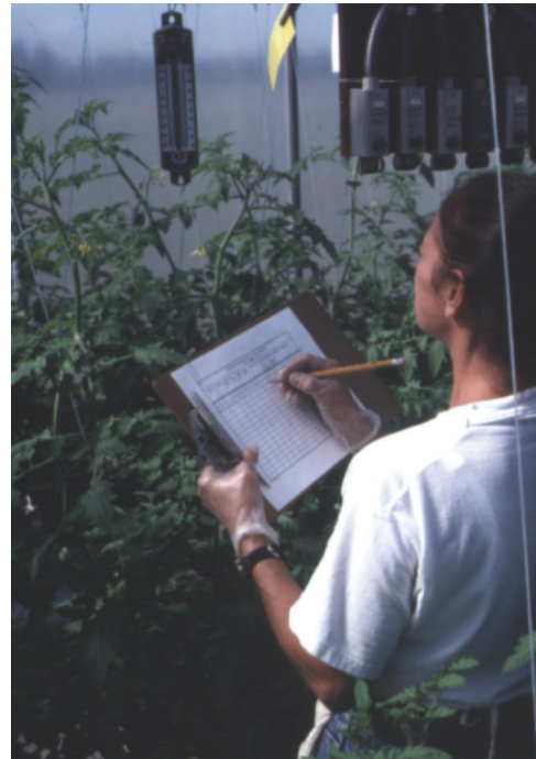
Figure 5. Accurate records on electrical conductivity, pH, and amounts of nutrient solution applied are important for efficient fertilizer management.

Accurate calculations of the amounts of fertilizer materials to dissolve to achieve the desired concentrations of individual nutrients in the final growth nutrient solution are critical to the success of a fertilizer program (Figure 5).