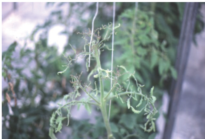
Figure 1. Foliar symptoms of severe calcium deficiency on tomato.

Calcium is immobile in the plant; therefore, deficiency symptoms show up first on new growth (Figure 1). Deficiencies of Ca cause necrosis of the new leaves or lead to curled, contorted growth. Examples of this are tip burn of lettuce and cole crops. Blossom-end-rot of tomato also is a calcium-deficiency related disorder (Figure 2). Cells of the tomato fruit deprived of Ca break down causing the well-recognized dark area on the tomato fruit blossom-end. Sometimes this breakdown can occur just inside the skin so that small darkened hard spots form on the inside of the tomato while the outside appears normal. Sometimes the lesion on the outside of the fruit can be sunken or simply consist of darkening of the tissue around the blossom area.