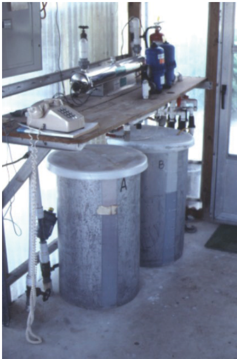
Figure 3. Fertilizer stock tanks for rockwool or perlite systems located under proportioner bench.

In most production systems, at least two stock tanks are needed (Figure 3). This is because certain fertilizer sources when mixed together in concentrated form will lead to insoluble precipitates. The most common of these are calcium phosphate (from mixing calcium nitrate and phosphorus materials) and calcium sulfate (from mixing calcium nitrate and magnesium sulfate). Most production situations can get by with two stocks, one contains potassium nitrate, calcium nitrate, and iron chelate, and the other contains the phosphorus source, magnesium sulfate, micronutrients, and potassium chloride, or might contain some of the potassium nitrate as well (Figure 4).