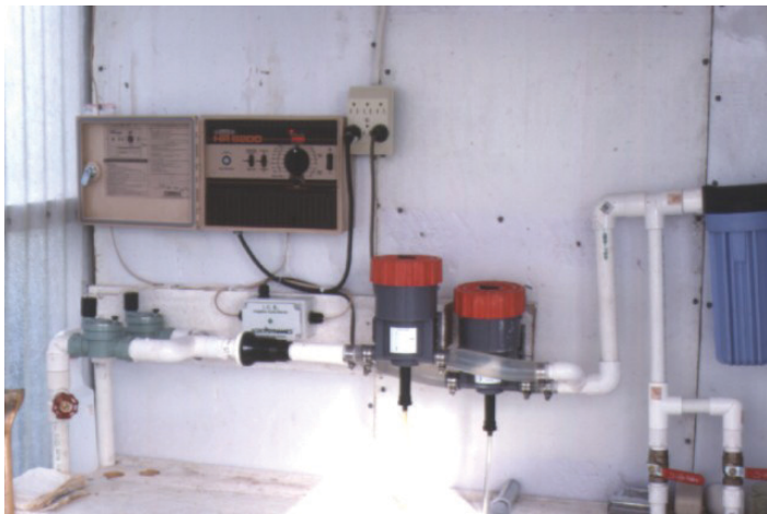
Figure 4. Irrigation controller, solenoid valves, pressure regulator, and proportioners for rockwool or perlite systems.

Once the small batches are added to the stock, the total volume of the stock tank is brought to the desired level and stirred. After the stocks have settled for a while (few hours), the solution will become clear, but a sludge will often form in the bottom of the calcium/potassium nitrate tank. This sludge is from certain additives in some fertilizer materials to prevent caking and dust. These materials are not soluble and will settle to the bottom of the tank. Therefore, the stock tanks will need to be rinsed periodically to remove this sludge. This problem can be alleviated by using technical grade fertilizer salts or clear (decanted) fertilizer solutions, such as liquid calcium nitrate.