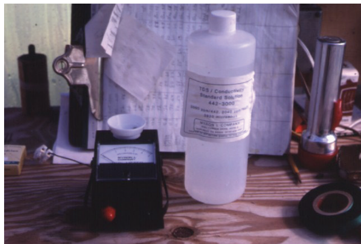
Figure 6. Conductivity meter and standard solution for routine calibration of meter.

measurement is easy and fast (Figure 6). However, this procedure only tells the grower the relative amount of total “salts” in the solution, and it tells the person nothing about each specific nutrient in the solution.