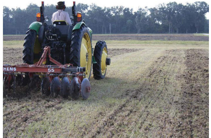
Figure 1. Bahiagrass field lightly disked in preparation for overseeding with clover.

excess forage. If the sod is bahiagrass, it should be cut with a medium- to light-weight disk or chopper before seeding. The purpose of this cultivation is to reduce competition from the bahiagrass and expose soil so that seed can come in direct contact with it when planted. Another approach is to use a no-till drill and seed directly into the existing sod.