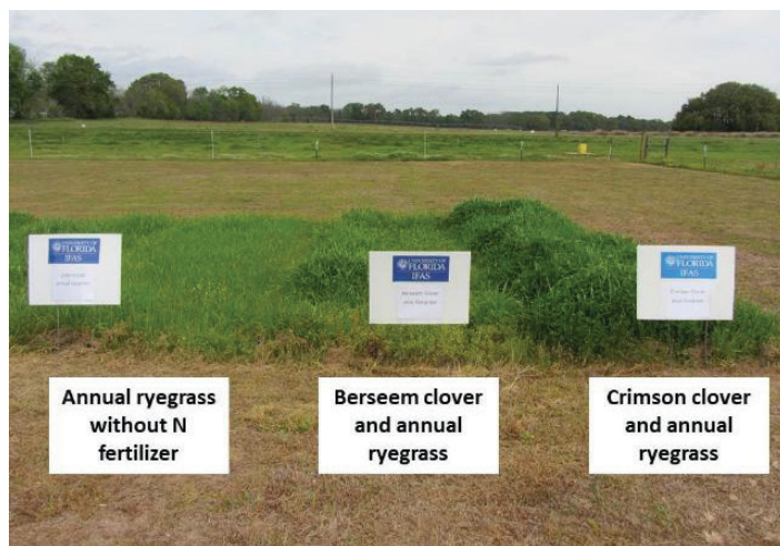
Figure 8. Annual ryegrass and cool-season legume mixtures contrasted with annual ryegrass without N fertilizer in early April in north Florida.

red clover. Ryegrass and white clover can also be grown together.