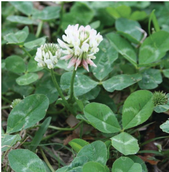
Figure 2. White clover flower and leaf detail.

White clover is the most widely adapted forage legume in the state. It requires a continuous and abundant supply of moisture and will tolerate flooding for short periods. It can be grown in combination with most grasses if management is such that grass is not permitted to seriously compete with the clover. Osceola and Regal are recommended ladino-types, and Ocoee, Durana, Regal Graze, and Louisiana S-1 are recommended intermediate types. All varieties mentioned may live from year to year if moisture and fertility conditions are favorable, but Osceola is the most persistent. Seedling white clover may not be ready for grazing until mid-February or early March, but “live-over stands” may be ready 4 to 6 weeks earlier. Seeding rate for these varieties is 3 to 4 lb/A.