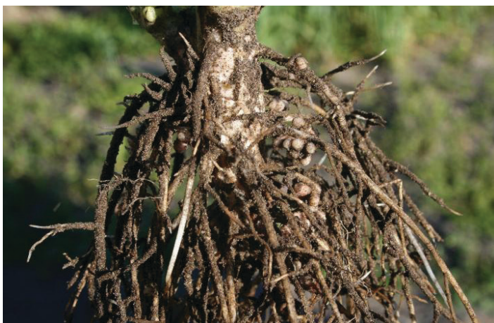
Figure 7. Root of a legume plant with small round structures (nodules) containing the N-fixing bacteria.

Plant legumes on a well-prepared seedbed from October 1 through mid-November when cooler temperatures prevail (see Site/Soil Selection and Seedbed Preparation). The soils should be thoroughly moist at the time of seeding. Seed should be planted with a cultipacker-type seeder, drill, or other appropriate seeding device, and given very shallow coverage. Packing is important; it gives a smooth, firm seedbed, presses seed into the soil, and usually gives all the coverage necessary.