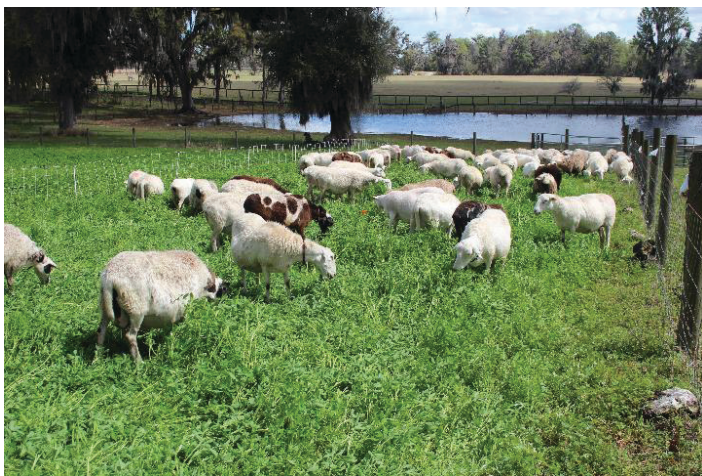
Figure 5. Berseem clover pasture strip-grazed by sheep in central Florida.