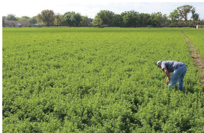
Figure 6. Commercial alfalfa field showing spring growth (March) in central Florida.

of the weather problems that are associated with making hay and has been produced successfully in central and north Florida. Seed of the old cultivar Florida 77 and Florida 99 are no longer marketed. On a commercial scale non-dormant Bulldog 805 has performed well overseeded into bermudagrass pastures for several years, and Alfagraze Round Up Ready (RR 600) has shown good yields and adaptation during the first year of establishment in central Florida. In variety trials new, non-dormant cultivars Ameristand 901 and Bulldog 805 have shown good yields in variety experiments. Further testing for adaptation is currently on-going. Alfalfa usually acts like an annual, especially when planted on flatwoods sites in southern Florida, which become waterlogged during periods of heavy rainfall. Improved cultivars, when available, may live for 2–3 years when planted on highly productive sites in central and north Florida. Seeding rate is 12 to 20 lb/A.