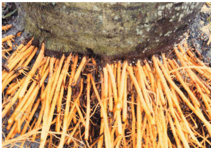
Figure 4. Large numbers of new roots arising from a palm's root-initiation zone.

The question of how a palm responds to having its roots cut is central to palm transplanting success. To answer that question, Broschat and Donselman (1984; 1990b) demonstrated in a series of experiments that different palm species respond differently (Table 1). For example, when roots of Sabal palmetto were cut, virtually all cut roots died back to the trunk and were eventually replaced by massive numbers of new roots originating from the root-initiation zone (Figure 4). As a result of this response, it didn't matter whether roots of a Sabal palmetto were cut close to the trunk or 3 feet away from the trunk.