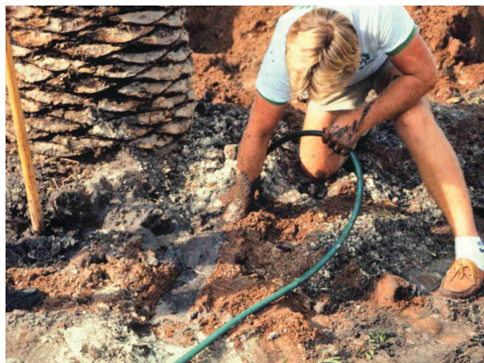
Figure 10. Using water to force sand under and around the rootball.

Gliocladium blight (pink rot) (Broschat 1994; Hodel et al. 2003; 2006).