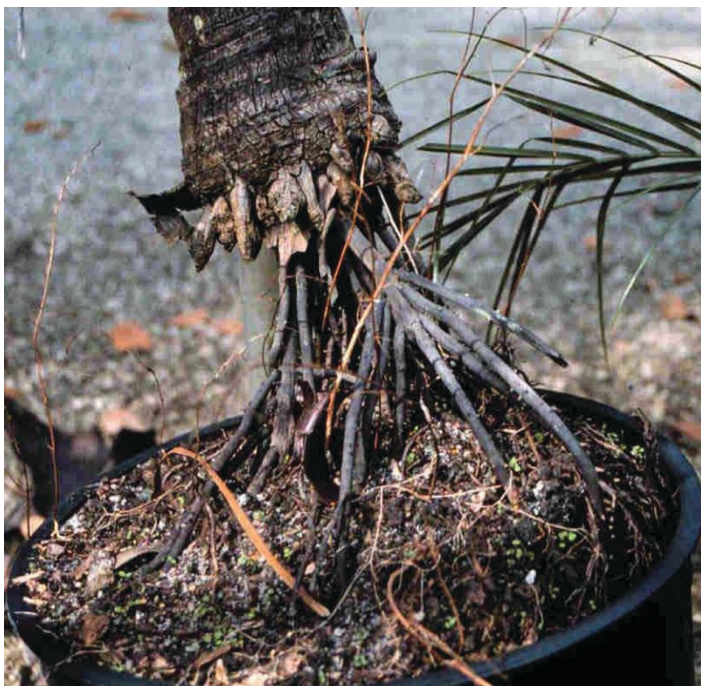
Figure 2. Container substrate subsidence and shallow planting resulted in the root-initiation zone of this palm being above the current soil line. These new root initials will probably never enter the soil.

surface (Figure 2). Planting such palms at the same level as the top of the rootball will result in a poorly-anchored palm that is susceptible to toppling over (Figure 3). Container-grown palms should always be planted so that the top of the root-shoot interface is about one inch below the surface of the soil.