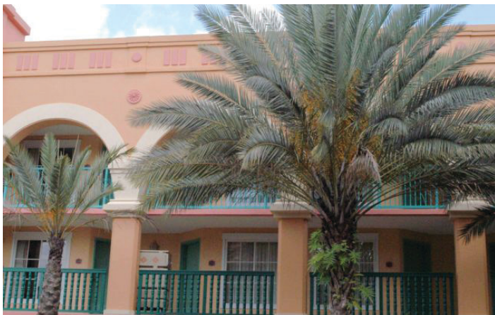
Figure 9. The palm on the left was planted too deeply. At the time of planting, these two palms were similar in size.

properly planted palms (Figure 9). In addition to nutrient deficiencies, deeply planted palms may also suffer from water stress. As a result of these palms' weakened condition, they may attract secondary pests, such as palm weevils ( Rhychophorus sp.). Palms that are planted too deeply may also develop secondary root rots due to the suffocation of deeply buried roots. Deeply planted palms may linger in a state of poor health for many years, or they may die at any time.