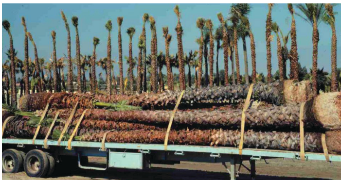
Figure 7. These palms are well supported on the trailer bed for transportation.

During transport on truck or trailer, palms should be well supported along their entire length (Figure 7). Unsupported crowns may crack or damage the bud, resulting in reduced survival rates.