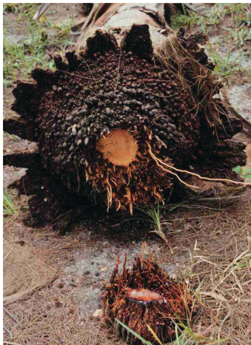
Figure 3. This palm had been planted too shallowly from a container and eventually fell over from its own weight.