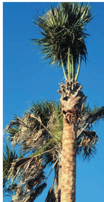
Figure 5. The lower leaves of this palm have been removed, and the remaining ones tied into a bundle for transport.

Since water stress appears to be the primary physiological problem associated with transplanted palms, any practice that reduces water stress in transplanted palms should improve palm survival rates. Typically, one-half to two-thirds of the oldest leaves are removed at the time of digging to facilitate handling and to reduce leaf surface area, from which water loss occurs (Figure 5).