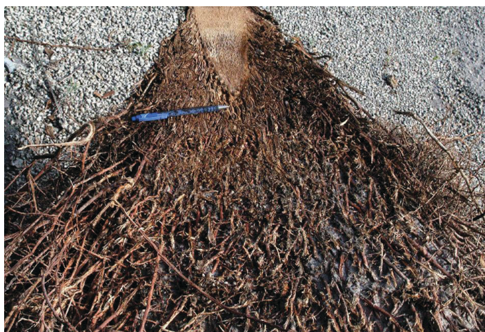
Figure 1. The inverted-cone-shaped tissue at the bottom of the trunk - an area from which all primary palm roots arise - is called the root-initiation zone. The pen marks the soil line.

Palms, when compared to similar-sized broadleaf trees, are relatively easy to transplant into the landscape. Many of the problems encountered when transplanting broadleaf trees, such as wrapping roots, are never a problem in palms due to their different root morphology and architecture. While broadleaf trees typically have only a few large primary roots originating from the base of the trunk, palm root systems are entirely adventitious. In palms, large numbers of roots of a relatively small diameter are continually being initiated from a region at the base of the trunk, a region called the root-initiation zone (Figure 1). And while the roots of broadleaf trees continually increase in diameter, palm roots remain the same diameter as when they first emerged from the root-initiation zone.