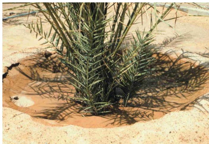
Figure 11. Mounding up soil around the rootball forces water into the rootball, where it is needed.