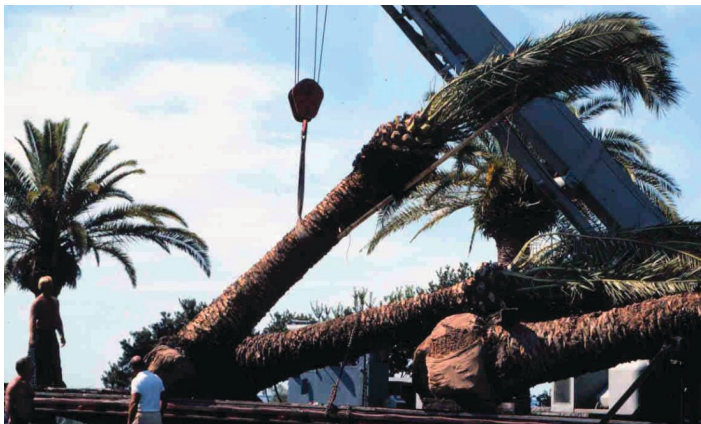
Figure 6. A palm being lifted in a nylon sling. The splint attached to the crown provides support.

Palms should be lifted only by means of nylon slings wrapped around the trunk (Figure 6). Never attach chain, cables, or ropes directly to palm trunks; such practices can result in injury and possibly fatal diseases, such as Thielaviopsis trunk. (For more on that topic, see EDIS Publication PP219, Thielaviopsis Trunk Rot of Palm , http://edis.ifas.ufl.edu/pp143 .)