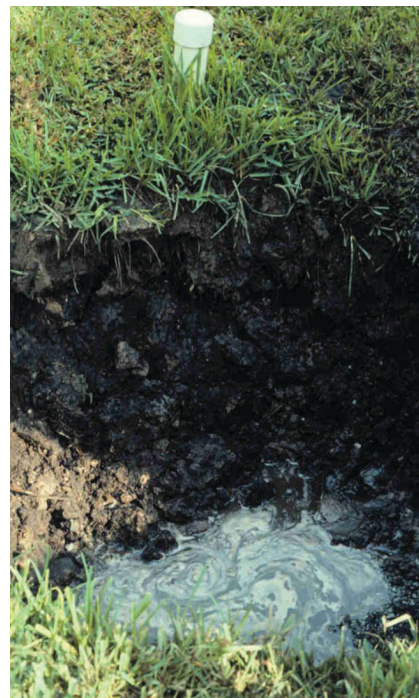
Figure 8. This planting site has a high water table, which is unsuitable for palm installation.

Palms should not be planted into sites with high water tables or poor drainage (Figure 8). Such sites can be planted if mounds or berms are used to build up the area to be planted. Clay hardpans, where they occur, should be drilled through to improve drainage. Planting holes should be roughly twice the diameter of the rootball to facilitate backfilling, but need not be any deeper than the rootball.