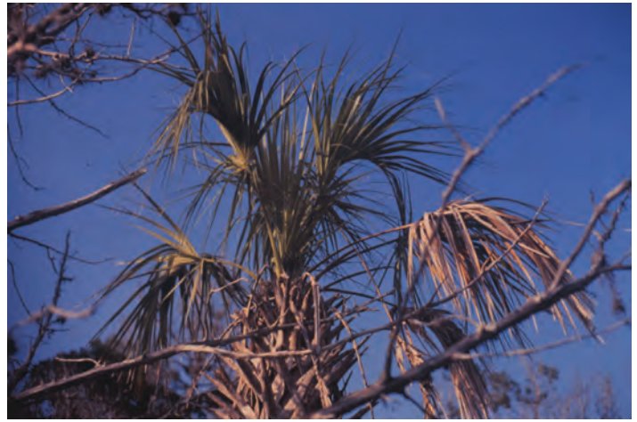
Figure 18. Salt injury on Sabal palmetto growing in an area subject to salt water inundation.