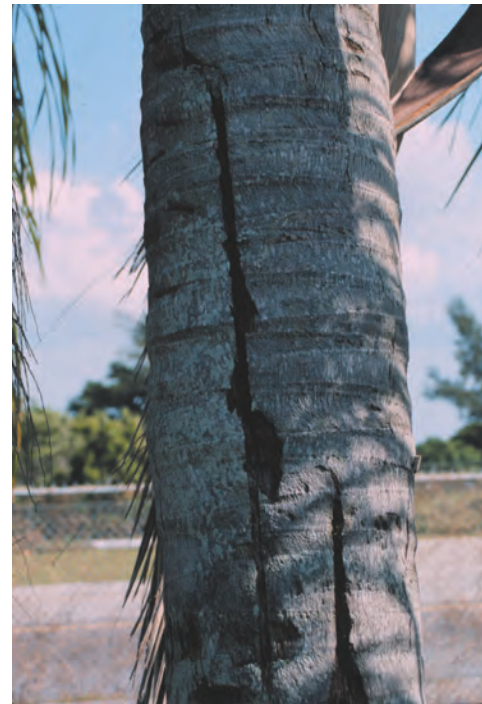
Figure 8. Vertical trunk splitting in Syagrus romanzoffiana caused by excessive water uptake.

Palms that take up excessive amounts of water may have trunks with deep longitudinal splits. These trunks will often appear waterlogged and may be covered with mosses, lichens, algae, and other epiphytes (Figure 8).