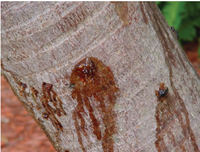
Figure 25. Bleeding "shot holes" in a palm trunk caused by lightning.