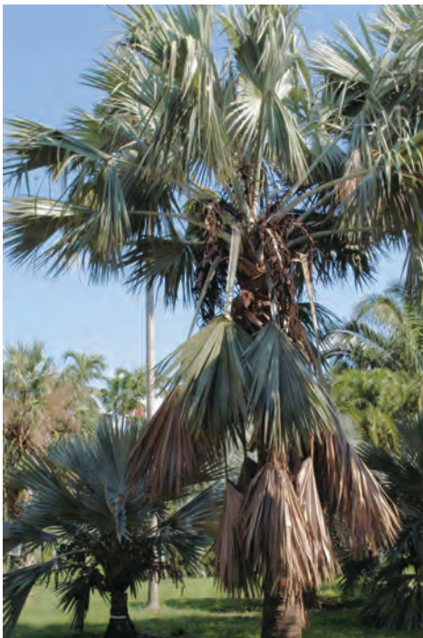
Figure 34. Broken petioles on Bismarckia nobilis caused by high winds.