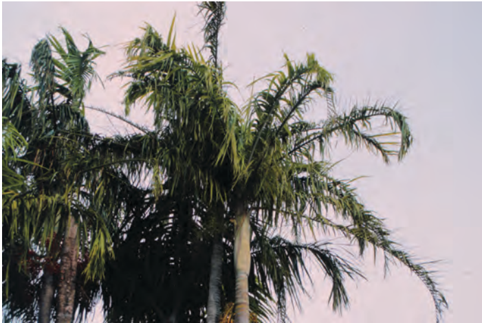
Figure 33. Wind damage on Carpentaria acuminata showing tattered leaflets.

of individual leaves anywhere within the canopy may snap and hang down (Figure 34). These may or may not remain green. In severe wind storms, palms may be uprooted, or the trunk will snap off at varying distances above the ground.