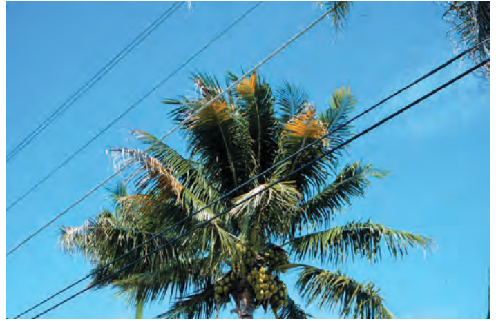
Figure 26. Powerline decline of Cocos nucifera . Note chlorotic leaf tips.

Leaves near high voltage overhead power lines often exhibit chlorotic or necrotic tips (Figures 26, 27, and 28). In severe cases, the entire crown may become chlorotic with necrotic leaf tips. Palm death is relatively rare, however.