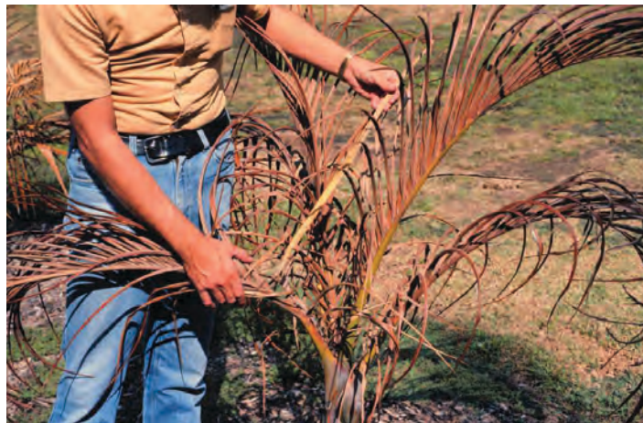
Figure 5. Secondary bud rot on Hyophorbe verschafeltii following severe freeze.