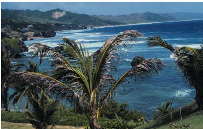
Figure 9. Foliar salt injury on Cocos nucifera caused by airborne salt spray.

Foliar salt injury appears as desiccation of the foliage. Symptoms may be more severe on the exposed windward side of palms growing near the ocean (Figure 9). Some palms may be killed by salt spray.