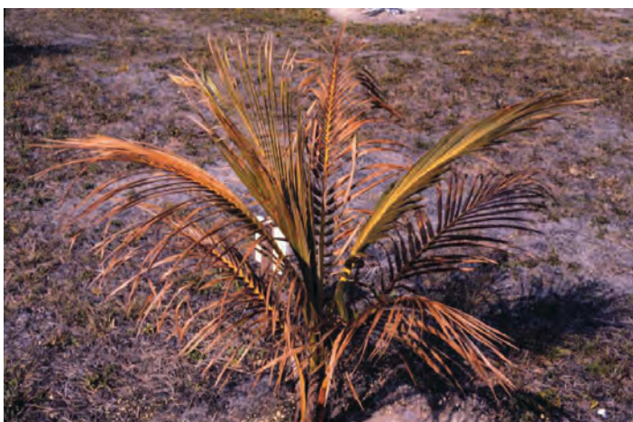
Figure 3. Freeze damage on Cocos nucifera .