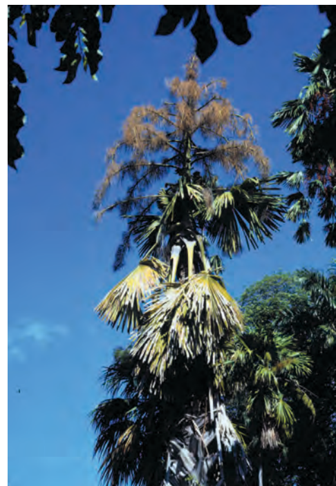
Figure 10. Hapaxanthic flowering in Corypha elata (talipot palm).

Stems of flowering and fruiting palms gradually decline and die (Figures 10 and 11). Flowering may be terminal, or along the trunk, the latter beginning either at the top or at the bottom, depending on the species.