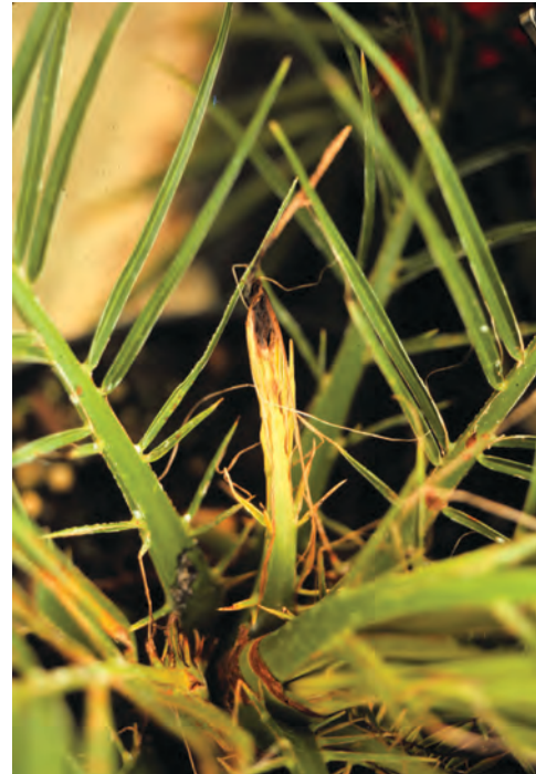
Figure 12. Glyphosate injury on Phoenix roebelenii (pygmy date palm).

not become visible for 6–8 months following application. Most of these products cause stunting, distortion, and occasionally necrosis of the newly emerging leaves (Figures 12–15). Although any of these chemicals can potentially kill palms of any age or size (Figure 16), they typically affect only one or two new leaves, with subsequent leaves emerging perfectly normal in appearance. Thus, these herbicides usually cause only temporary damage in palms.