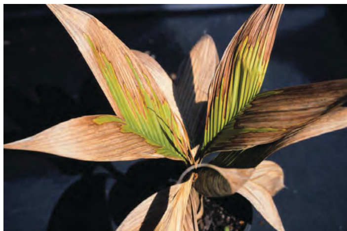
Figure 6. Chilling injury on Geonoma sp. caused by temperatures below 10°C.