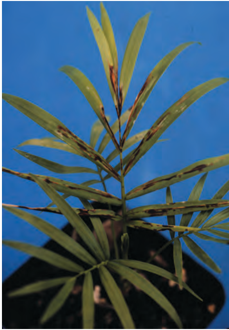
Figure 14. Preemergent herbicide (pendimethalin plus oxyfluorfen) injury on Chamaedorea elegans . Credits: T. K. Broschat