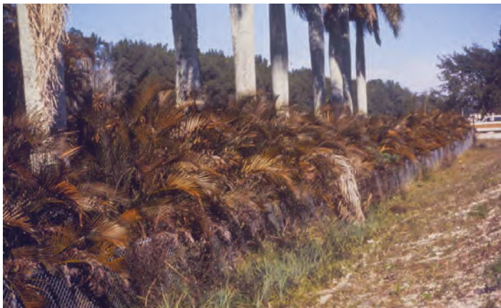
Figure 2. Freeze damage on Dypsis lutescens .

Primary symptoms include extensive and fairly uniform necrosis of the leaflets (Figures 2 and 3). In more severe cases, petiole, rachis, and even trunk tissue can become necrotic. Symptoms may include those of water stress such as wilting. Unhardy palms may be killed. Secondary symptoms include bud rot (Figure 5), trunk rots (Figure 4), and transient micronutrient deficiencies (Figure 7). For additional information about cold injury on palms see EDIS MG318, Cold Damage on Palms .