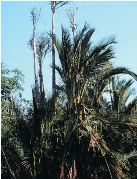
Figure 11. Hapaxanthic flowering in Metroxylon sagu .