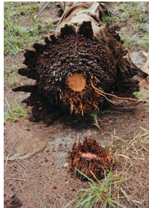
Figure 21. Cocos nucifera transplanted too shallowly.