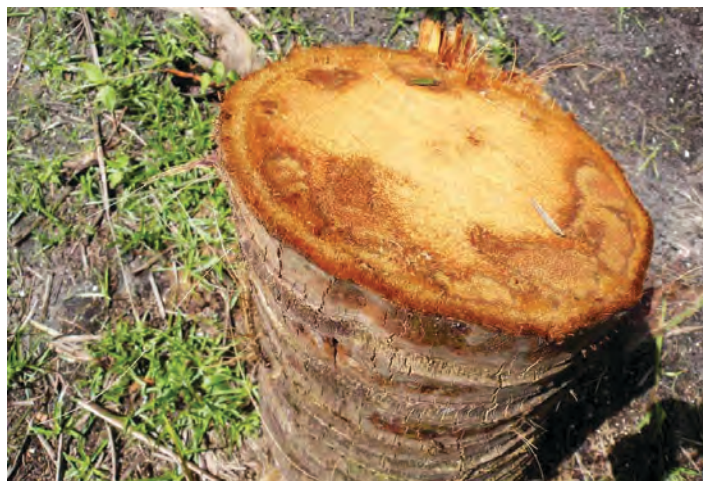
Figure 4. Trunk damage on Cocos nucifera caused by prolonged chilling temperatures.

Palms stressed by cold temperatures are very susceptible to secondary bud rot (Figure 5) and may later show signs of micronutrient deficiencies, such as Mn, due to lower root activity at cooler temperatures (Figure 6).