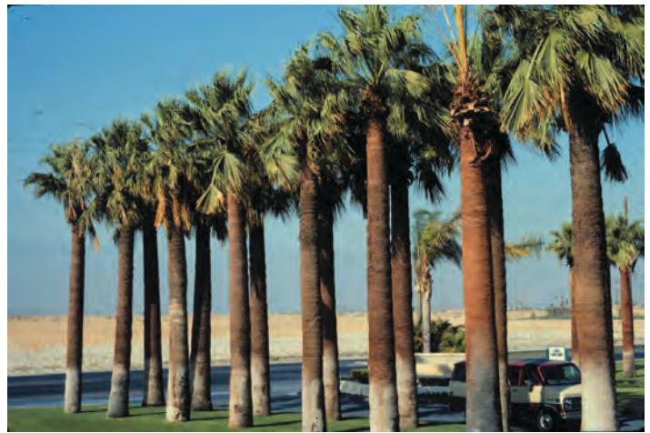
Figure 20. Washingtonia filifera planted at varying depths to achieve a uniform height. Note that at least one palm is dying from deep planting.

Palms planted too shallowly typically have their trunks elevated above the soil line and are often supported by only a few roots, while hundreds of new adventitious root initials remain in a state of arrested development at the base of the trunk due to desiccation. Shallowly planted palms are structurally unsound and can easily topple over in moderate to high winds (Figure 21).