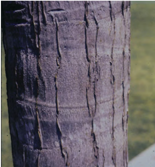
Figure 19. Shrivelled trunk of Syagrus romanzoffiana caused by deep planting.

Palms planted too deeply usually exhibit symptoms of root suffocation such as chlorosis from Fe or Mn deficiency , wilting, shriveling of the trunk, reduced canopy size, root rots, and ultimately death (Figures 19 and 20). Palms stressed from deep planting are also more attractive to boring insects such as Dinapate wrighti in California or Rhynchophorus spp. or Metamasius spp. in more humid tropical areas.