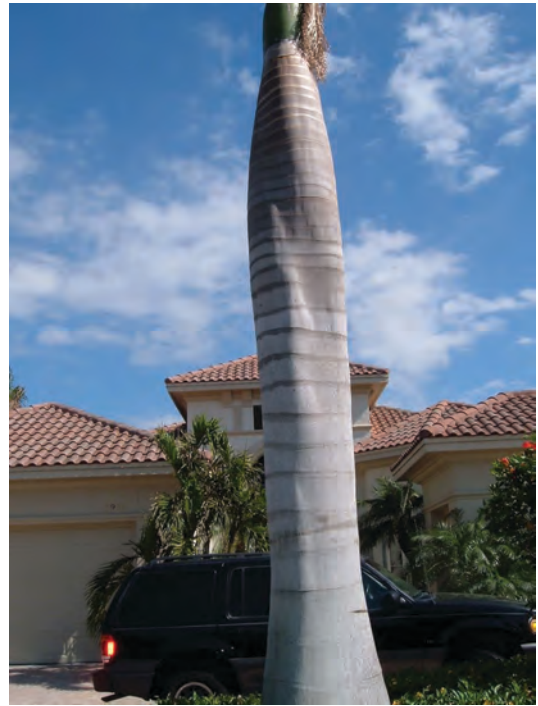
Figure 32. Water stress caused the trunk of this Roystonea regia to collapse.

Water stress occurs when water is limited or the root system is incapable of taking up sufficient water.