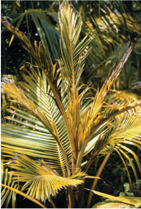
Figure 7. Micronutrient deficiency symptoms (probably B and/or Mn deficiencies) induced by cold temperatures in Cocos nucifera .

Damage caused by hard freezes will affect all parts of a palm and all susceptible palms within an area, whereas damage caused by a frost will likely be spotty in distribution and may affect only exposed parts of individual palms.