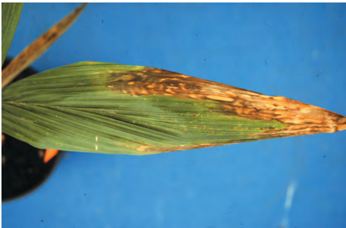
Figure 17. Older leaf of Syagrus romanzoffiana seedling suffering from high soil soluble salts.

Palms suffering from high soil soluble salts usually have necrotic leaflet tips on older leaves (Figure 17). New foliage may express typical Fe deficiency symptoms or wilting due to reduced root surface area for nutrient and water absorption (Figure 18). Roots will often have necrotic tips or more extensive necrosis due to secondary root rots.