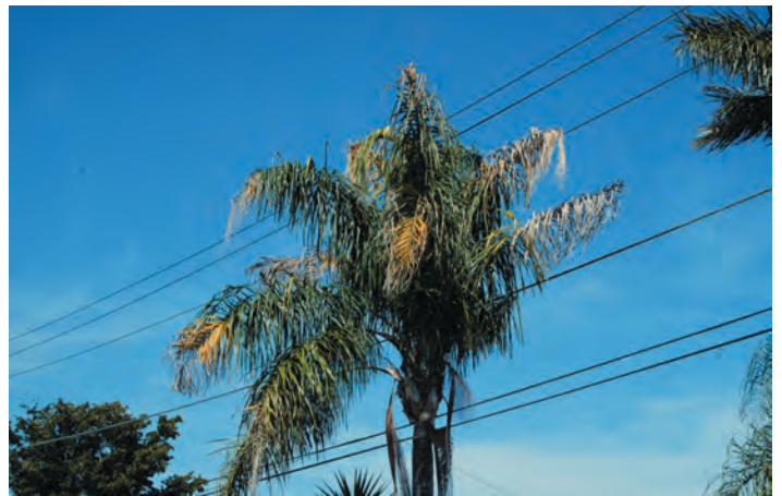
Figure 28. Powerline decline in Syagrus romanzoffiana .