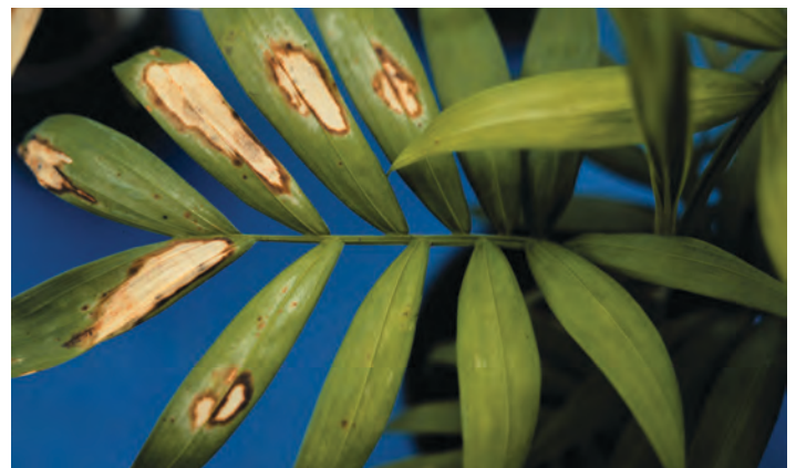
Figure 30. Sunburn injury on Chamaedorea elegans .

Large necrotic areas are visible on the upper surfaces of leaves, usually in the center of leaves or leaflets, rather than on the leaf tips or margins (Figure 30). Affected foliage on adjacent leaves will often have the same directional orientation. Leaves held in a horizontal position are more likely to exhibit sunburn damage than those with a more vertical orientation.