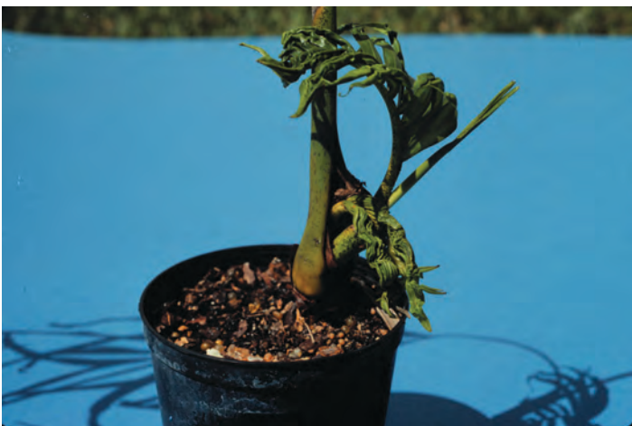
Figure 16. Preemergent herbicide (metolachlor) injury on Dypsis lutescens . Note the production of side shoots.