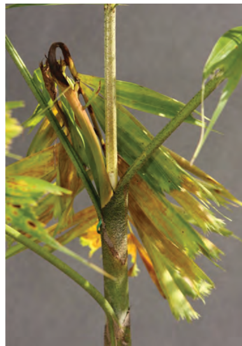
Figure 13. Metsulfuron damage on Wodyetia bifurcata . Credits: T. K. Broschat Credits: T. K. Broschat