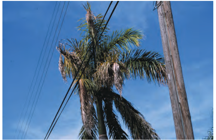
Figure 27. Powerline decline in Roystonea regia .