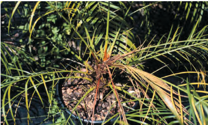
Figure 15. Preemergent herbicide (trifluralin plus isoxaben) injury on Phoenix roebelenii .