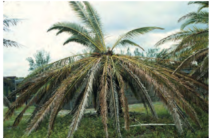
Figure 23. Lightning damage on Phoenix canariensis .