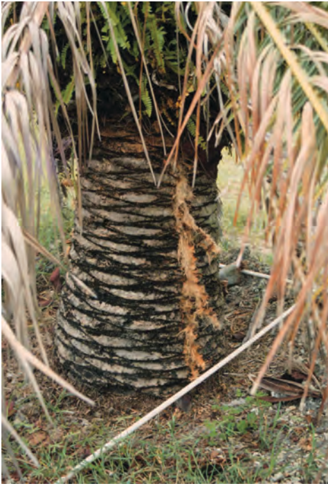
Figure 24. Trunk of Phoenix canariensis struck by lightning.