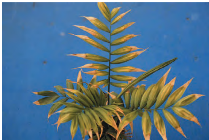
Figure 1. Boron toxicity of Chamaedorea elegans .

Older leaflets of affected palms have light tan necrotic tips, the necrosis gradually spreading up the leaflets (Figure 1).