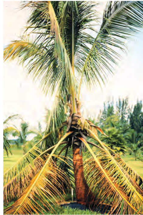
Figure 22. Rapid collapse of Cocos nucifera caused by lightning.

growing close together. Lightning strikes are usually fatal to palms, although some may survive for 6 months or longer following a strike.