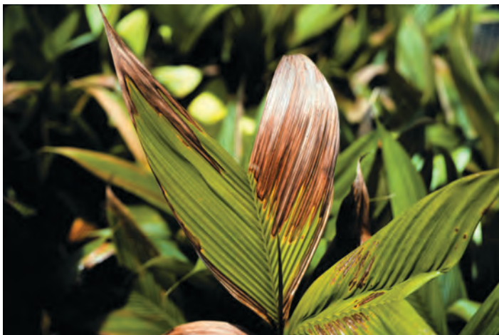
Figure 31. Water stress on Geonoma sp.

Typical water stress symptoms include reduced growth and necrosis of leaflet tips, spreading to the entire leaf as severity increases (Figure 31). Oldest leaves are usually the first to show symptoms, but eventually newly emerging leaves may also wither and die. Death of the meristem or bud may follow. Water stress in some species is indicated by leaflets folding about the midrib or wilting. In mature palms, shriveling (Figure 19), hollowing, or collapse of the trunk (Figure 32) may also occur.