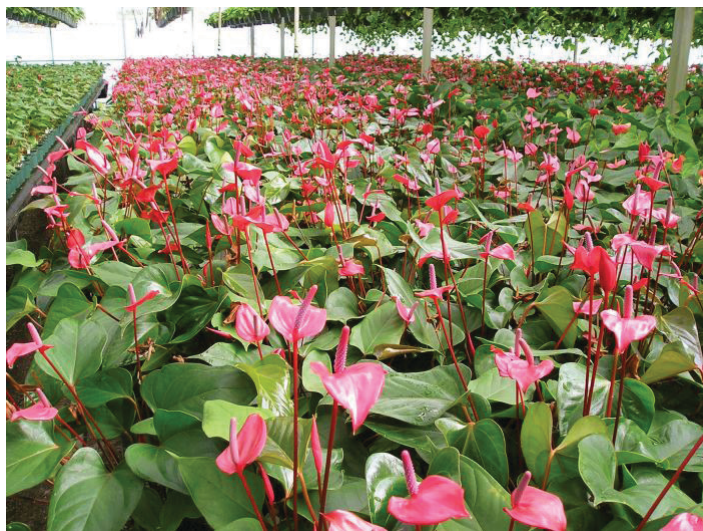
Figure 3. A greenhouse crop of container-grown Anthurium 'Red Hot' in a commercial nursery in Apopka, Florida.