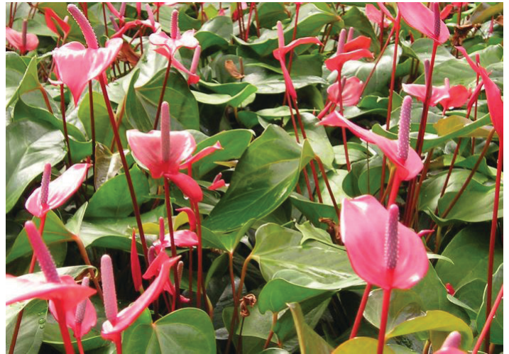
Figure 1. Mature Anthurium 'Red Hot' growing in 6-inch (1.6 L) containers.

Anthurium X 'Red Hot' (Figure 1) is an interspecific hybrid developed by the Foliage Plant Breeding and Genetics Research Program at UF/IFAS Mid-Florida Research and Educational Center—Apopka as a flowering potted foliage plant. Anthurium ( Anthurium andreanum Linden ex Andre (family: Araceae) has been traditionally developed and grown for cut flower production because of its showy red, orange, pink, or white spathes (Kamemoto and Kuehnle 1996). The large overall size, long petioles and peduncles on the cut flower selections generally preclude their use as container plants. Recently, new Anthurium varieties are being developed to emphasize a smaller overall plant size, a propensity to produce basal shoots and a highly prolific flowering habit. Such hybrids are readily adaptable for flowering pot plant production. Anthurium X 'Red Hot' is one such hybrid with numerous attractive, bright red spathes and a compact, well-branched growth habit.