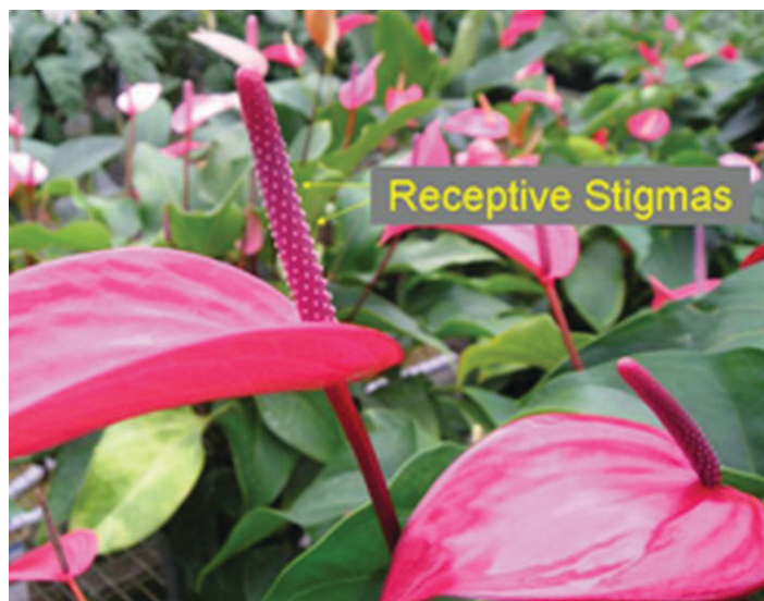
Figure 2. An Anthurium spadix with receptive stigmas that are ready to be pollinated.

Anthurium and Spathiphyllum produce bisexual flowers (Figures 2 and 3). Their inflorescences consist of a spadix enclosed by a spathe. The spadix is a fleshy spike covered with many small, complete flowers. (The term “complete” indicates that male and female structures are contained within each single floret.)