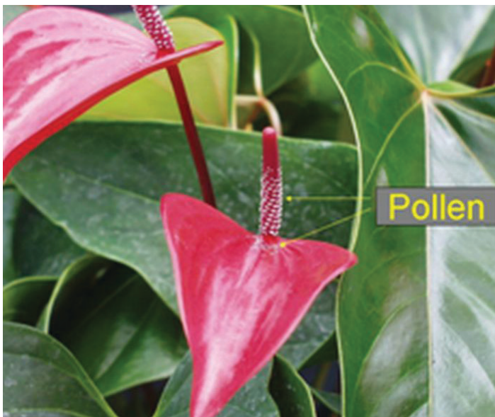
Figure 4. Anthurium flowers that are producing pollen. They can no longer be used as a female parent.

The stigmatic surfaces of both Anthurium and Spathiphyllum become dry and brown before pollen is dehiscid, so floral emasculation is not required. Anthurium pollen begins to appear along the spadix, usually at the bottom first and then proceeds towards the tip (Figure 4). Anthurium pollen is produced for up to two weeks because of the differences in the maturation of individual pistillate flowers. Anthurium pollen is not dispersed by wind. To transfer the pollen to the receptive female flowers, collect it on your fingertips then gently rub it onto receptive stigmas (Figure 2).