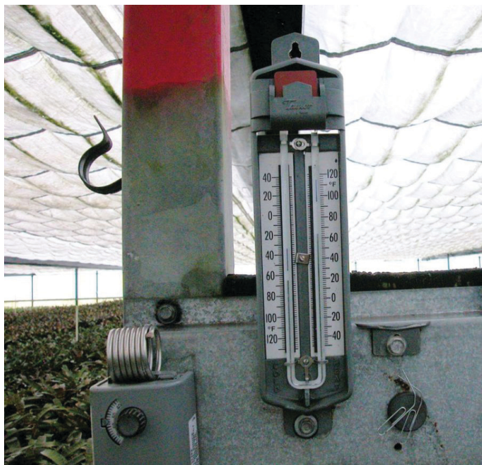
Figure 1. Retractable heat (thermal) curtain deployed under the roof in a shadehouse.

prevented if growers align planting dates, cold protection measures, cultivation practices, and shipping dates based on weather forecasts and plant requirements.