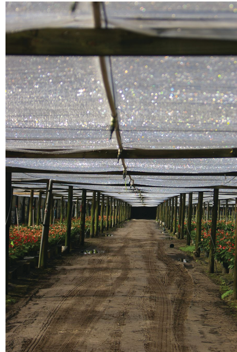
Figure 2. Over-the-roadways mist cold protection system.

systems. It has been determined that a low-pressure fog system uses 86% less water compared to the over-the-roadway mist system mentioned above (Figure 4) (Stamps et al. 2010).