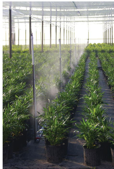
Figure 3. Among-the-plants low-pressure fog cold protection system.