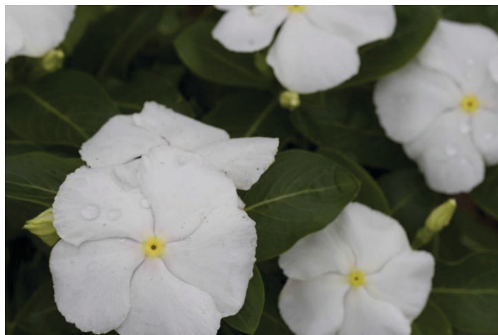
Figure 8. Vinca