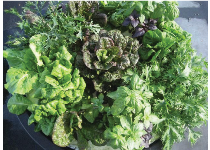
Figure 9. Hydroponic lettuce and herbs