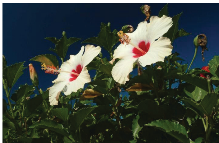
Figure 6. Hibiscus