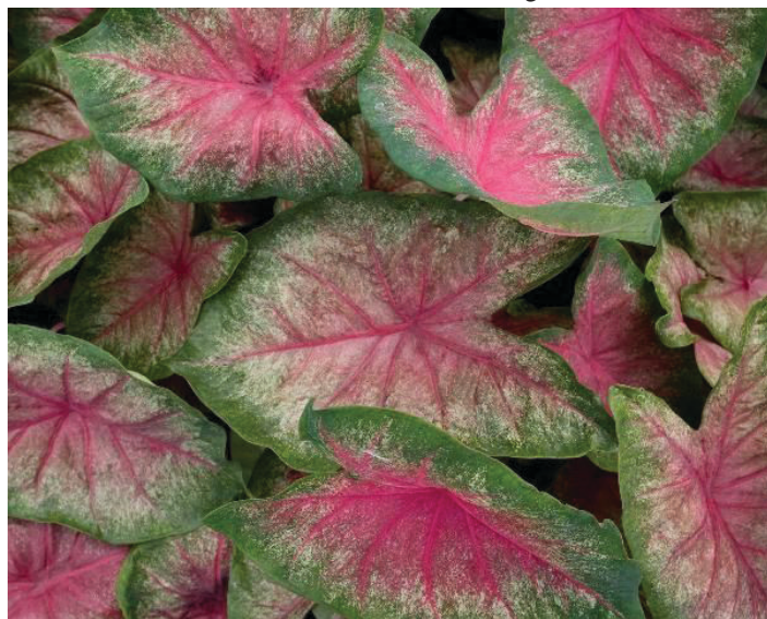
Figure 3. Caladium

Herbs: In addition to their culinary value, many herbs are ornamental and attract butterflies to the garden. See