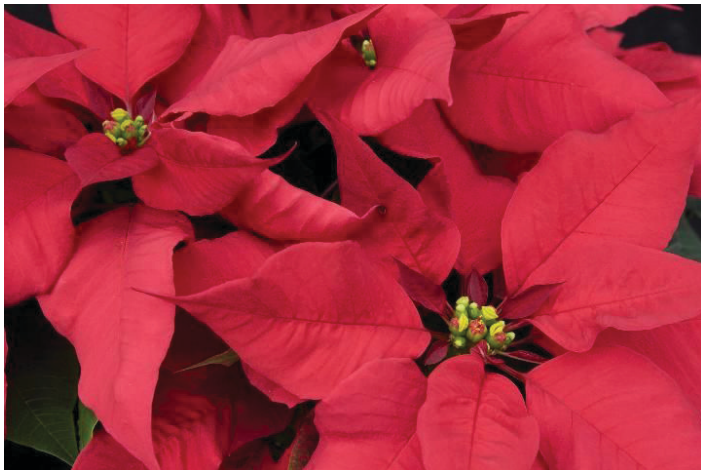
Figure 12. Poinsettia

Cold protection: Prepare now to protect tender plants should cold weather threaten. See