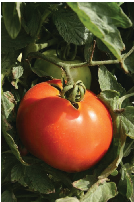
Figure 5. Tomato