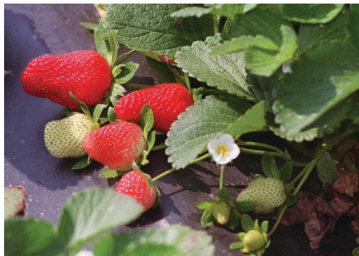
Figure 10. Strawberries

Winter landscapes: Plant evergreen hollies; their bright berries add color to the landscape when other plants have died back for the winter. Water well when planting and mulch to minimize weeds. See