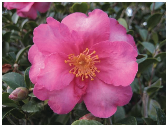
Figure 1. Camellia

Vegetables: Irish potatoes can be planted now. Start with healthy seed pieces purchased from a local nursery or online seed catalog. Continue planting cool-season crops, including broccoli, English peas, kale, carrots, and lettuce. See