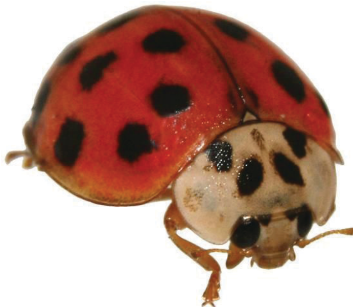
Figure 4. Lady beetle

Flowering plants: Check for thrips if leaves and/or flowers of gardenias and roses are damaged. See