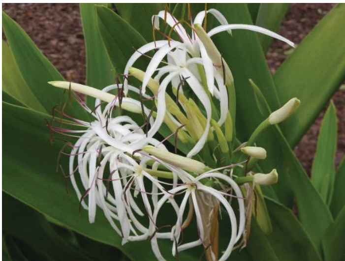
Figure 11. Crinum lily

Herbs: Continue planting herbs from seeds or plants. A wide variety of herbs prefer cool, dry weather, including cilantro, parsley, sage, and thyme. See