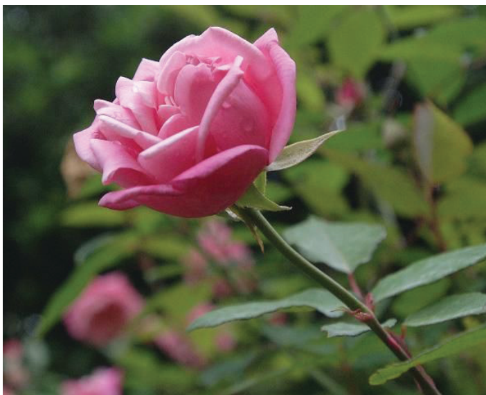
Figure 2. Rose