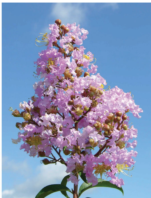
Figure 1. 'Apalachee' has light lavender flowers.

'Apalachee' crapemyrtle is a small deciduous tree with lavender flowers, dark green leaves, and cinnamon-orange bark. Lagerstroemia indica × fauriei 'Apalachee' is one of the hybrids released in 1987 from the breeding program of the U.S. National Arboretum. It grows as an upright to vase-shaped multi-stemmed tree in USDA Cold Hardiness Zones 7a-9b .