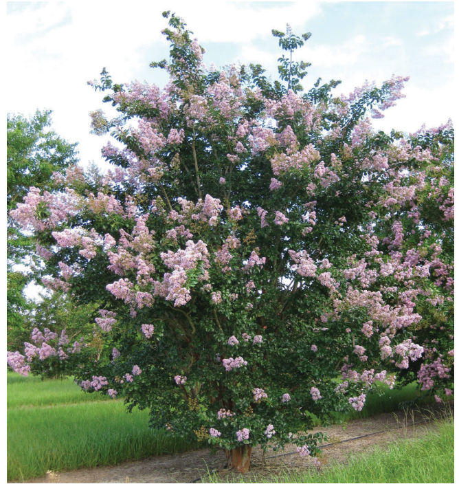
Figure 4. 'Apalachee' crapemyrtle in full bloom.

'Apalachee' grew to a height of 26 feet and a width of 21 feet in 15 years at former UF/IFAS facilities in Monticello, Florida. It was one of the most outstanding crapemyrtles in