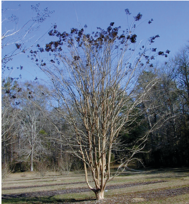
Figure 3. Seed capsules of 'Apalachee' add winter interest.

Seed capsules add unexpected winter ornamentation to the leafless branches of the deciduous tree. Because individual flowers are packed tightly in the flower panicle, the seed capsules are closely spaced. These long-lasting seed capsules add interest to the tree's profile, similar to the way dried flowers of oakleaf hydrangea add interest after the flowers have faded.