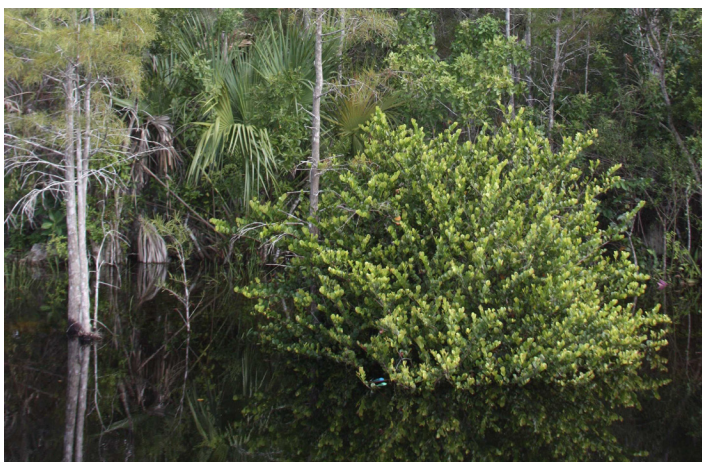
Figure 16. Cocoplum seasonally inundated by fresh water.