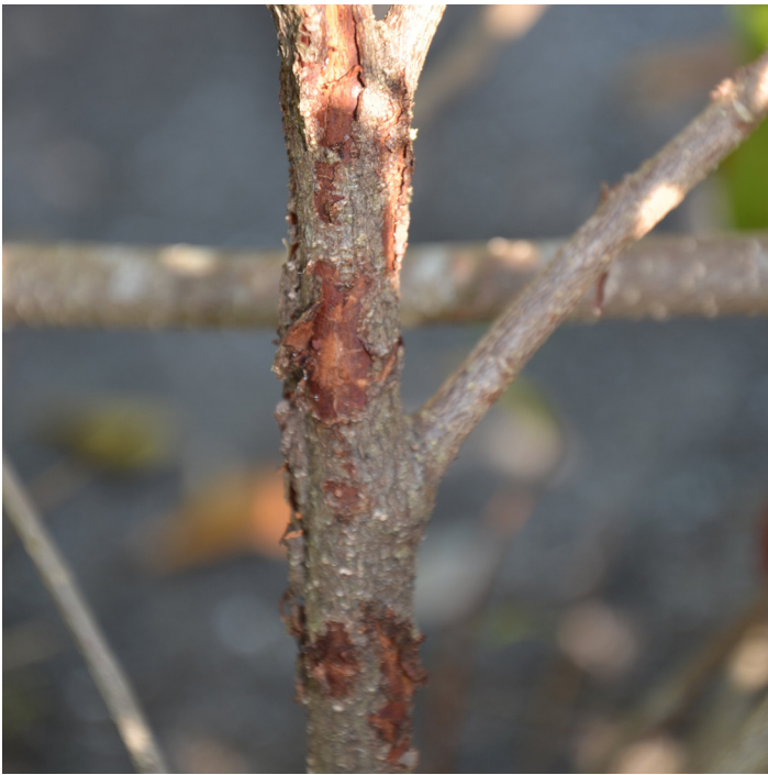
Figure 28. Botryosphaeria canker on cocoplum.