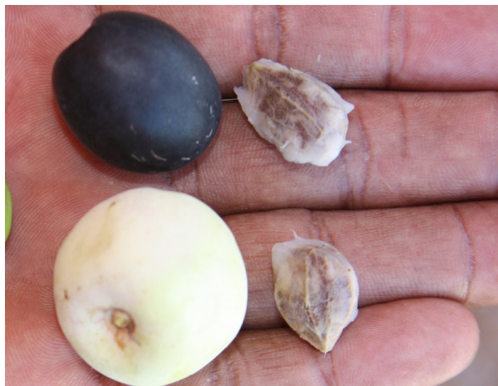
Figure 15. Single-seeded, round to oblong fruits with white to purple skin and sweet, white flesh.