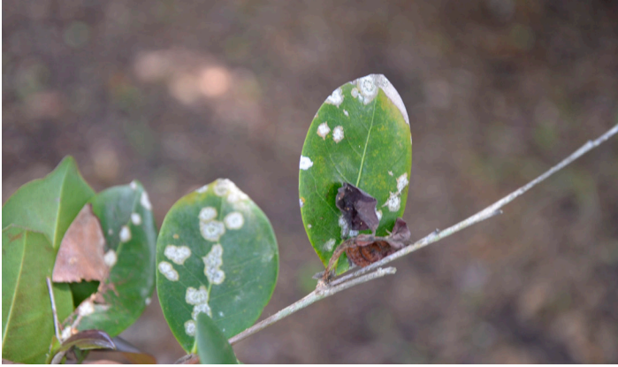
Figure 27. Algal leaf spot and stem dieback caused by Cephaleuros virescens .

been water-stressed. If infection happens in the crown, the whole plant may die.