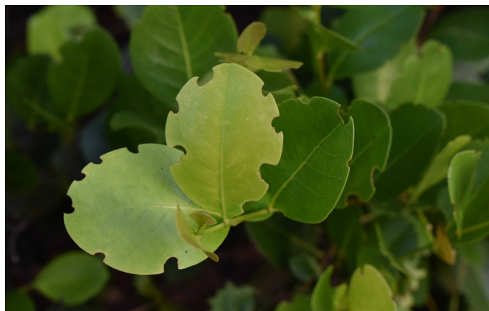
Figure 26. Damage to cocoplum caused by Sri Lanka weevil.