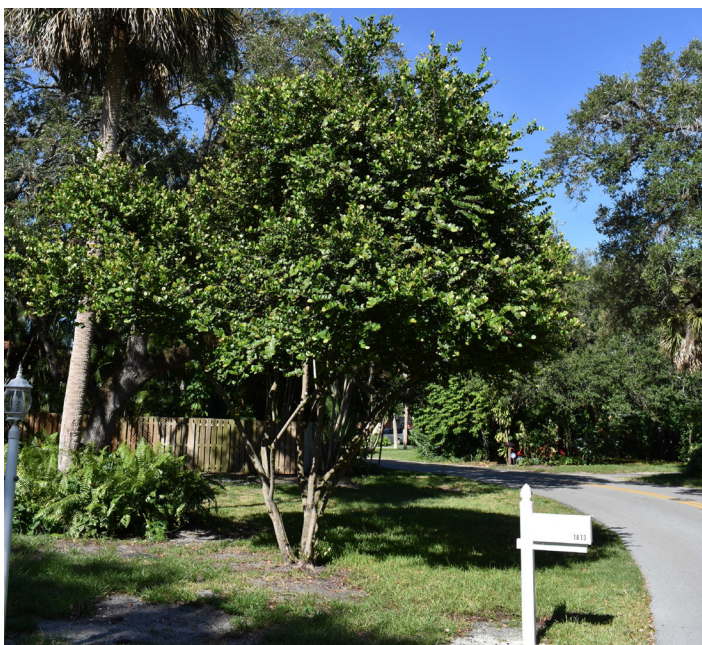
Figure 22. Small, multi-trunked 'Red Tip' tree about 15 feet tall.