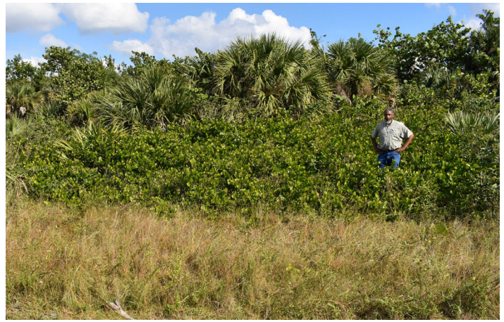
Figure 1. A portion of a single, fourteen-year-old, unpruned coastal form of mounding cocoplum.

A second form occurs mostly inland away from the coasts. Plants are fast, upright growers usually becoming 15 to 25 or more feet tall with an equivalent or wider width. They are either single or multi-trunked plants. The trunks of older single-trunked specimens are usually 5 to 7 inches in diameter. Branching may not occur until several feet above the ground, at which point they become densely foliated. Older multi-trunked plants also have dense foliage that touches the ground, giving them a symmetrical rounded or dome-shape appearance.