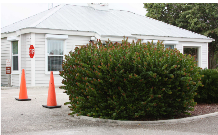
Figure 17. Cocoplum in high pH soil.