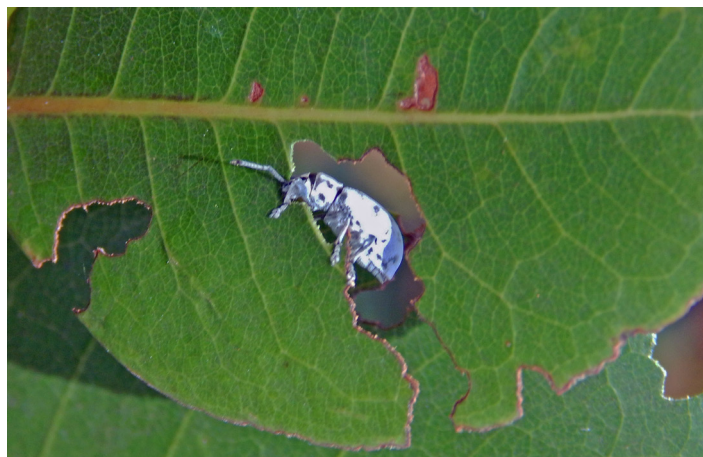
Figure 25. Sri Lanka weevil feeding on cocoplum.