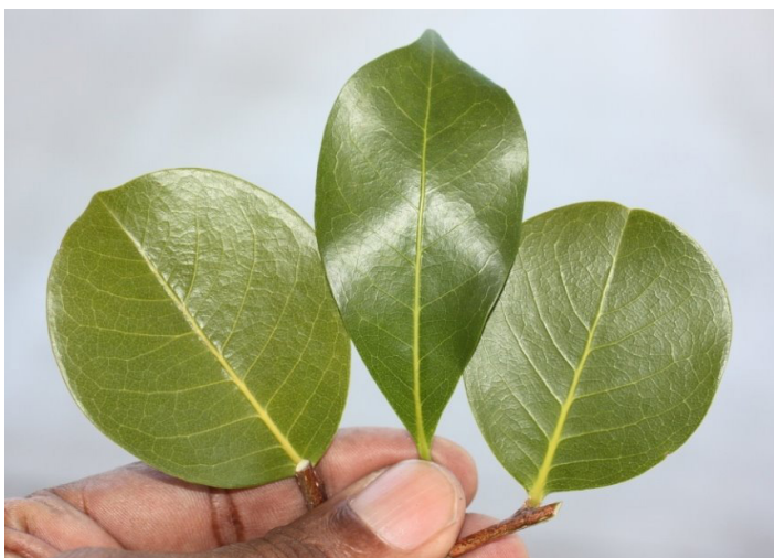
Figure 7. Leaf blades are broadly elliptic, obovate (center), or nearly round. Apices are rounded, abruptly pointed, or notched.