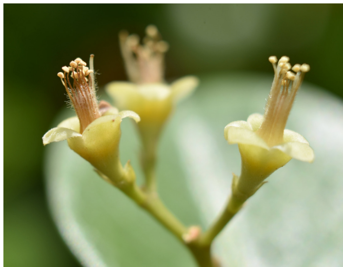
Figure 9. Flowers in cymule. The spreading, pale-yellowish structures are the sepals (petals have already apparently been shed).