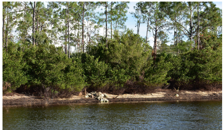
Figure 2. Naturally occurring plants of inland upright form of cocoplum.