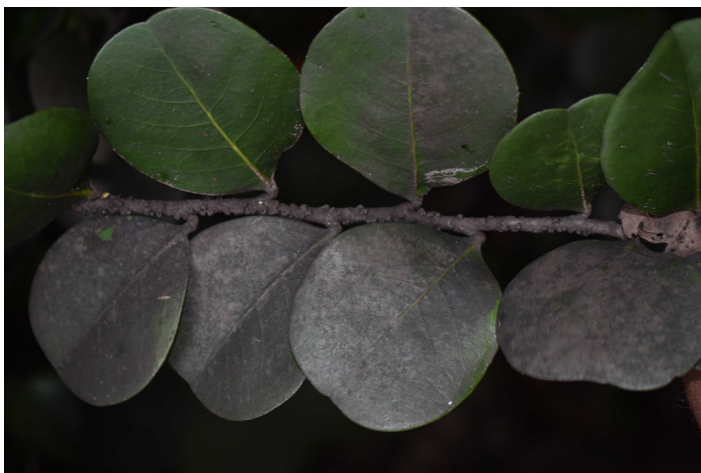
Figure 23. Residual lobate lac scales and accompanying sooty mold.

The little leaf notcher ( Artipus floridanus ) makes shallow notches along the leaf blades sometimes so uniform that they appear to be natural leaf serration rather than feeding damage. The Sri Lanka weevil ( Mylloderes undecimpustulatus undatus ) chews both shallow and deep notches along the leaf margins. The feeding pattern is very noticeable.