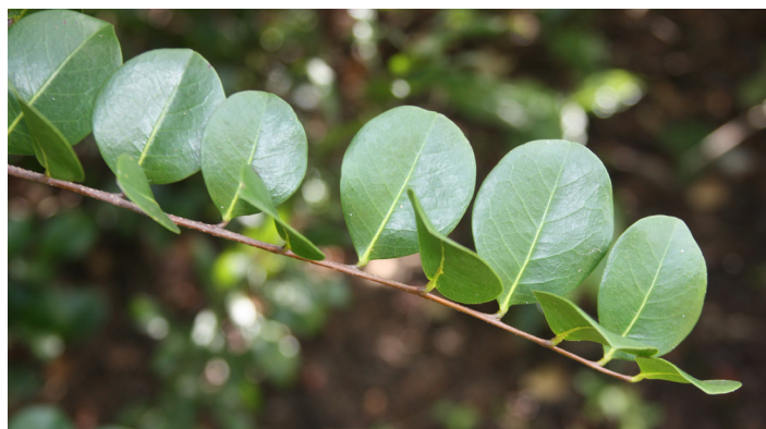
Figure 6. Upright, alternately arranged leaves forming a V-shaped angle.

Cocoplum leaves are alternate, simple, and entire. They point upwards, forming a V-shaped angle along the upper side of the stem. The blades are mostly 1.5 to 3.50 inches long, broadly elliptic, obovate (wider above the middle) or nearly round, and attached to a short petiole approximately 0.125 inches long. The tips may be slightly pointed, rounded, or notched. The base usually tapers to a point or is obtuse or rounded. The margins are thinly and tightly revolute (rolled under), which can be felt by moving a finger across the lower leaf margins. New leaves are thinner-textured, yellowish-green or often red-tinged. With age, they become leathery, smooth, shiny, and dark-green on the upper surface and a paler, matte green below. Midveins are lighter colored and prominent, except toward the distal (uppermost) portion of the blades.