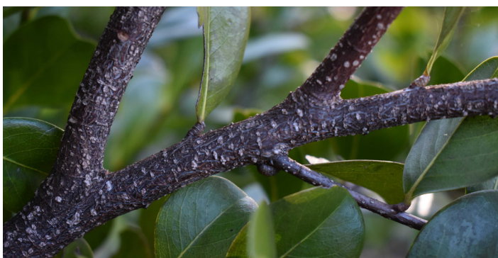
Figure 13. Mature branch with prominent, lighter-colored lenticels.