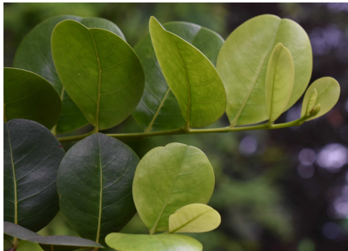
Figure 14. Simple, rounded, and rather leathery leaves alternately arranged and angled upward forming a V shape.