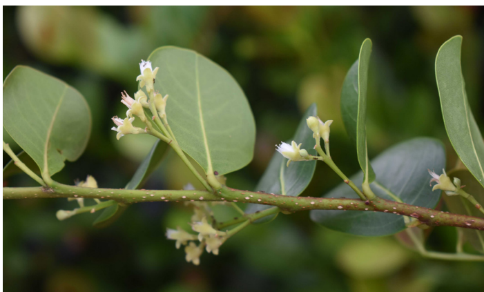
Figure 8. Axillary cymules hidden amongst the foliage.

Flowering is mostly from January to August, but the main flowering period is usually late spring. The flowers occur in rather inconspicuous, short, axillary, and terminal clusters called cymules (few-flowered, poorly branched inflorescences in which the central flower matures first). Each flower is perfect (with both male and female sexual organs), and measures about 0.25 inch long. The five distinct (unfused), spreading, pale greenish-to-yellowish sepals and five narrow, white petals are borne atop a conical receptacle (flower base or axis). The stamens vary in number from 12 to 25, and are irregularly fused into an erect, densely hairy tube in the center of the flower. The ovary is also shaggy and hairy, but the hairs are lost as the fruit develops.