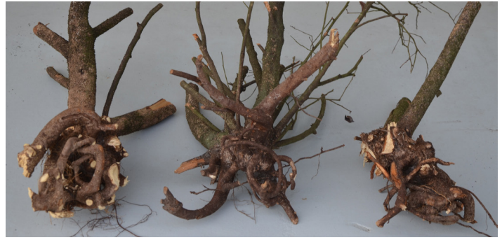
Figure 29. Circling roots of pot-bound cocoplums.

Plant disorders are caused by abiotic (non-living) factors (such as environmental stress), including over-irrigation, drought, or excessive pruning. Cocoplum and other plants may slowly decline when planted after being pot-bound for several years. The decline is especially pronounced when a plant is heavily mulched and exposed to prolonged soil moisture. Decline symptoms are similar to those of Botryosphaeria canker and blight.