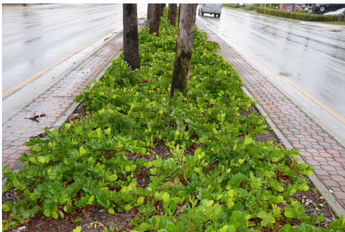
Figure 20. Recently planted 'Horizontal' cultivars in a 9-foot-wide roadway median.