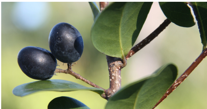
Figure 11. Oblong purple fruits on the inland ecotype of cocoplum.