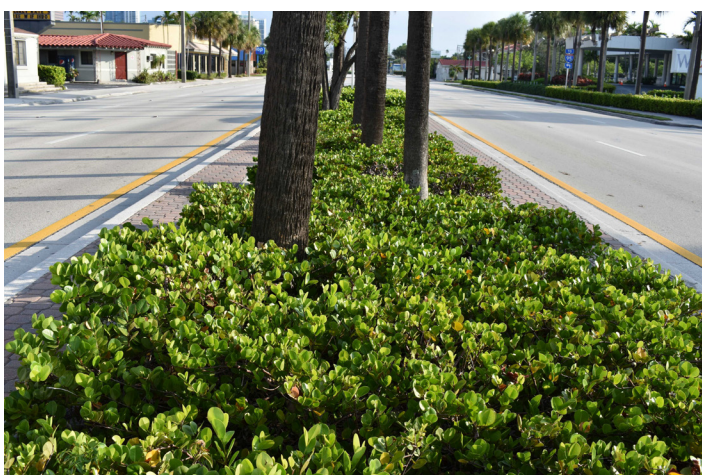
Figure 21. The same plants four years later and maintained at 20 inches tall.