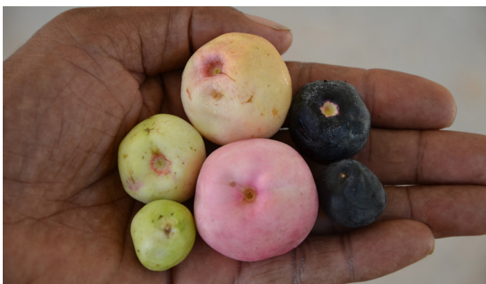
Figure 12. Typically appearing fruits. Left: 'Green Tip,' Center: 'Horizontal,' Right top: 'Green Tip,' Right bottom: 'Red Tip'.