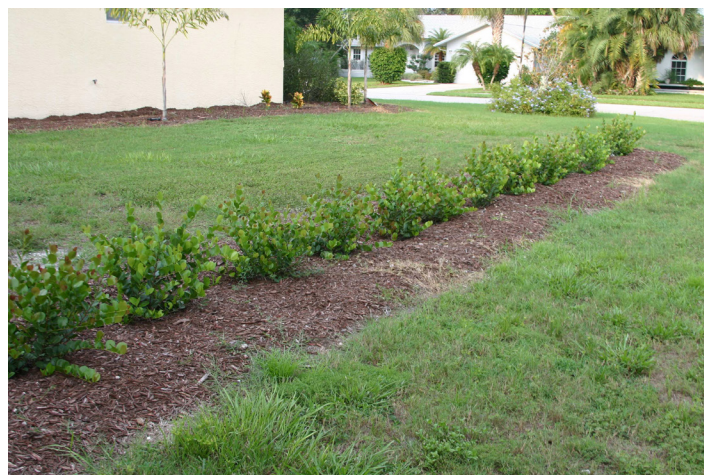
Figure 18. The start of a 'Red Tip' hedge.

Bushy shrubs (mostly of the inland ecotypes) may be pruned into small, multi-trunked trees. Cocoplum's nutritional requirement is low. However, young plants grow faster with adequate fertilization. Once a plant reaches four or more feet tall in a hedge row of the inland ecotype, fertilization is rarely (if ever) needed.