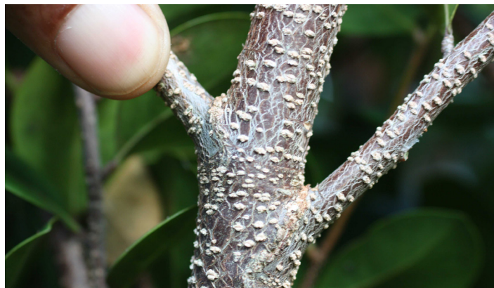
Figure 5. Conspicuous, raised, elliptic, lenticels.