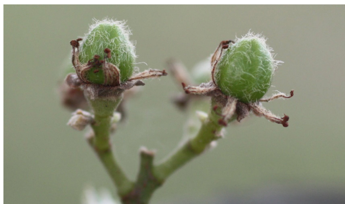
Figure 10. Shaggy, hairy ovaries that will become mature fruit.