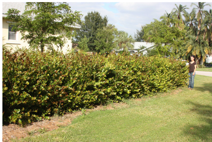
Figure 19. The same plants, 14 months later.