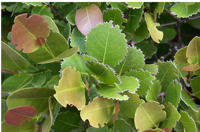
Figure 24. Damage to cocoplum caused by little leaf notchers.