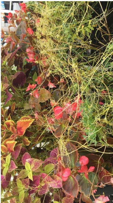
Figure 2. Dodder can spread vegetatively from one plant to another if the two host plants are close.