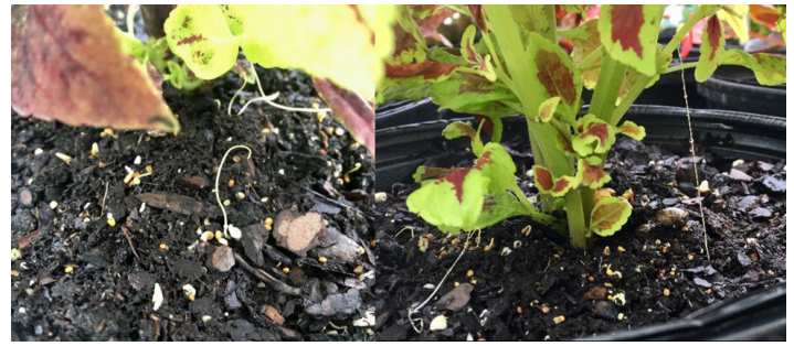
Figure 3. Dodder seedlings emerging (left) and beginning to attach to a coleus plant.

Seedlings are thin, twining, leafless, and vary in color from orange to yellow (Ashigh & Marquez, 2010) (Figure 3).