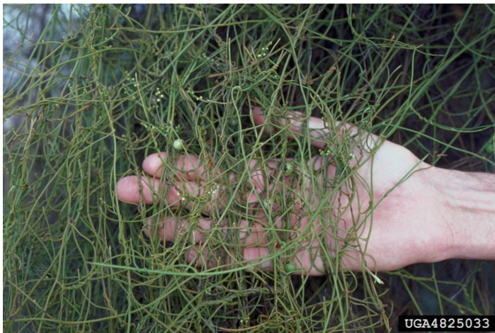
Figure 5. Love vine ( Cassytha filiformis ) is also a parasitic weed common in landscapes and is similar in appearance to dodder.

Leafless swallow-wort ( Cynanchum scoparium ) can sometimes be mistaken for dodder because it is also a thread-like vine that experiences leaf loss with age. Leafless swallow-wort vines are typically thicker than dodder and are green. Love vine ( Cassytha filiformis ) (Figure 5) is a parasitic plant found in Florida that can easily be mistaken for dodder. The primary difference is that love vine tends to climb and parasitize large woody plants and shrubs, whereas dodder tends to spread closer to the ground on herbaceous plants (Nelson, 2008).