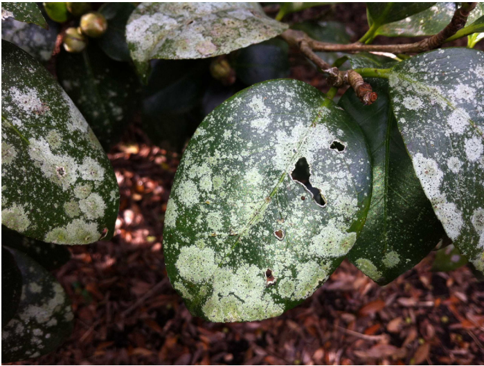
Figure 3. Camellia leaves with algal leaf spot.

Management Recommendations: Use selective pruning to increase air circulation and remove heavily infected leaves. No fungicides are recommended (McLeod Scott 2010).