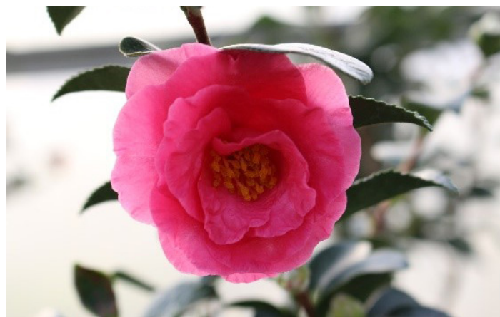
Figure 2. Camellia flowers come in a variety of colors, including the popular bright pink.

This publication provides information and general management recommendations for algal leaf spot, dieback, twig blight or canker, flower blight, wet root rot diseases, root rots, aphids, scale, spider mites, and nutrient deficiencies. For a more comprehensive guide of woody ornamental insect management, download the current Professional Disease Management Guide for Ornamental Plants or the Integrated Pest Management in the Commercial Ornamental Nursery Guide .