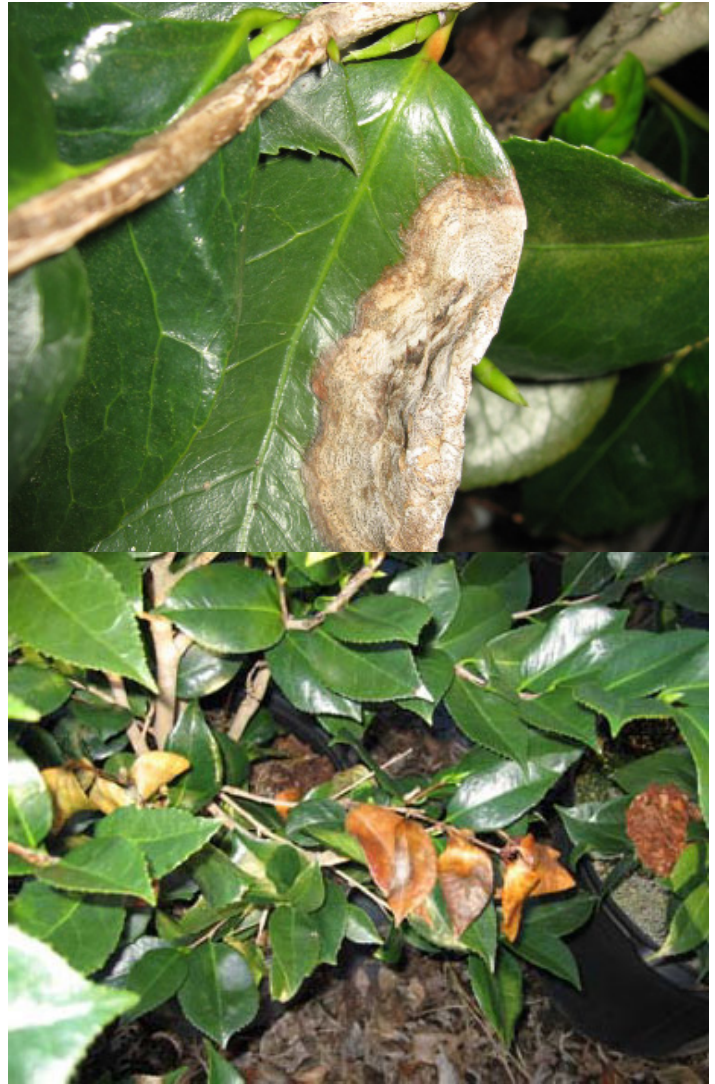
Figures 4 and 5. Leaves exhibiting Glomerella (Figure 4) and canker (Figure 5).

severe. The strain of Glomerella that affects camellia will not attack other plants; however, it will attack all species of camellia except C. sinensis . C. sasanqua and C. oleifera are more susceptible than C. japonica . C. sasanqua 'Cleopatra' is particularly susceptible, whereas C. japonica 'Charles S. Sargent' and 'Governor Mouton' are particularly resistant.