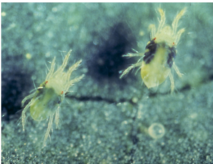
Figures 13 and 14. Southern red mites (Figure 13). Two-spotted spider mites (Figure 14).