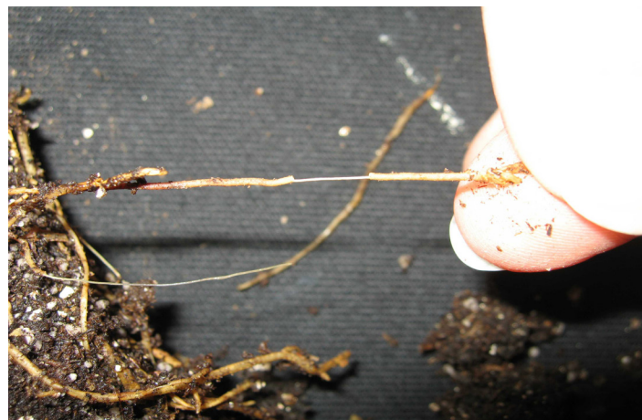
Figure 7. Roots exhibiting wet root rot with slipping roots.

Management Recommendations: Check roots of nursery-grown plants before planting into the landscape. Provide adequate drainage and reduce irrigation. Apply labeled fungicides if problem is diagnosed early and cultural problems corrected (Dewdney and Burrow 2016).