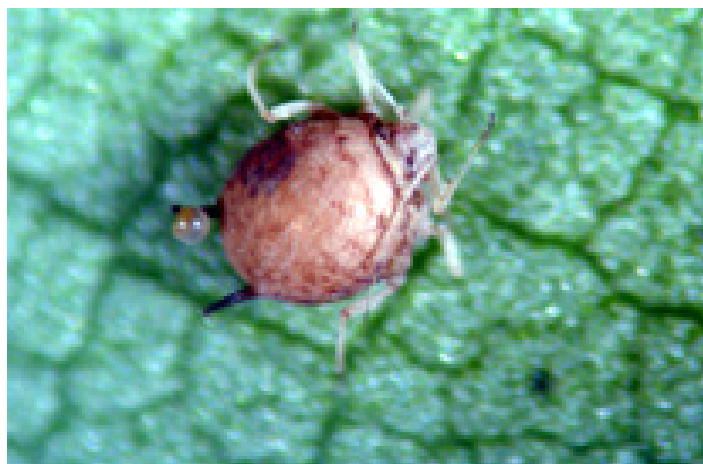
Figures 9 and 10. Aphids (Figure 9) and aphid mummies (Figure 10).