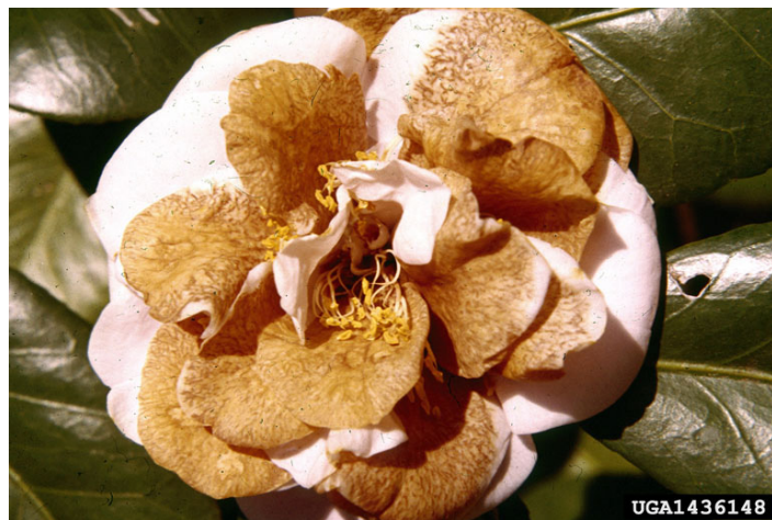
Figure 6. Camellia flower with flower blight.

Management Recommendations: Chemicals are used only where there is a history of severe infection, and should be targeted to the ground around and under the plants in the fall prior to flowering. A repeat application may be required if flowering is longer than four weeks. Keep the pathogen out of the nursery to avoid establishment of the disease by bringing in only clean plants and flowers. New plants from areas of infection should be bare-root to avoid the chance of sclerotia in the soil. Prune lower branches to increase air movement and to facilitate removal of old flowers. Collect and destroy diseased flowers (Hagan n.d.).