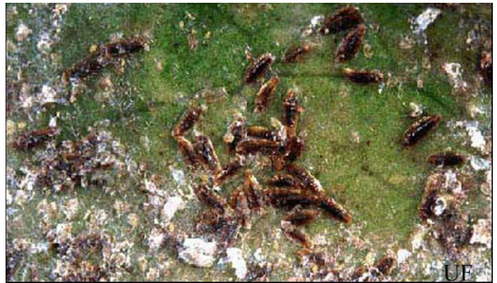
Figures 11 and 12. A leaf contaminated with tea scale (Figure 11). Tea scale infestations (Figure 12).