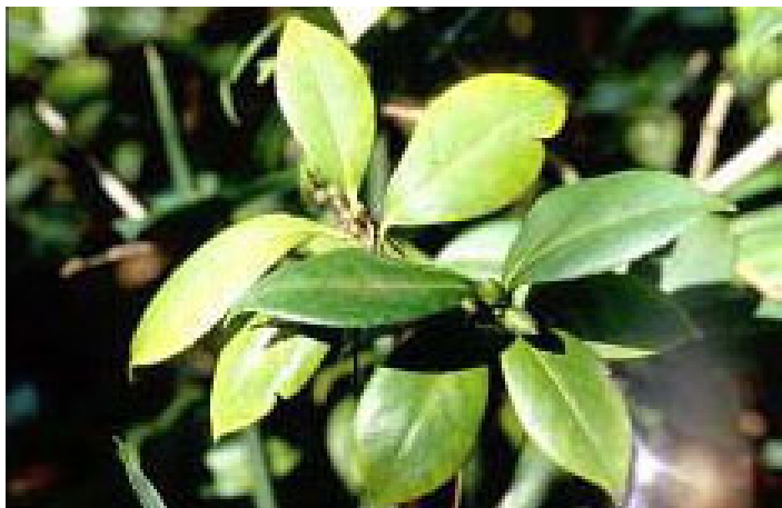
Figure 16. Leaves displaying signs of nitrogen deficiency.