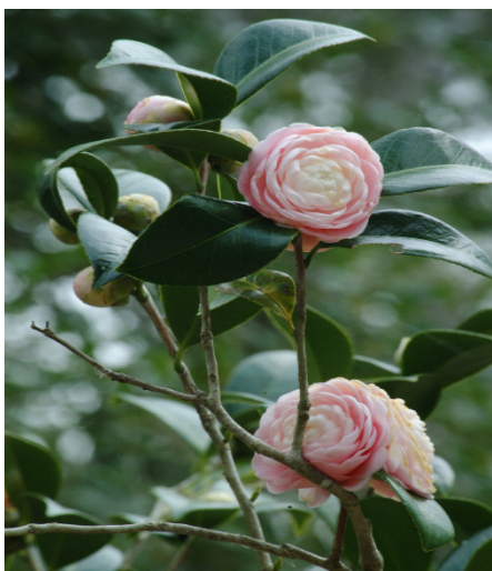
Figure 1. Camellia bushes with various color blooms.

Juanita Popenoe, Caroline R. Warwick, and Brian Pearson 2