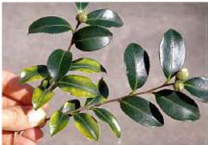
Figure 15. Leaves showing magnesium deficiency.

At first, symptoms are most severe on the oldest leaves as a uniform light-green or yellow coloration (Figure 16). As the deficiency becomes more widespread, the entire plant becomes a bright green or yellow color and growth declines sharply (Broschat 2017).