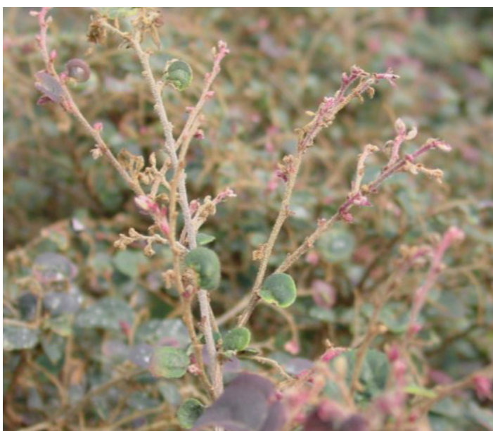
Figure 3. The effects of copper deficiency on Loropetalum leaves and new growth.