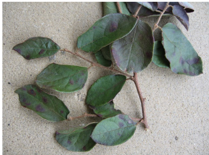
Figure 4. Loropetalum leaves showing signs of Pseudocercospora .