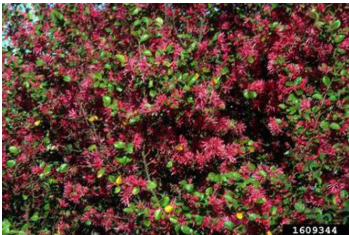
Figure 2. Chinese fringe blooms can range from pink (pictured) to white.