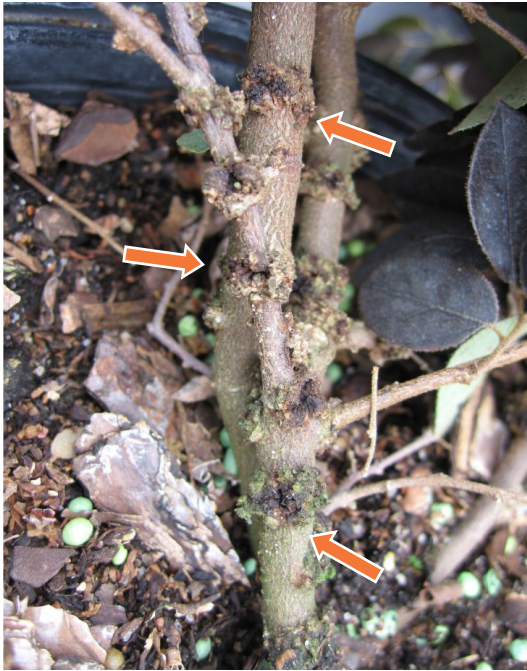
Figure 5. Loropetalum stems covered in Pseudomonas savastanoi galls.

tools after each cut, and briefly dipping cuttings in a fresh dilute (10% v/v) bleach solution or similar bactericidal surface disinfectant for 10 seconds followed by a quick rinse in clean tap water will reduce surface contamination of cuttings. Weekly applications of a copper bactericide during rooting may help prevent infection but may slow root development and growth. Preventative applications of copper bactericides should be continued during extended periods of wet weather in the field. Discard symptomatic plants; there are no chemical treatments that will eradicate the causal bacterium on diseased plants. Removal of galled branches will only slow the spread (Bonkowski, Joseph and Bayo 2015).