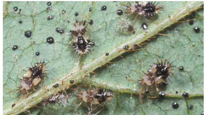
Figure 3. Azalea lace bug nymphs.

Azalea lace bug ( Stephanitis pyrioides (Scott)) damage is recognized as a stippled, silvery, chlorotic, or bleached appearance of the leaves. The symptoms are caused by the insects’ piercing-sucking type of feeding on the undersides of leaves. Adults are ⅛ to ¼ inches long and have cream colored bodies with transparent, lacy wings held flat on the back. The immatures lack wings but are covered with spines. Eggs are inserted into the undersides of leaves. Shiny black eggs or fecal spots are often observed (Gyeltshen & Hodges 2006).