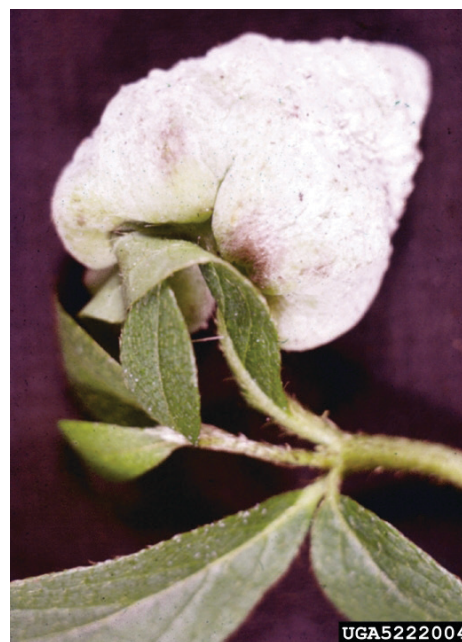
Figure 9. Exobasidium vaccinii grows on an azalea leaf and flower.

Leaves, flower parts, branch tips, and even seedpods are all affected by this fungus. Infected leaves develop fleshy galls ranging in color from pale green to pink to white and even brown. Flower parts can become so thickened that the whole bloom is turned into a hard, fleshy or waxy, irregularly shaped gall.