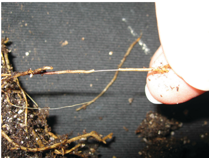
Figure 14. Root slip caused by root rot disease.