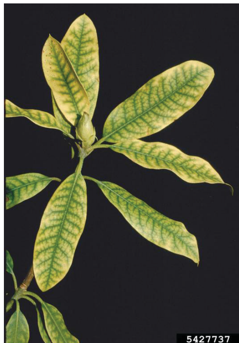
Figure 15. Azalea leaves showing symptoms of interveinal chlorosis due to iron deficiency.

The most desirable pH for growing azaleas is in the range of 5.0 to 5.5. Check the soil pH before choosing the acid-loving azalea. In some cases, pH may be effectively lowered with applications of elemental sulfur; however, it is not practical to continuously battle the high pH of calcareous soils. For existing plantings, use acid-forming fertilizers with iron. Additional soil and/or foliar applications of iron may help.