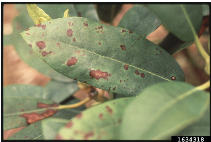
Figure 10. Azalea leaves showing symptoms of Cercospora leaf spot.

Circular to angular dark brown leaf spots occur on both sides of leaves. The spots may coalesce, especially along the margins. Under moist conditions, the fungus sporulates on both leaf surfaces, and greenish-brown fruiting stalks can be seen. When severe, chlorosis and defoliation can occur.