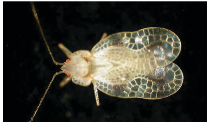
Figure 4. Adult azalea lace bug.