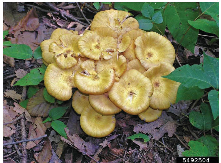
Figure 11. Armillaria root rot fruiting bodies. Notice the tight cluster that shares a basal anchor to the ground.

Mushroom root rot causes a slow decline that can take a year or more to kill the plant. Symptoms begin with chlorosis of foliage on the lower branches and progressive thinning of the canopy. Usually, during the high temperatures of summer, plants will desiccate quickly and hold onto their dry, grey-green leaves. Single-stemmed plants can be killed outright, while multi-stemmed plants may partially survive. An examination below the bark at the soil line will reveal the creamy white mycelium of the fungus. After the plant has died, the honey-colored mushrooms may appear in the area of the dead trunk.