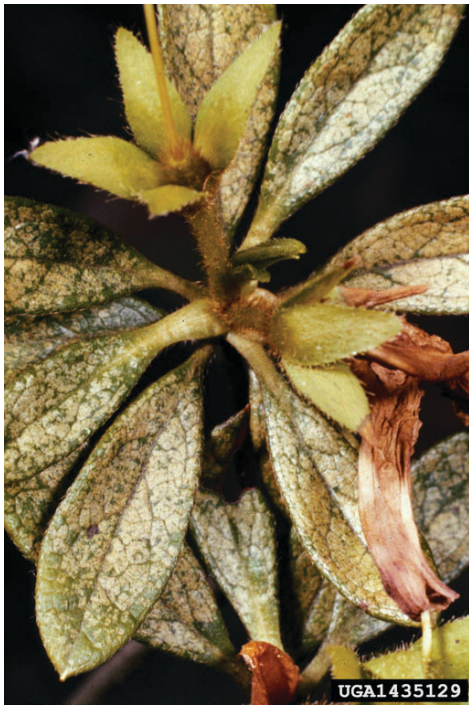
Figure 5. Damage caused by the sucking of azalea lace bugs.