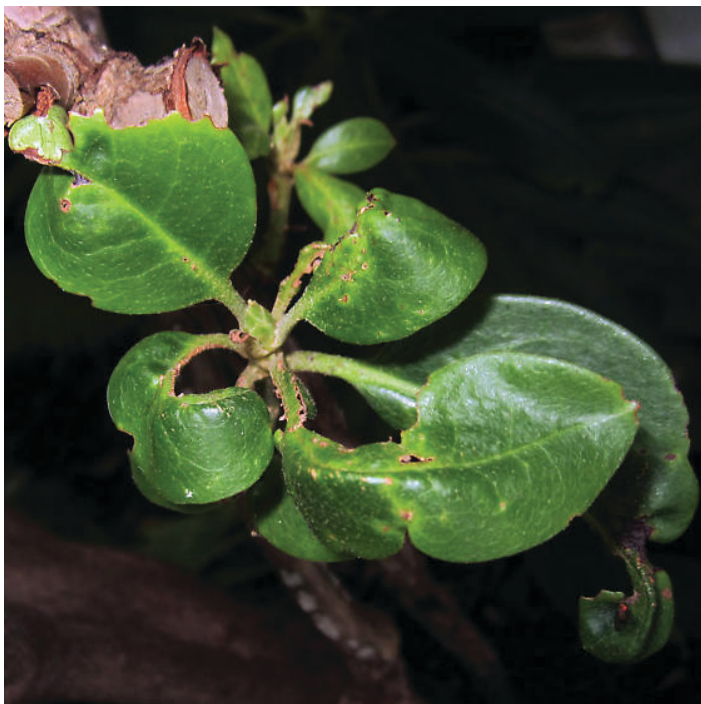
Figure 7. Damage caused by Rhododendron gall midge.