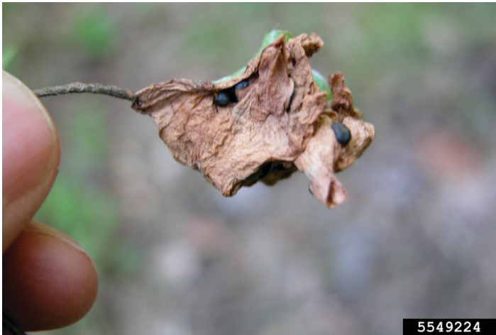
Figure 12. Symptoms of petal blight on azalea.

Symptoms begin as small, water-soaked spots on the flower petals. The brown lesions rapidly enlarge and become slimy, and entire petals become blighted. Infected flowers turn prematurely brown but usually remain on the plant longer than non-infected flowers.