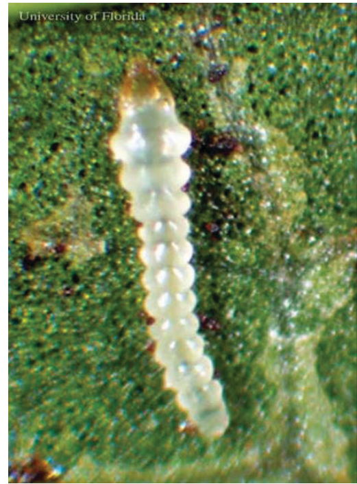
Figure 6. Mature larva of the azalea leafminer.

The azalea leafminer ( Caloptilia azaleella ) is a larva of a tiny yellow- and purple-marked moth. The larvae mine between the upper and lower leaf surfaces until they are about half-grown. Once they emerge, the leaf tips or margins fold over themselves while they continue to feed on the leaves. Damage appears as dry, brown spots on the leaves. Mature larvae are about ½ inch long and yellowish brown. They pupate inside the mines (Dekle 2007). In Florida, the larvae are found every month in the year; however, azalea leafminers are most prevalent in the spring and summer months.