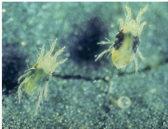
Figure 8. Deuronymph (left) and mature female (right) twospotted spider mites.

larger and move more quickly. Insecticidal soaps, horticultural oils, or approved miticides may be used to control mites when necessary.