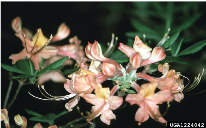
Figure 13. Azalea petals showing petal blight symptoms.