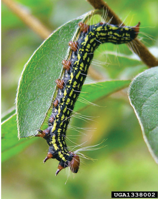
Figure 2. An adult azalea caterpillar.

When azaleas are missing significant amounts of foliage, the azalea caterpillar may be the cause. Often the caterpillar is not detected until most of the plant has been defoliated. Tips and margins of leaves can also appear rolled, damaged by feeding larvae inside.