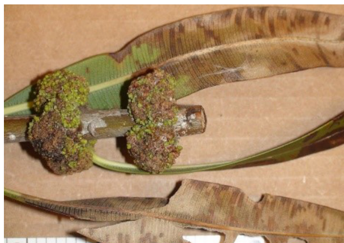
Figure 9. Galls on infected branches.