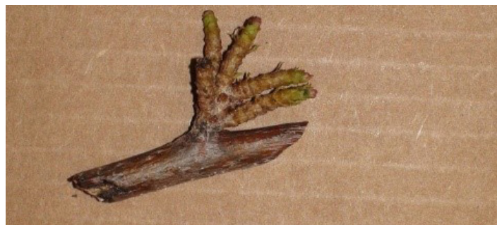
Figure 8. The “witches’ broom” effect stemming from infested branches.