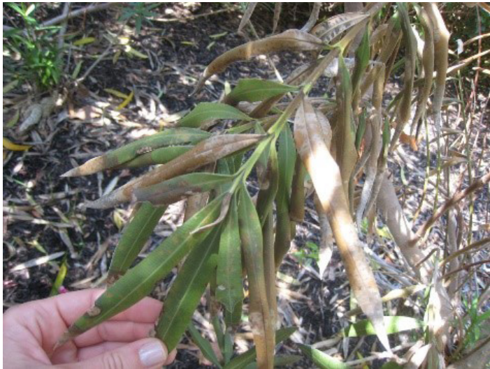
Figure 10. Oleander leaf scorch observed on oleander leaves.