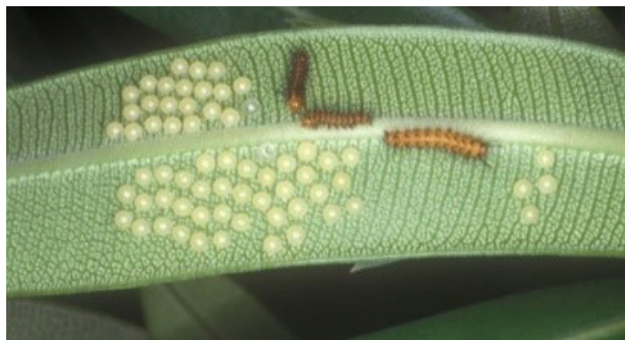
Figure 6. Oleander caterpillar egg clusters and larvae.