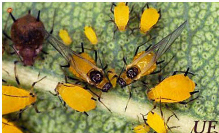
Figure 3. Alata and nymphs of the oleander aphid.