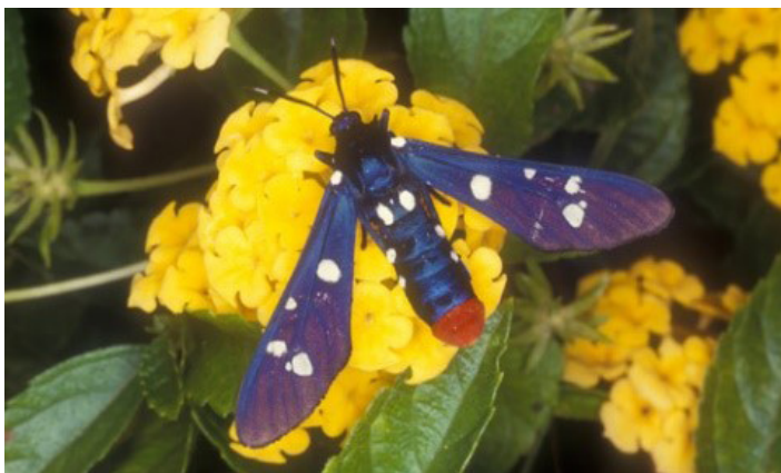
Figure 7. A polka-dot wasp moth. Note the coloration and wasp-like appearance.