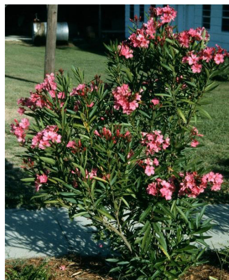
Figure 1. Oleander bushes are common in the landscape.

Oleander ( Nerium oleander ) ranges from a rounded shrub to a tree standing 10 to 18 feet high with long dark green leaves. Oleander is known for its beautiful fragrant flowers, which vary in shades of red, yellow, white, or pink. It is a nonnative species, but it is adapted to climatic conditions throughout Florida and can be found in USDA Hardiness Zones 9A through 11. Oleander is mildly cold tolerant but may experience injury in very cold weather. Full sun is necessary for best flowering and for development of a full, fountain-shaped crown. In shade, it will grow lanky and produce few flowers. Oleander is tolerant of a wide range of soil types and grows well in sandy dry areas. While highly salt tolerant, it does not do well when directly exposed to salt spray. When planting in coastal areas, plant oleander behind the dune lines for best results. It is adaptable to a pH range of 5.0 to more than 8.3. Once established, it is very drought tolerant, but moist soils or irrigation stimulate growth. This species typically has low fertility requirements; established plants usually do not need fertilizer because root systems typically can extend into lawns, where they absorb nutrients from turf fertilizers (Gilman and Watson 2014).