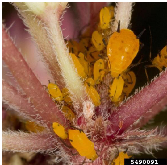
Figure 4. Oleander aphids on an oleander flower.