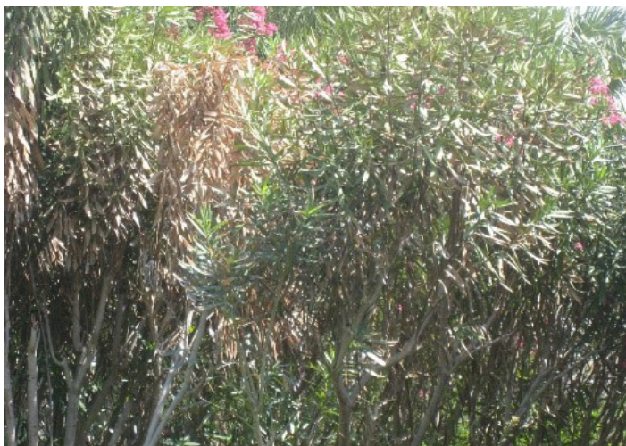
Figure 11. Oleander leaf scorch spread to the canopy.