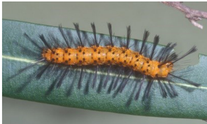
Figure 5. Orange and black larva of the oleander caterpillar.