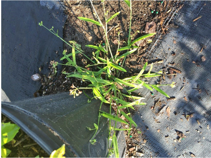
Figure 1. Doveweed plant growing through torn weed fabric.

Doveweed is usually a low-growing, creeping annual with leafy or succulent branches. Stems may be either erect (upright) or semi-erect up to 12 inches tall, but doveweed usually does not reach this height (Figure 1). Doveweed forms dense mats by rooting along its nodes when the nodes are in contact with the soil.