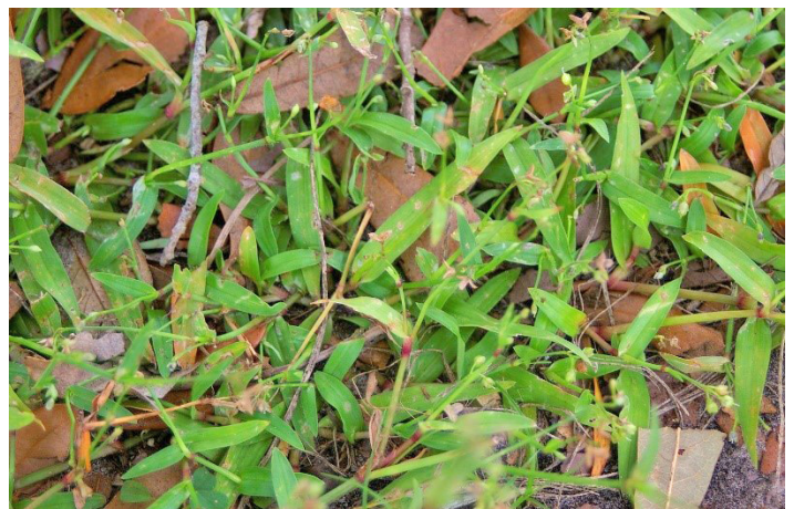
Figure 4. Doveweed leaves.