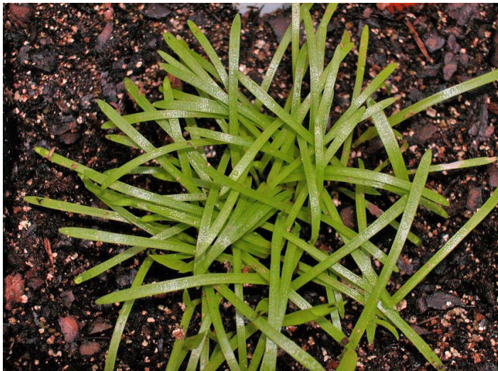
Figure 2. Grass-like doveweed seedling. Credits: Annette Chandler, UF/IFAS

Germination begins during the onset of warm and wet weather, typically around April or May in Florida, and continues throughout the summer. The leaves of young plants grow in a circular arrangement (rosette). The creeping stems are succulent, root along the nodes, and are grass-like. (Figure 2)