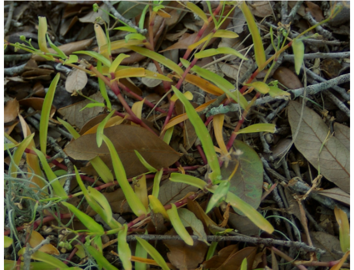
Figure 3. Doveweed stems. Note—the creeping stems resemble a grass.

The stems of the plant may not be visible, especially when growing in a dense mat. However, the stems are succulent, round, and smooth, and they root extensively along the nodes. The stems may be purplish to reddish in color (Figure 3). The leaves have parallel venation and are 2 to 5 inches long, 0.25 to 0.5 inches wide, narrow, pointed, spirally arranged, and clasp the stem (Figure 4). When young, doveweed is often misidentified as a grass. Leaf sheaths have soft hairs on the upper margins. Doveweed shoots often have a shiny appearance compared to other weed species.