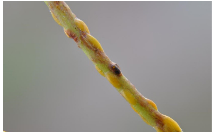
Figure 15. Female Philephedra scales on railroad vine.