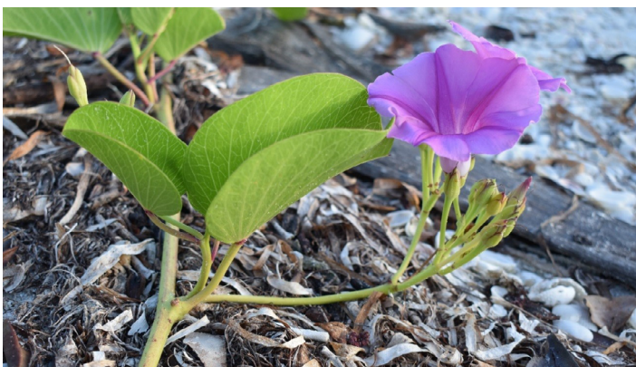
Figure 5. Flowers are borne in single- to few-flowered cymes at the leaf axils.

Flowers may be produced year-round but are most abundant during the warmer months (from spring to fall), and less common in winter. Each flower lasts only one day, opening at sunrise and closing by early afternoon on sunny days. On cloudy days, flowers often open and close later. Railroad vine is an obligate out-crosser, meaning the flowers are self-incompatible (self-pollinated flowers result in very few or no fruit). Insects attracted to the large nectaries of the showy flowers assist in cross-pollination. The primary pollinators are bees, but butterflies, moths, flies, beetles, wasps, and ants may also visit the flowers.