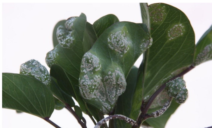
Figure 21. White rust on railroad vine.

Most fungicides labeled for diseases caused by any one of these more common pathogens are likely to be effective for white rust as well. Check the fungicide labels for site clearances, because some have landscape clearance, while other are for nursery or commercial use only. Recommended fungicides include those with the active ingredient azoxystrobin, cyazofamid, mefenoxam, or pyraclostrobin.