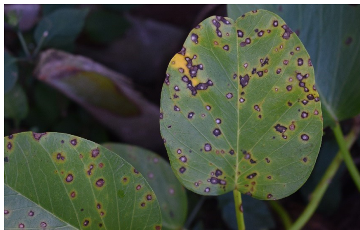
Figure 20. Cercospora leaf spot on railroad vine.