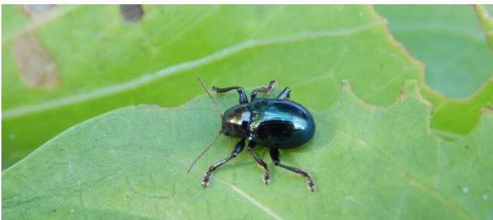
Figure 13. Adult sweet potato beetle on railroad vine leaf.

The sweet potato beetle ( Typophorus nigratus ) occurs in most of the southeastern United States. Adults, which are black and shiny, feed in groups on the foliage of sweetpotato and morning glories (including railroad vine), causing defoliation. Eggs are laid in or near the soil surface at the base of a plant. Larvae are pale yellow with six small legs, are nearly ½ inch long, and develop on the roots and stems. They first burrow through the stems and later tunnel through the roots, causing major damage to both tissues.