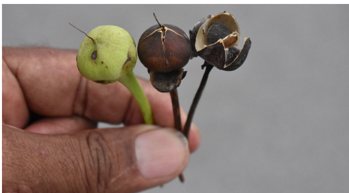
Figure 8. Immature fruit are green, turning brown and splitting into four valves at maturity.