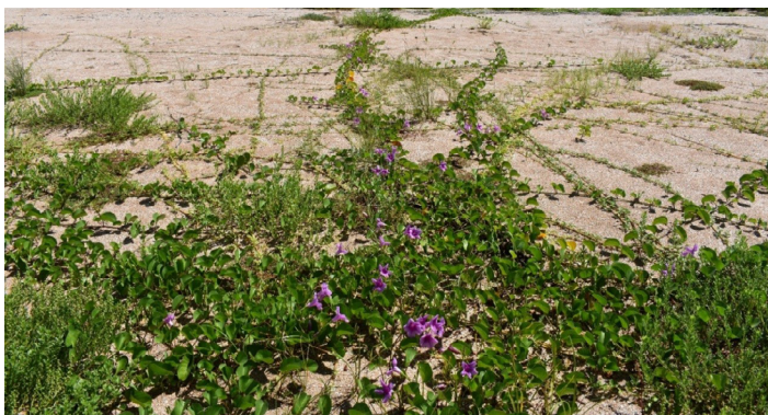
Figure 1. Creeping habit of railroad vine.

This is a tap-rooted, herbaceous, creeping (rarely twining), perennial vine that produces a milky latex when broken. It grows rapidly and usually does not form a dense cover on Florida's beaches. The common name "railroad vine" refers to its tendency to form "tracks" of horizontal stems more than 100 feet long.