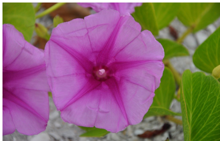
Figure 7. Five rose-purple markings radiate from the throats up the center of each of the fused petals.