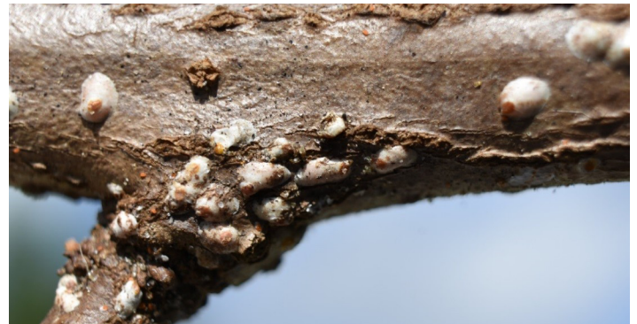
Figure 14. White peach scales on the mature stem of railroad vine.

Several predators, including ladybird beetles and common lacewings, feed on scales and mealybugs. Chemical control for scales and mealybugs includes insecticidal oils and various other insecticides.