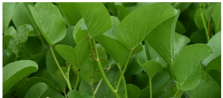
Figure 3. Leaves are alternate, glabrous, often notched at the tips, and folded upwards. Note the paired red nectaries at the juncture of the petiole and the leaf base on the three leaves in the center of the photo.

The leaves are simple, alternately arranged, dark green, rather leathery, and glabrous (hairless). Leaf shape is quite variable in this species but is typically ovate (egg-shaped), orbicular (circular), or oblong (parallel-sided). The leaf base is truncate to shallowly cordate (heart-shaped), and the apex is usually notched to deeply cleft, but sometimes rounded or truncate. The epithet pes-caprae is Latin for "goat's foot," referring to the notched leaf apex (resembling the cloven hoof of a goat). The leaf blades are usually 3.0 to 4.75 inches long and 3.5 to 6.0 inches wide, and they are often folded upward from the midrib. The veins on the leaf blades are pinnate and finely reticulate (net-like), typically more visible on the leaf undersides than on the upper surface. The petioles (leaf stalks) vary in length ranging from 1 to 6 inches. On young leaves, the petioles are commonly reddish in color, becoming yellowish-green as they age. There is a pair of nectar-producing glands on the underside of each leaf blade at its juncture with the petiole. These nectaries are red on new leaves, turning black with age, and attract ants, which defend the plant against herbivorous insects.