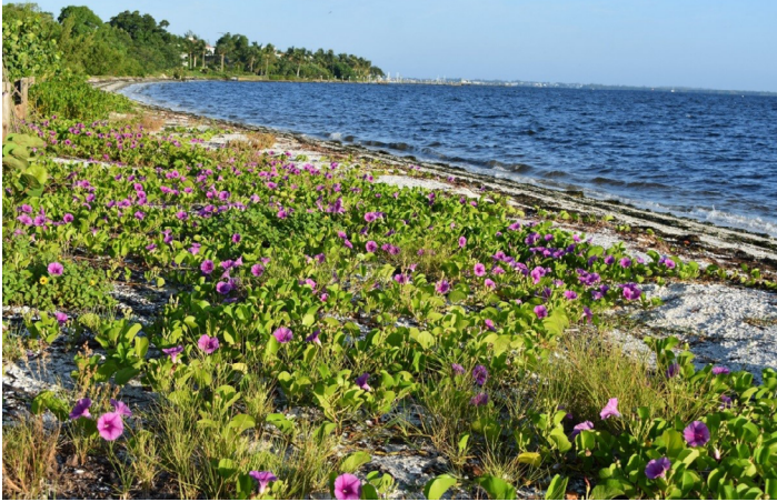
Figure 11. Railroad vine used as a beach stabilizer.

months, the plants may appear scraggly, but they will quickly recover at the start of the rainy season.