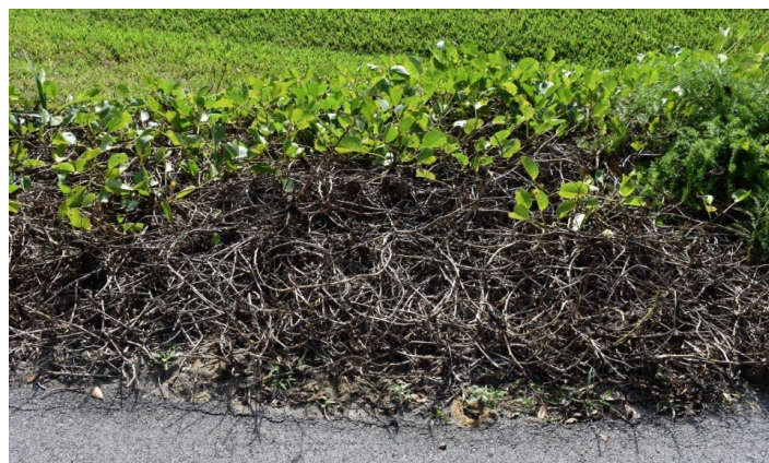
Figure 19. Dieback from Cercospora leaf spot on landscape bed of railroad vine.

Leaf spot caused by the parasitic fungi in the genus Cercospora can have devastating effects on dense or mounded ornamental plantings of railroad vine, as well as weakened, sparse patches in coastal habitats. Infection with Cercospora often begins during the warm, moist months of summer and is more likely on sites that are excessively irrigated or poorly drained, or that have reduced sunlight or airflow. Infection usually starts from the bottom of the plant and progresses upward toward the new growth. Leaf spots are usually circular, often surrounded by a red to purple border or halo, and can cover small or large portions of the leaf blade. In older lesions, necrotic areas may develop (the center of the spots becomes brown and the tissue dies, leaving a hole). Under ideal conditions, Cercospora can cause severe defoliation and massive stem dieback.