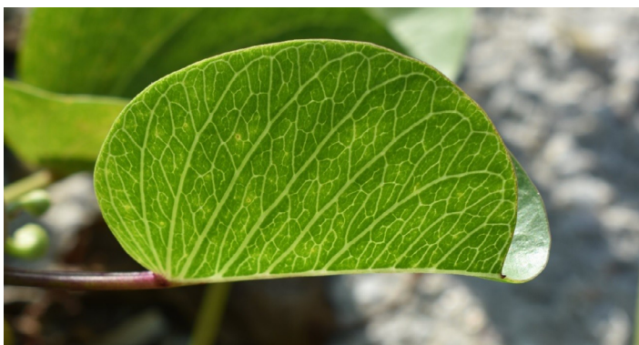
Figure 4. The veins are pinnate and reticulate (net-like), often more noticeable on the leaf undersides.