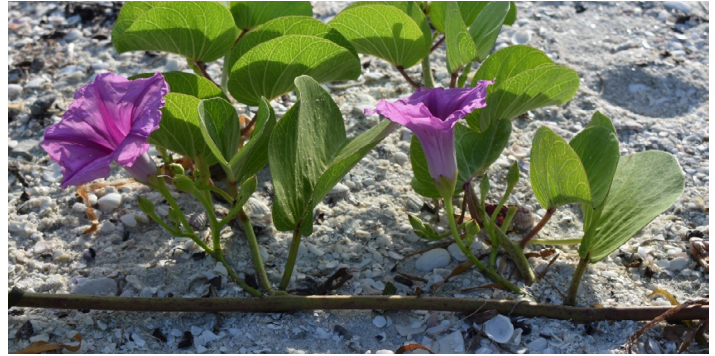
Figure 2. Plants often form adventitious roots at the nodes. Flowers are axillary.

encounters something to climb upon, they may occasionally twine upward. Plants usually are between 6 to 16 inches in height.