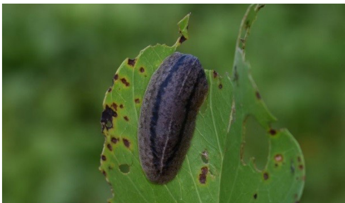
Figure 18. Leatherleaf slug with dorsal dark stripes and a thinner pale stripe in the center.

Florida leatherleaf ( Leidyula floridana ) is a tan-colored slug. It often has brown or black spots that coalesce into a single dark stripe on either side of its body and a long, pale, thin stripe down the center of its back. It is native to the Caribbean region and southern Florida. When disturbed or at rest, it is contracted with hidden tentacles. When moving or feeding, it is stretched out with exposed tentacles. It can cause unsightly foliar damage on railroad vine.