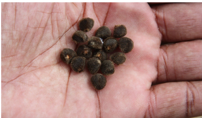
Figure 10. The seeds are small, rounded to three-angled, and covered with fine, brown hairs.