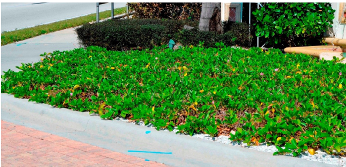
Figure 12. Railroad vine as a landscape groundcover.