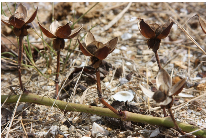
Figure 9. Capsules borne on elongated pedicels with persistent sepals. A close look shows seeds in the capsules.