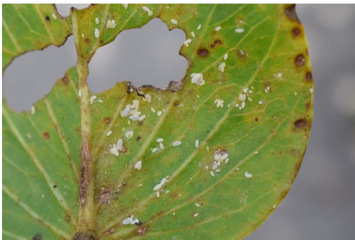
Figure 16. Madeira mealybugs on railroad vine.