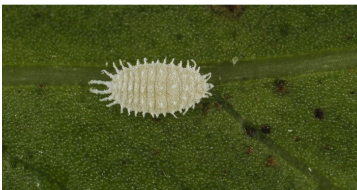
Figure 17. Close-up of adult female Madeira mealybug on railroad vine.