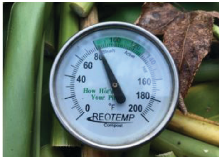
Figure 3. Compost thermometer.

Temperature of the pile is another determining factor in how quickly decomposition will occur. Temperature will depend on the size of the compost pile, available oxygen, and moisture content. The most effective temperature range for creating compost is between 122°F and 131°F. Temperatures between 133°F and 140°F will destroy diseases and weed seeds, but it is difficult to maintain that heat for an extended period. Long-stemmed compost thermometers are available to monitor temperatures.