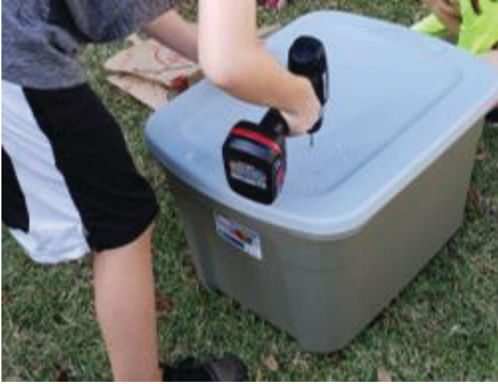
Figure 9. Single worm bin assembly. Step 1: Drill holes in lid and bottom of upper bin.

with the carbon source (shredded paper, etc.) layer to seal in odors and provide fresh bedding for the worms.