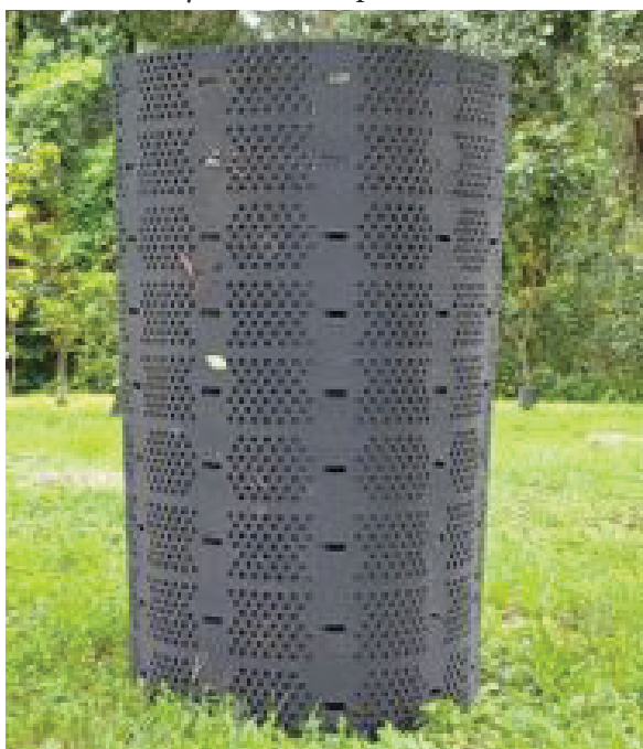
Figure 4. Lightweight plastic bin with ventilation holes for aeration and moisture control.

When adding new material to the compost pile, layer greens and browns in 3" to 4" layers, or mix greens and browns together before adding to the pile. Top with a brown or carbon layer to seal in potential odors.