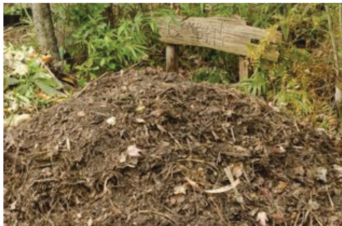
Figure 5. Compost pile without receptacle.

produced by following a few easy guidelines. A two-inch layer of compost can be broadcast over the garden and incorporated six inches into the soil two to three weeks before planting. Compost can also be used to top-dress edibles in containers as well as in the ground to improve soil structure, increase moisture-holding capacity, and reduce irrigation needs.