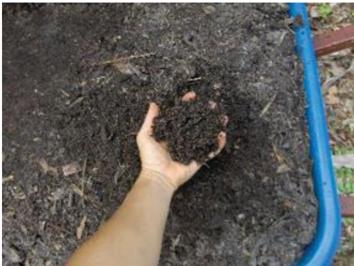
Figure 7. Finished compost ready to be applied to garden.