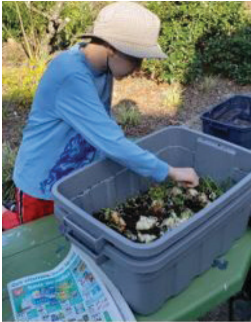
Figure 10. Single worm bin assembly. Step 2: Fill bin with greens for food source, bedding, starter compost, and worms; moisten with water.