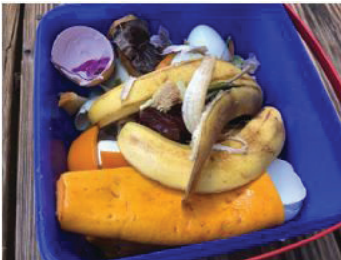
Figure 2. Fruit and vegetable scraps ready to compost.