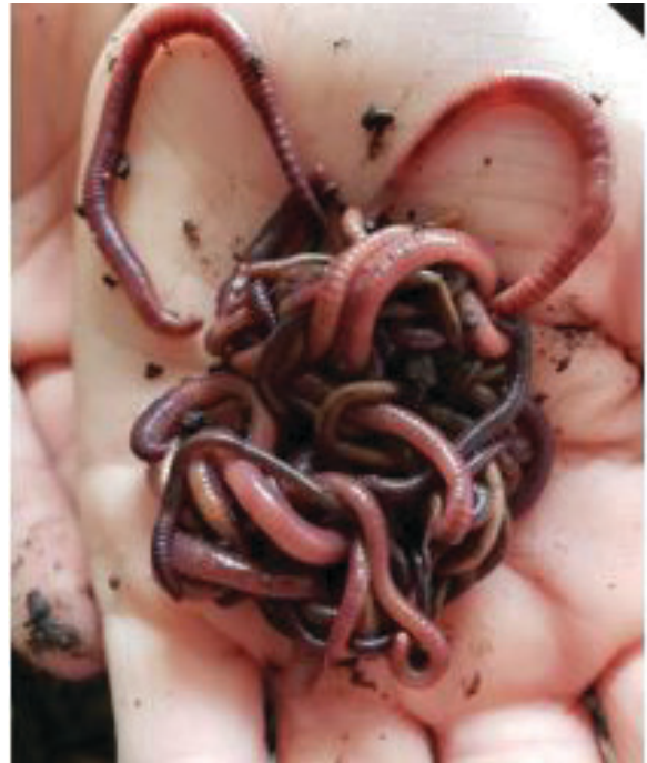
Figure 8. Red wiggler composting worms, Eisenia fetida . Red wigglers can eat over half their body weight in food a day, and their population doubles every 90 days!

To harvest the worm castings, simply dump the finished compost onto a tarp and separate the worms from the finished castings by hand. They will retreat from the light and gravitate towards the inner pile, leaving you with mostly worms and some starter castings to restart a fresh bin.