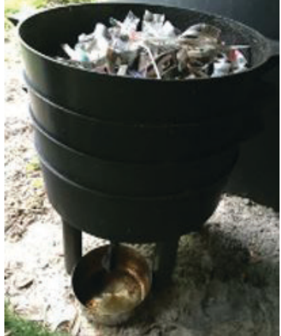
Figure 11. Multilayer worm bin with lid off to show paper bedding.

a carbon source. They can be fed daily or weekly—the more food supplied, the more compost will be created. Ensure the lid is closed tightly each time to prevent worms from escaping.