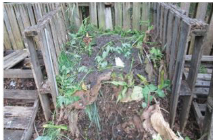
Figure 6. Compost pile made from pallets.