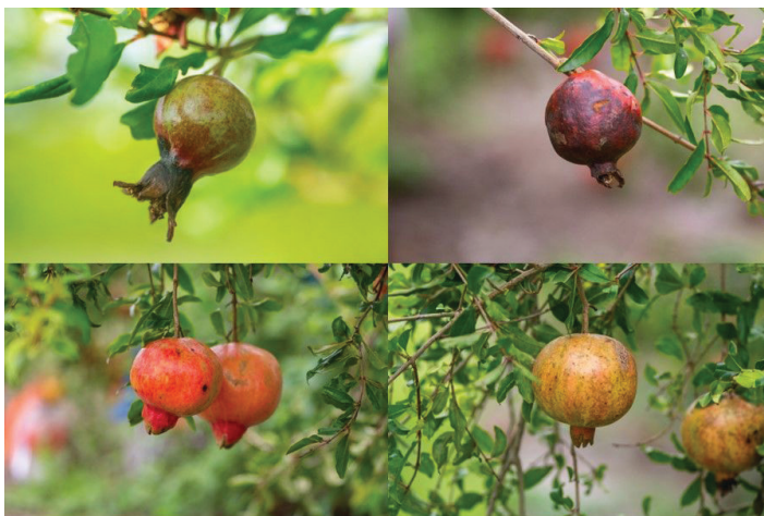
Figure 1. Examples of anthracnose fruit rot in pomegranate caused by Colletotrichum species (top row) versus fruit that are not infected (bottom row).