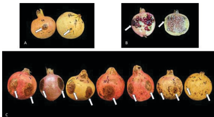
Figure 4. A and B: Compare the fruit rot lesion size in two representative cultivars, 'Kazake' (left) and 'Azadi' (right), 14 days post inoculation, externally (A) and internally (B). C: Anthracnose lesions (highlighted by the arrows) in seven pomegranate cultivars, 'Afganski', 'Kazake', 'Eversweet', 'Nikiski Ranni', 'Al-Sirin-Nar', 'Fleishman', and 'Azadi'.