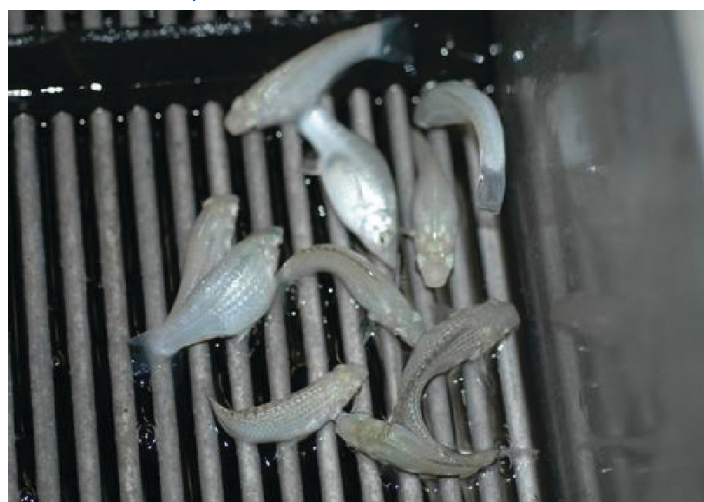
Figure 2. Close up of fish in box grader with insert.