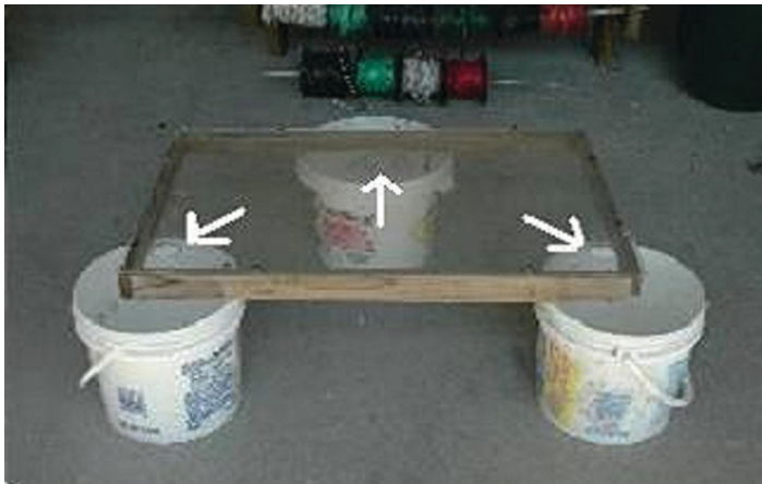
Figure 4. Grading table.

Hand grading allows the farmer to inspect each fish visually for specific characteristics. As the number of characteristics selected increases, so too does the time required to hand grade. To save time and increase the efficiency of hand grading, some farmers use grading tables made of smooth plastic framed in wood. The grading table (Figure 4) must first be wet down. Some producers use an additive (e.g., Stress Coat, Novaqua) to protect the mucus layer (slime coat) of the fish which may further protect them from possible skin damage and scale loss during handling; however, this benefit has not been proven. The fish are placed on the center of the table and then quickly slipped into one of the available holes (Figure 4, see arrows). Each hole has a bucket beneath it with holding water. Different buckets hold fish that are sellable, keepers, or culls. The sellable fish are transported to the holding facility. Live-bearing fish that are keepers, but too small for immediate sale, are returned to a pond or held inside for future sales. The culls are usually deformed or do not exhibit the proper physical characteristics and are discarded. With experience, a farmer can evaluate a single fish within seconds.