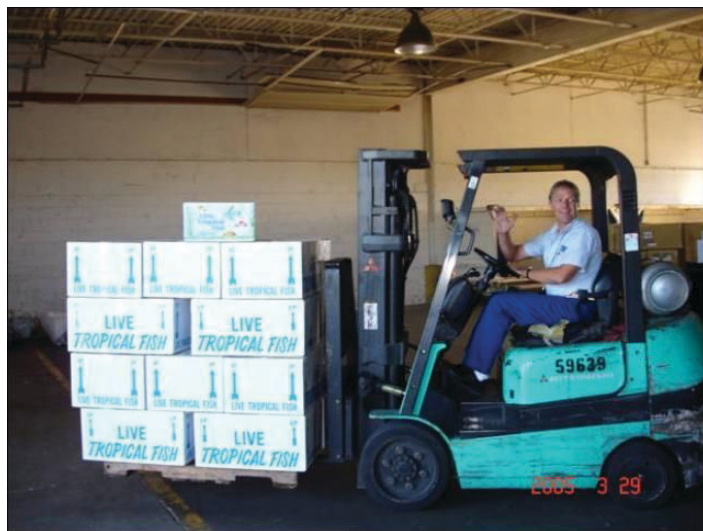
Figure 5. Moving fish with a fork-lift at the airport between planes.

There are a variety of shipping box sizes available, such as the standard “double” box that holds two full bags of fish. The size of box is determined by the number of fish being shipped. Once prepared, bags destined for local transport are put into the Florida standard ornamental “single” polystyrene boxes (17-inch x 17-inch) with lids. If fish are going further than a local buyer, the polystyrene boxes are sealed with packing tape and placed into tight-fitting cardboard outer boxes (17¼-inch x 17¼-inch) that provide added protection during shipment. Boxes are usually pre-labeled with a “live fish” stamp and are suitable for shipping via airplane or truck (Figure 5).