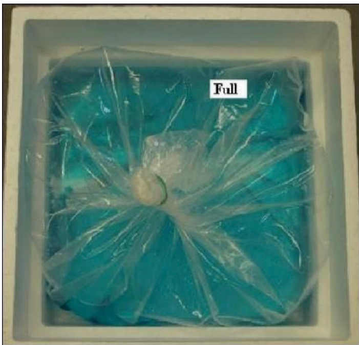
Figure 4. Full square-bottom shipping bag.

If a shipping additive is to be used, it is placed into the bag water prior to the addition of fish. Once the fish are placed into the appropriate bag, the ambient air is removed (squeezed out) and replaced with pure oxygen from an oxygen bottle. The bag is then sealed with a rubber band or other sealing device. During transport, oxygen levels decrease, and carbon dioxide levels increase as fish respire. The addition of pure oxygen to the shipping bag allows the producer to ship a greater number of fish in each bag for a longer period of time. If the sealed bag contains only ambient air, the fish quickly consume all of the available oxygen resulting in high mortalities (see UF/IFAS Fact Sheet FA-119 On-Farm Transport of Ornamental Fish ).