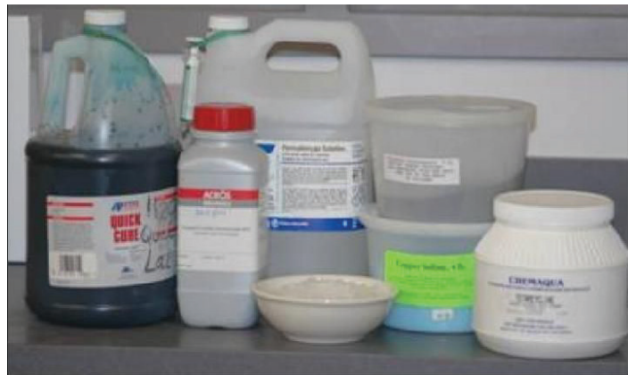
Figure 1. Treatment chemicals.

(KMnO 4 ), acriflavine neutral, methylene blue, nitrofurazone, and Quick Cure (a 99.2% formalin and 0.75% malachite green mix) (Table 1). Fish were trapped in a pond, graded, and placed into holding tanks with flow-through aerated well water. Each chemical was applied according to the industry standard to separate tanks as 11.5-hour baths, except for potassium permanganate, which was administered as a 4-hour bath.