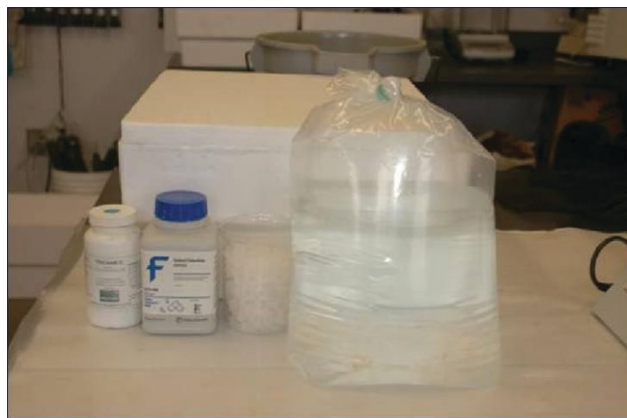
Figure 2. Shipping additives [tricaine methanesulfonate, sodium thiosulfate, salt (NaCl)] and supplies.

Experiments at the University of Florida Tropical Aquaculture Laboratory were run to test various shipping chemical additives for their effects on appearance and behavior of fish post shipping. The chemicals tested were tricaine methanesulfonate (MS-222), salt (3 ppt NaCl), methylene blue, acriflavine neutral, quinaldine, eugenol, an experimental commercial product in the form of a feed, and a water additive.