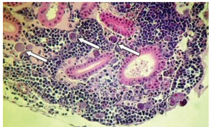
Figure 1. H&E stain. Posterior kidney from a variable platyfish ( Xiphophorus variatus ) with a megalocytivirus infection. Note large, bluish/purple (basophilic) cells, identified with arrows, which are filled with viral particles.

Special diagnostic tests are required to confirm a diagnosis of megalocytivirus in fish. Only a fish health professional or fish disease diagnostic laboratory has the equipment and expertise to make this determination. Appropriate diagnostic tests include histopathology, in which a preparation of thin fixed tissue sections are placed on a glass slide, stained, and examined under the microscope (Figure 1); virus isolation, which requires growing the virus in cell culture; testing for evidence of antibodies made by the fish against the virus; use of an electron microscope to look for viral particles themselves (Figure 2); and use of polymerase chain reactions (PCR) or DNA probes (pieces of genetic material that will bind specifically to megalocytiviruses), in order to reveal evidence of viral DNA. Because these are highly specialized tests, not all laboratories are equipped to run them. Contact your local fish health professional for diagnostic assistance.