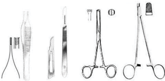
Figure 4. Recommended tools for performing minimally invasive surgery to determine the sex in sturgeon include a set of Adson-Brown tissue forceps, scalpel no. 3 with either a no. 15 or 10 blade, Allis tissue forceps, and a surgical needle holder with a pair of heavy grasping jaws.