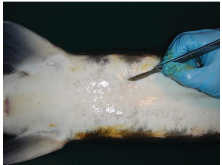
Figure 1. Location of the abdominal incision on a white sturgeon, used to visually examine the gonads during sex identification. The scalpel blade tip is located where the incision is made, approximately 3 to 4 ventral scutes anterior from the pelvic fin and midway between the ventral mid-line and scutes.

The preferred surgical incision area is below the liver on the right side of the fish, where the right gonad may be relatively easily exposed and accessed; the gonad on the left side is less accessible because it is more covered by the spleen. The cut should be some 1–5 cm off the ventral mid-line, opposite 3–5 ventral scutes anterior from the pelvic fin (Figure 1). This should place the opening directly or almost directly above the gonad. The exact location for the incision will depend greatly on the species and the unique physical characteristics of each individual fish—sturgeon display considerable variation in body conformation and scute patterns. In most cases, the gonad should be immediately visible through the incision.