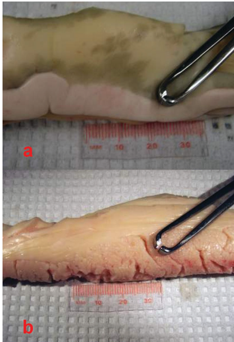
Figure 2. a. General appearance of testis in male sturgeon, and b. ovary in female sturgeon. In both, the gonad consists of both adipose (fatty) tissue and the “germinal tissue,” where the sperm or eggs develop.

is to differentiate the ovarian tissue from the adipose tissue. The female ovarian tissue is typically darker than the testis, usually an off-white to yellowish color. However, the distinguishing characteristics are the “ovigerous folds”—the compartments in which the eggs develop. These are shaped in folds so that they look somewhat like draped cloth. Seen from above, ovigerous folds resemble keys on a piano. The ovarian tissue also has a grainy appearance formed by the eggs developing within the folds (Figures 2b and 3a). Some fatty tissue is present in the male gonads, but the testicular tissue is smooth, turgid, and whitish in color; mature testes look like large, milky-white lobes (Figures 2b & 3b).