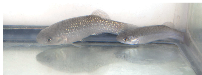
Figure 1. Male (left) and female (right) Gulf killifish, Fundulus grandis .

4 inches (10.2 cm). An unpublished University of Florida IFAS survey identified the Gulf killifish and two related species as having the highest priority for development of an aquaculture-based live bait industry. Gulf killifish have distinctive superior or upturned mouths that allow them to feed efficiently on floating prey or diets. As adults, male Gulf killifish, as pictured on the left in Figure 1, generally have iridescent speckles on the sides of their bodies and a white or transparent strip on the distal (back) edge of an otherwise pigmented caudal (tail) fin. Breeding males will acquire a “beard,” or darkening of the underside of the head and gill plates. Females, as depicted on the right in Figure 1, maintain a drab olive-brown color throughout the year with no speckles.