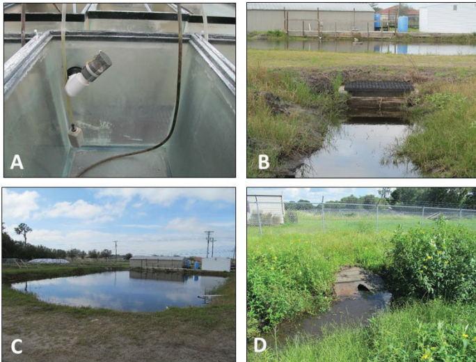
Figure 3. Critical Control Points (CCPs) to prevent non-native species escape at an example facility. A. Screen systems to retain fish inside of greenhouse. B. Control structure separating interior ditch from detention pond. C. Detention pond stocked with predatory fish. Has a control structure as outlet to county ditch. D. Discharge to county ditch.

Different structures vary as well, especially in their ability to contain various species of fish. Livebearers, for example, escape from unscreened tank standpipes and through ditch structures with surface flow (e.g., standpipes or riser boards; Figure 3). This may be due to the fact that many livebearers are surface-oriented and will follow water flow. Research into the effectiveness of different types of barriers on different fish groups would help producers choose appropriate barriers for their facilities.