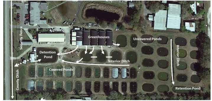
Figure 1. Representative fish farm layout. Water flow direction is indicated by arrows. Effluent from buildings and greenhouses flows into an interior ditch that empties into a detention pond. The detention pond discharges to the county ditch, the only surface water connection between the farm and the outside environment. Ponds are periodically dewatered by pumping into one of the interior ditches. The facility has security fencing, locked gates, and security lighting.

including as fertilized eggs, fry, juveniles, and adults. In practice, free-swimming stages (juveniles and adults) are far more likely to escape.