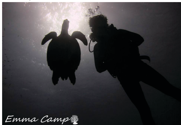
Figure 8. A diver observes a sea turtle in its natural habitat. Dive responsibly by maintaining neutral buoyancy and clasping your hands to avoid touching the reef.

If you're diving in a warm climate, consider ditching the gloves! Gloves have been shown to make divers more likely to grab the reef underwater (Camp and Fraser 2012). If you must use gloves, keep your arms crossed during your dive—you'll improve your buoyancy skills and be less tempted to touch (Figure 8).