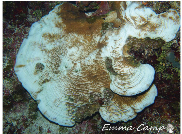
Figure 3. A Caribbean coral colony affected by bleaching. White portions of the colony have lost the beneficial algae that provide the coral with energy.

One of the main stressors facing coral reefs is climate change. Burning fossil fuels results in the release of carbon dioxide ( \text{CO}_2 ), much of which accumulates in the atmosphere or is absorbed by the ocean. In the atmosphere, \text{CO}_2 traps heat from the sun after it is reflected off the planet's surface. This results in the warming of the entire planet, including the oceans. This process is called the "greenhouse effect." When oceans become warmer than usual, reef-building corals can lose the important algae that live within their tissues and give them their color and most of their food. When this occurs, the coral becomes stark white, leaving it with a "bleached" appearance (Figure 3). This phenomenon, known as coral bleaching, has become more common over time (Hoegh-Guldberg 1999). Bleaching is expected to happen more often as oceans continue to warm (Fabina, Baskett, and Gross 2015). Although a coral can sometimes recover, bleaching often leads to death (Wilkinson 1998).