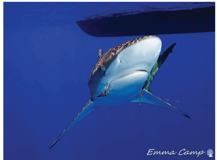
Figure 5. A silky shark off the coast of Florida with a hook caught in its mouth. Sharks are top predators that help keep ocean ecosystems healthy.