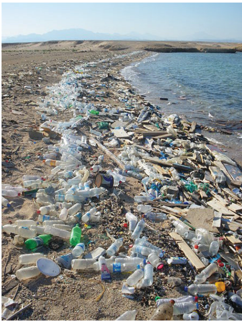
Figure 4. Garbage, mostly plastic bottles, accumulated on a beach. Tides can wash these items back into the ocean, where they can harm corals and other marine life. Participating in a beach cleanup can reduce this risk while making local beaches more beautiful.

Finally, help keep garbage on shorelines (Figure 4) out of the ocean by participating in a local beach, river, or roadside cleanup. Helping with the plastic problem can also be as simple as bringing a spare bag along to collect litter on your next walk! Contact your local UF/IFAS Extension office for more information and to find local cleanup events in your area.