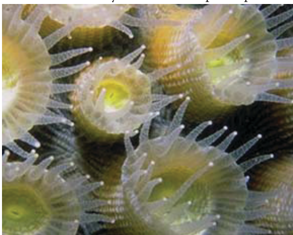
Figure 1. A close-up photo of a coral colony, showing several individual coral animals. Jellyfish-like tentacles extend from each animal's body.

Coral reefs are one of the most diverse ecosystems on the planet. Corals are small animals related to jellyfish (Figure 1). Large groups of these animals live together and form huge interconnected colonies (Figure 2). Many corals have a special relationship with a type of single-celled algae. The algae live inside the coral's body and produce most of their host's food through photosynthesis. Coral reefs are often found in shallow, tropical seas where these algae have enough sunlight to make food. The algae also give the coral its color—a healthy coral is typically yellow to brown (Figures 1 and 2). Using energy from the algae, some corals form reefs by building an external skeleton from a mineral called calcium carbonate. These reefs are an essential habitat for a wide variety of animal and plant species.