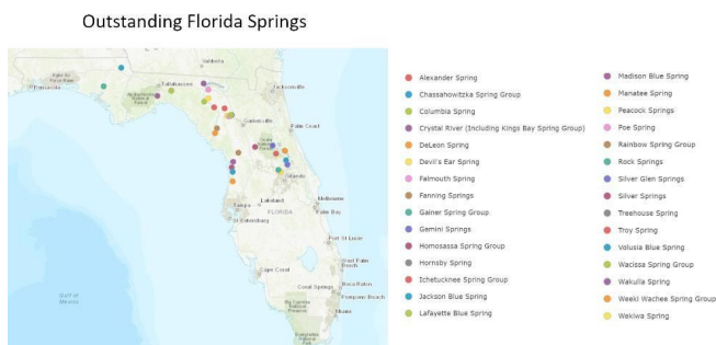
Figure 1. Map of Florida's Outstanding Florida Springs. Credit: Mary Lusk, UF/IFAS; Source: FDEP