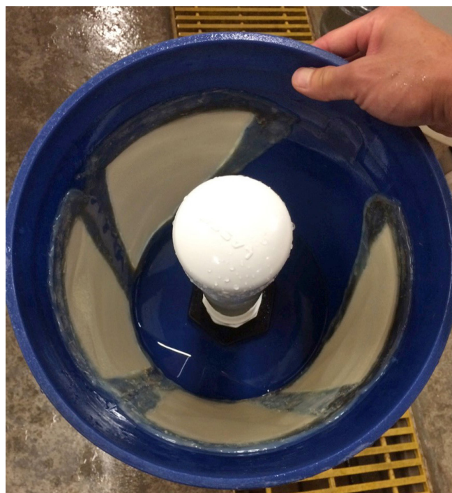
Figure 6. Upwelling pre-filter egg collector with a standpipe and cap used when removing the bucket for cleaning and egg collection. The standpipe prevents contents from exiting the bucket and entering the water flowing into the filtration system.