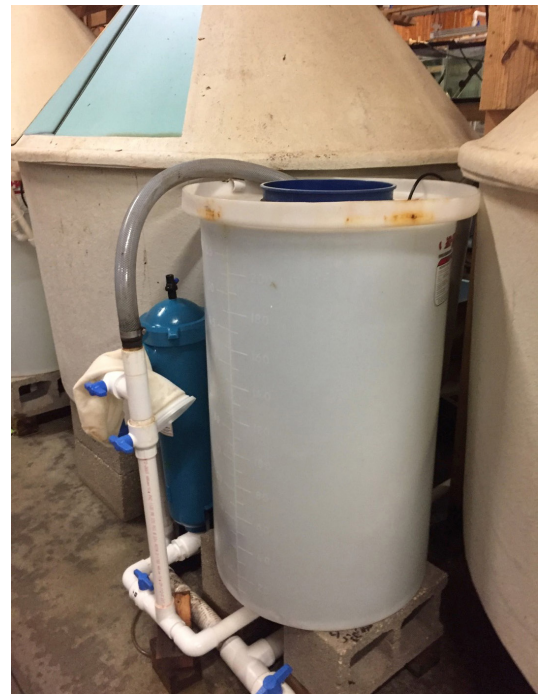
Figure 2. Culture tank (left rear) and the sump/collection tank (front center) containing an upwelling pre-filter egg collector.

Aquaculture systems can have overflows that lead directly to a sump. A simple way to test if spawning is occurring is to place a fine mesh net between the overflow and the sump where all, or most, of the water flows. It may also be possible to increase the water level in the sump so that the bottom of the net and the captured eggs are underwater, reducing potential damage. Ideally, a more efficient and less damaging method of capturing eggs should be used. However, this is a quick and simple method to determine