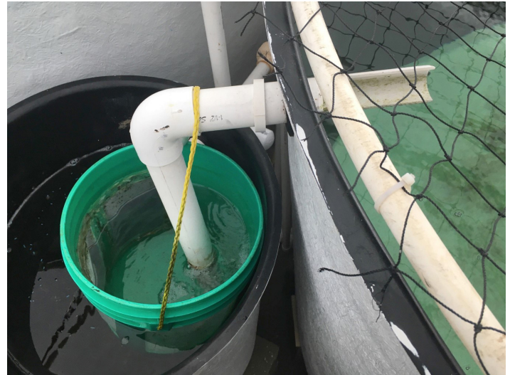
Figure 1. Overflow pre-filter egg collector with water overflowing from the skimmer pipe within the tank directly into screen mesh lined egg collector. Note the skimmer pipe in the tank is cut in half to collect eggs as they float towards the collector.

accommodate higher water flow rates and higher volumes of eggs spawned.