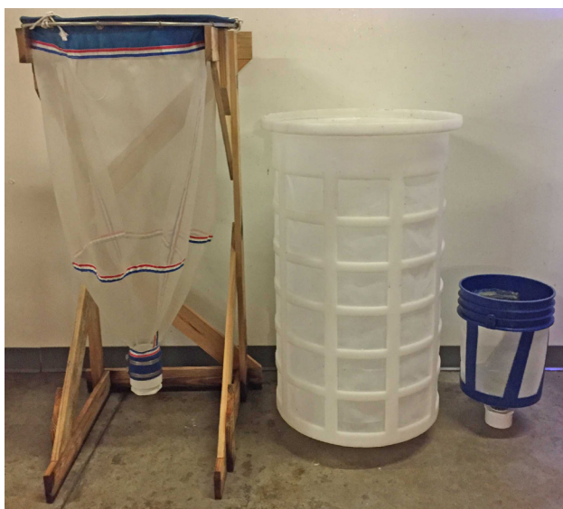
Figure 4. Alternatives to a bucket include a modified plankton tow net or a plastic barrel. These will provide greater mesh surface area and will accommodate larger spawns than a bucket.