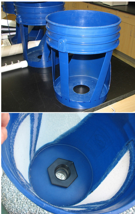
Figure 7. (Top) Five gallon bucket with openings removed and vertical areas for nylon mesh screen attachment. (Bottom) Egg collector bucket showing attached nylon mesh screen and bulkhead for attachment to discharge pipe within the sump.

If you are constructing an upwelling egg collector, attach a bulkhead to the bottom of the bucket (Figure 7). Then, attach a male PVC slip adapter to the bulkhead on the outside of the bucket, which can be slipped onto the standpipe within the sump. Use a hole-saw, a drill, or a jigsaw to remove the proper sized hole for the bulkhead. Scrape and sand smooth all the rough edges around the hole.