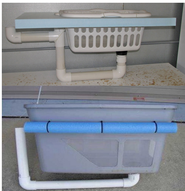
Figure 3. Photos of floating airlift egg collectors. (Top) The intake can be fine-tuned by placing a PVC pipe of appropriate lengths into the intake elbow to ensure it is ~1 cm below the water surface when it skims eggs from the surface. (Bottom) Airlift egg collector constructed of a plastic bin and floatation provided by a swimming pool noodle.

Upwelling egg collectors (Figures 2 and 5) are typically designed to collect eggs from both the surface and bottom drains. By collecting both floating and sinking pelagic eggs, you are better able to understand the spawning efficiency of your broodstock. To remove the eggs from the collector, the bulkhead fitting should be capped with a PVC pipe or plug (Figure 6). Then the collector can be removed and the eggs poured and rinsed into a container.